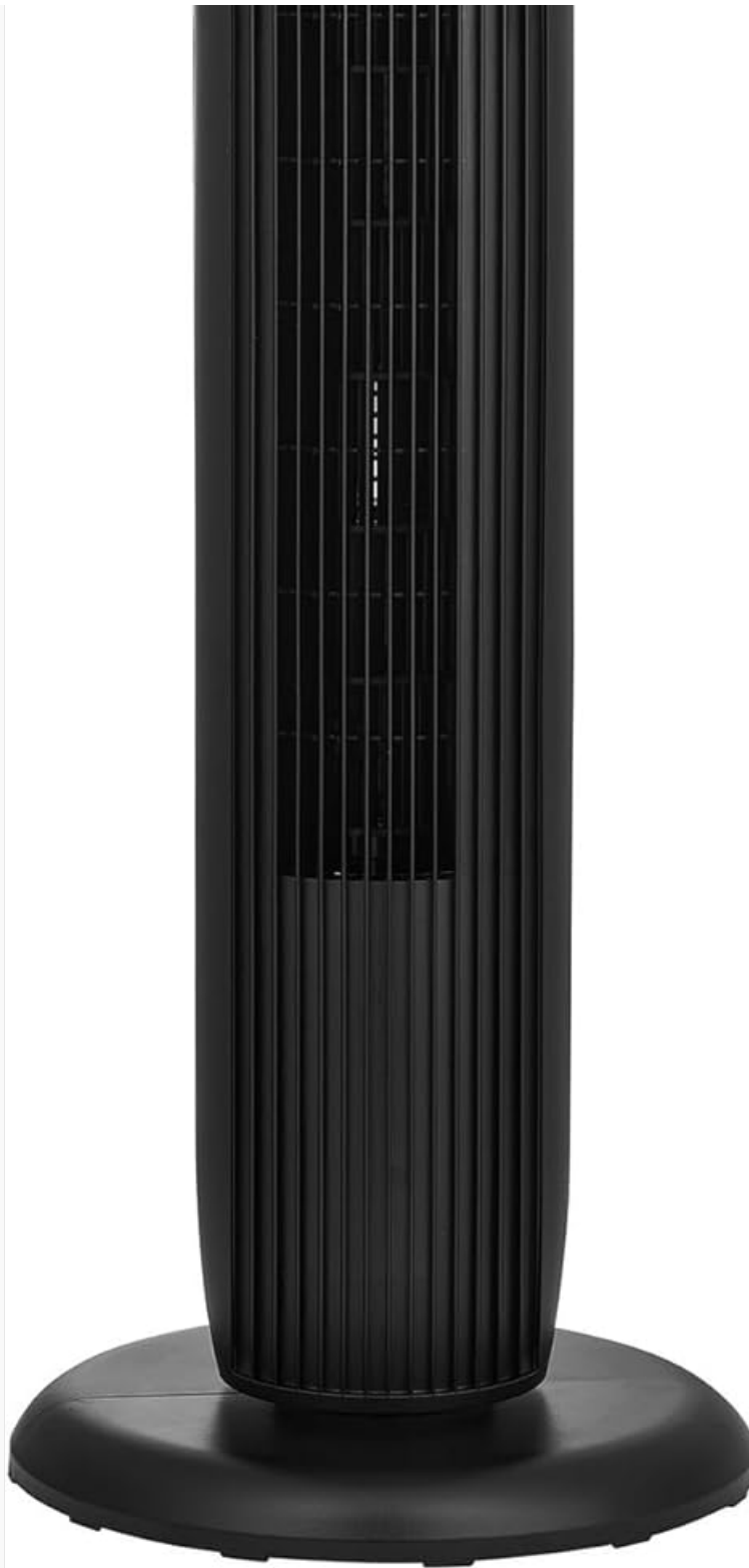
Figure 1: P L-RA 36" Oscillating Tower Fan. This image shows the sleek, black tower fan from the front, highlighting its tall, slender design and the vertical grille.