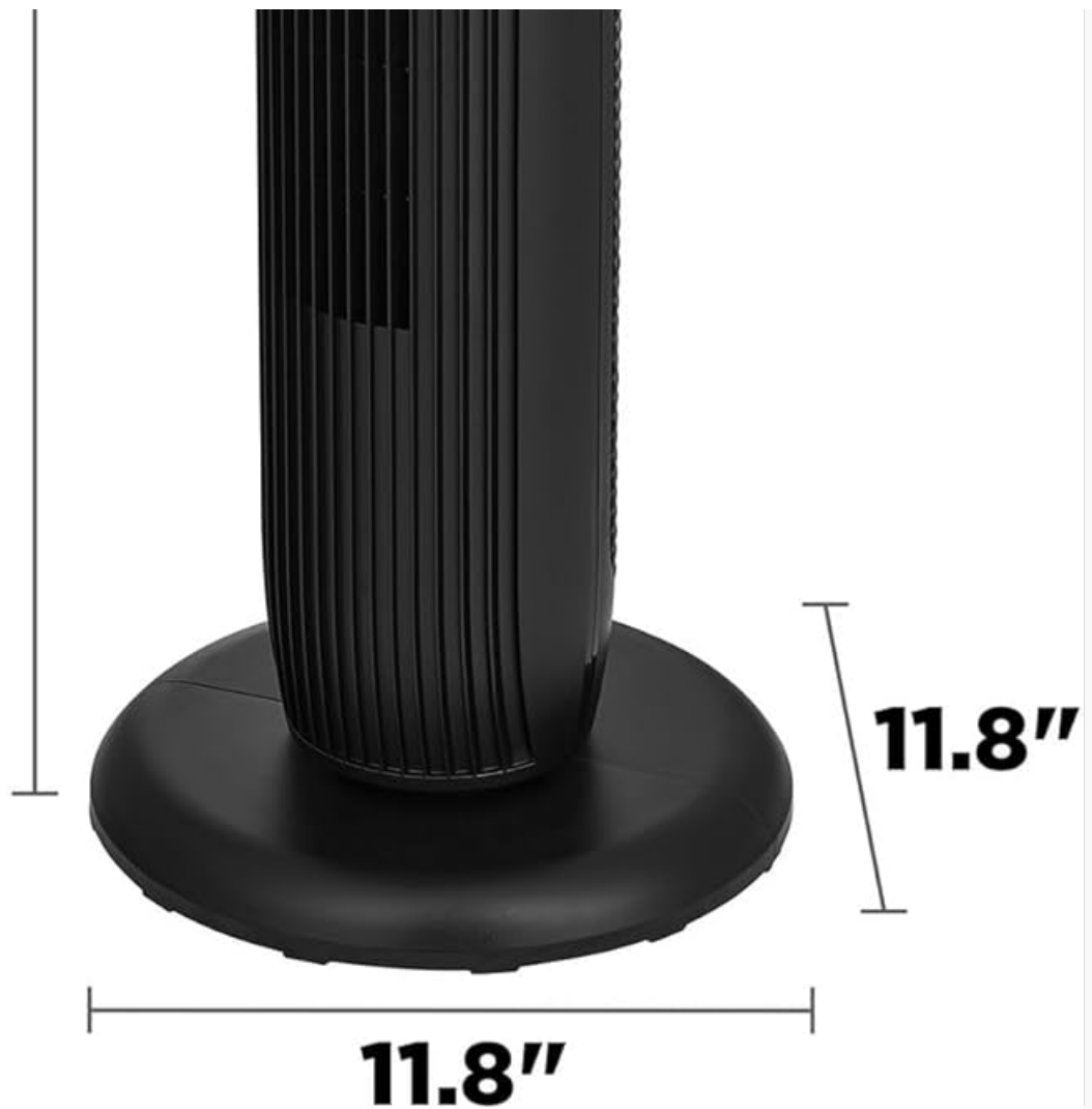
Figure 2: Fan Dimensions. This image illustrates the height (36.2 inches) and base dimensions (11.8 inches by 11.8 inches) of the tower fan, useful for placement.