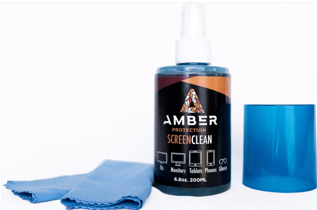
Figure 6.1: Amber Protection HDTV Screen Cleaner Kit.