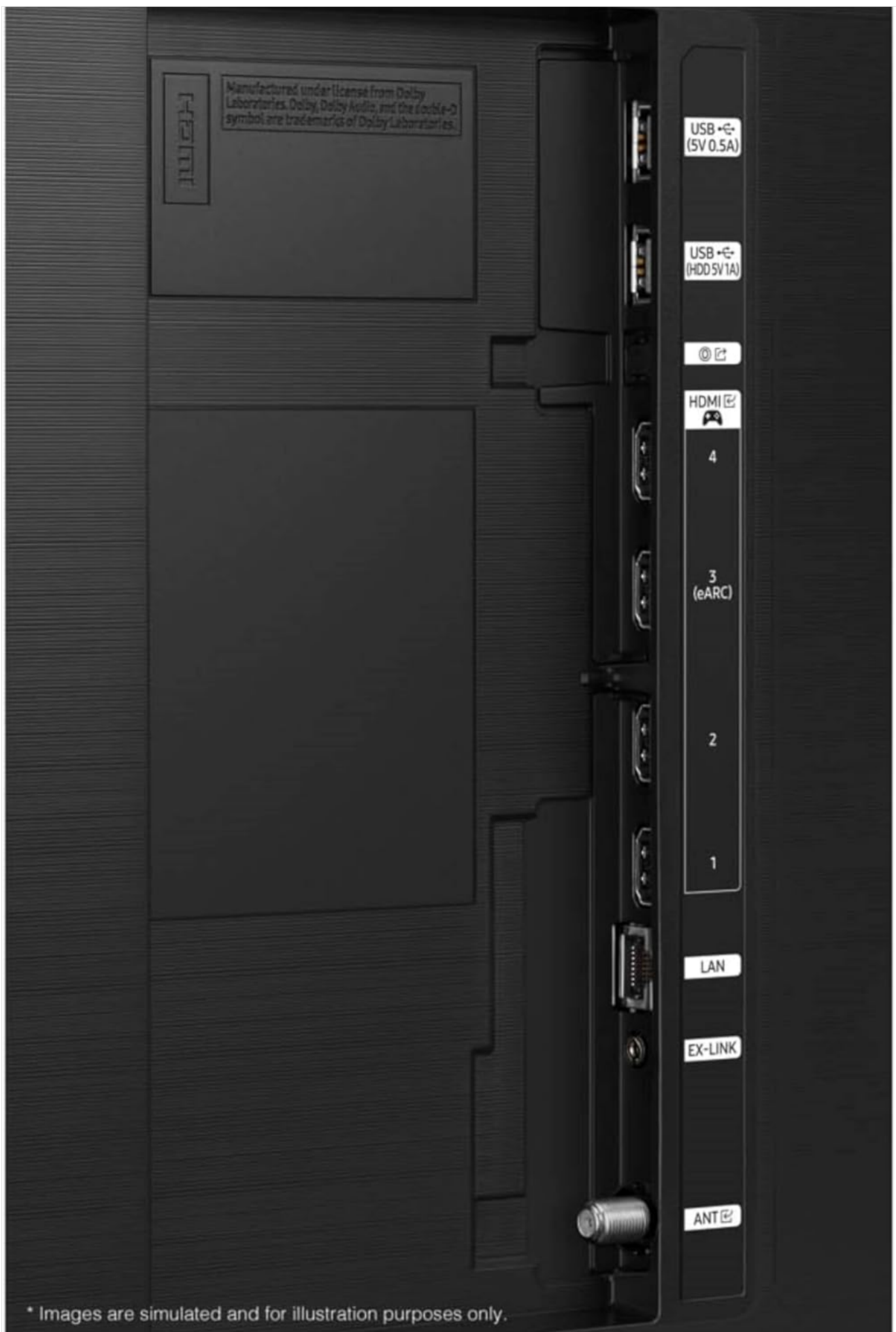
Figure 4.1: Rear view of the TV with input ports.