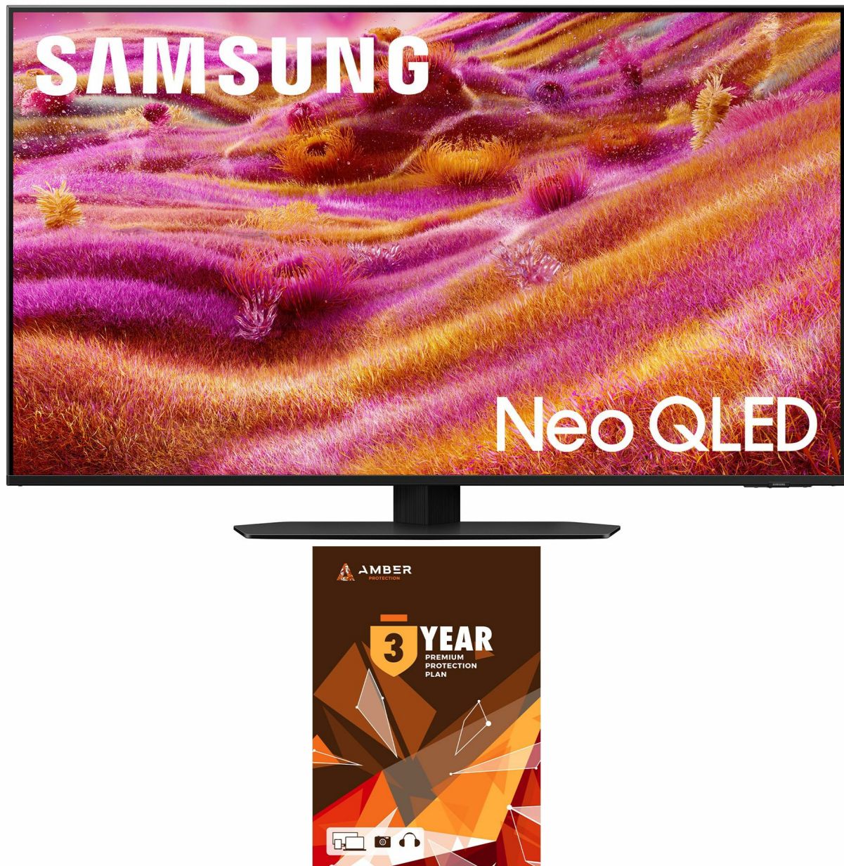
Figure 1.1: Front view of the Samsung QN43QN90FA 43-inch Neo QLED 4K Smart TV.