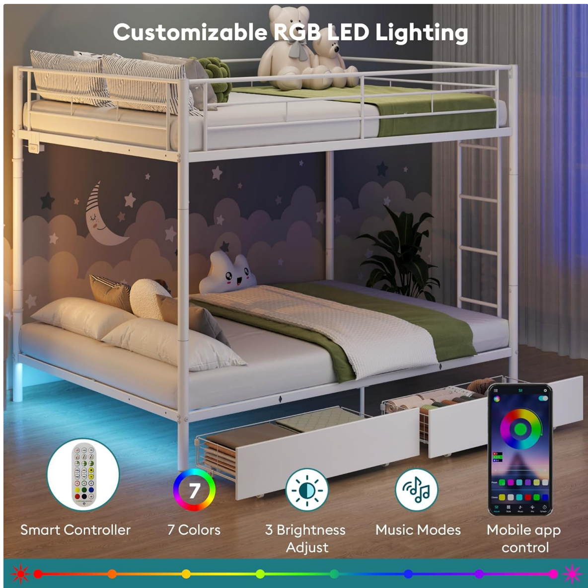
Figure 4.1: Customizable RGB LED Lighting features.