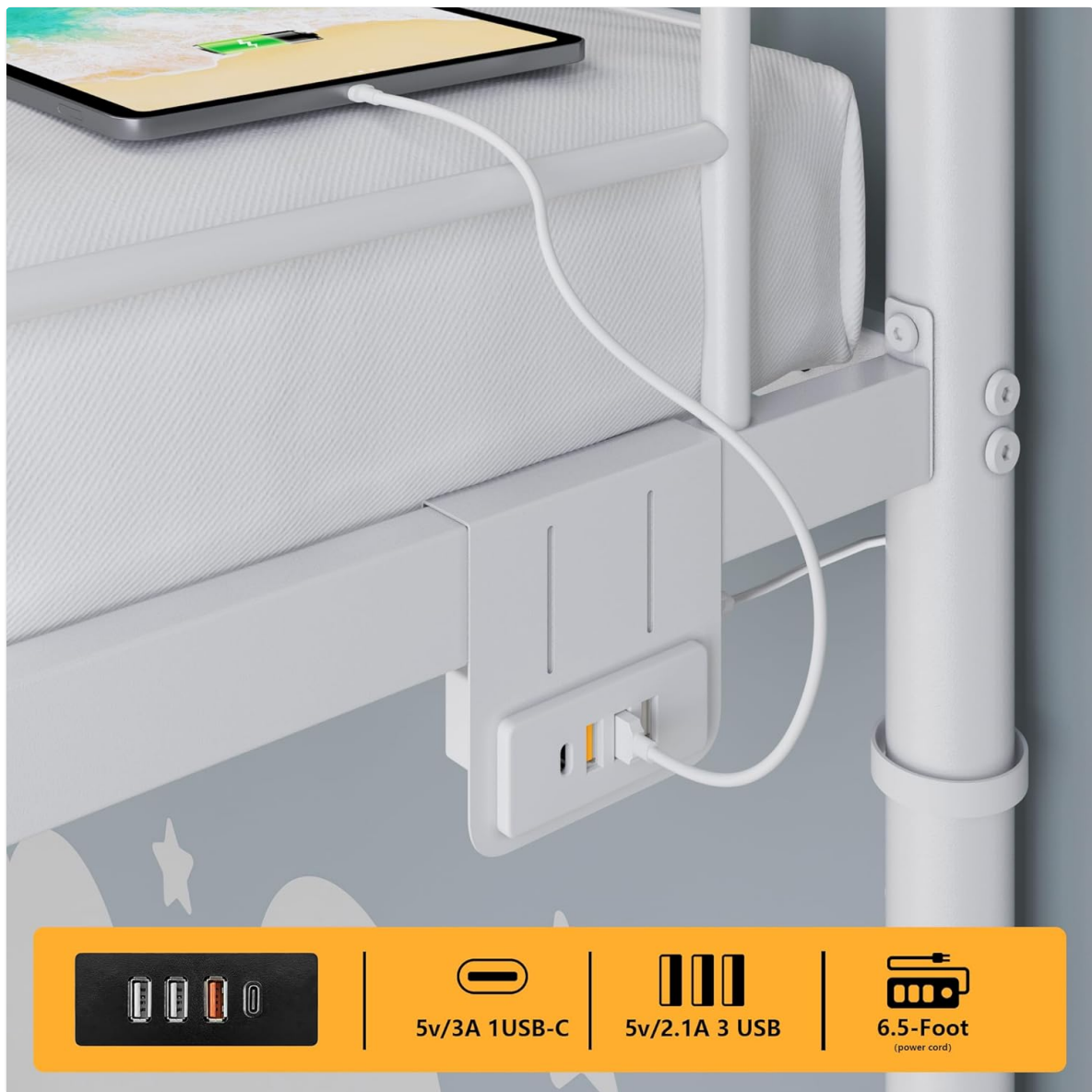
Figure 4.2: USB Charging Station with multiple ports.