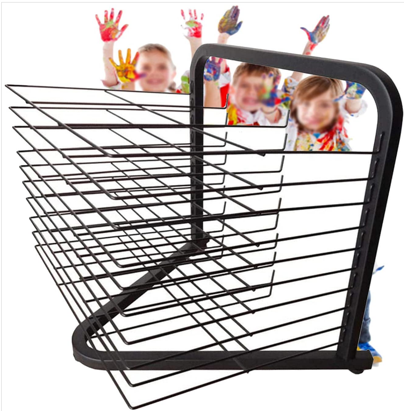
Figure 1: The Generic 10-Tier Art Drying Rack. This image shows the overall design of the drying rack, featuring its ten tiers and sturdy frame, with children's artwork displayed on the shelves.

The Generic 10-Tier Art Drying Rack is constructed from robust, powder-coated metal wire, designed for durability and stability. It provides a practical solution for organizing and drying art projects efficiently. The rack's design accommodates various art materials, from small sheets to standard-sized posters and watercolor paper.