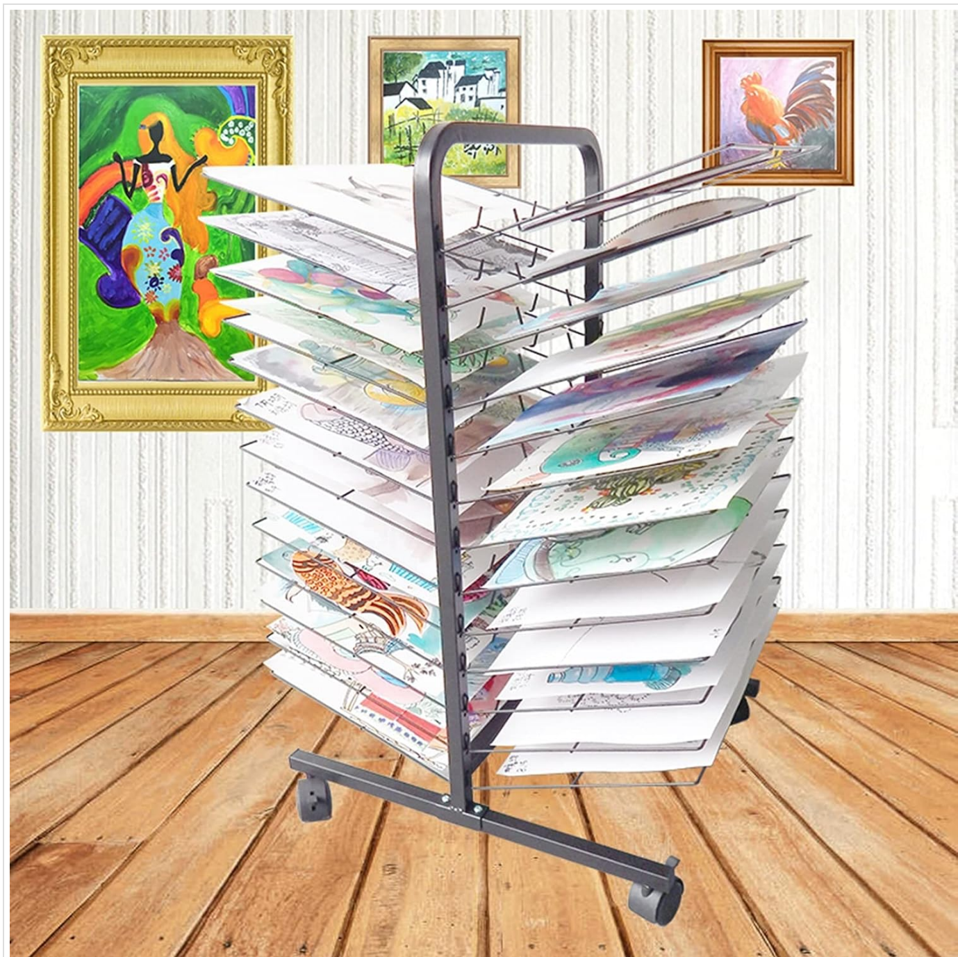
Figure 4: A fully loaded art drying rack showcasing its ability to hold multiple pieces of artwork simultaneously in a studio environment.