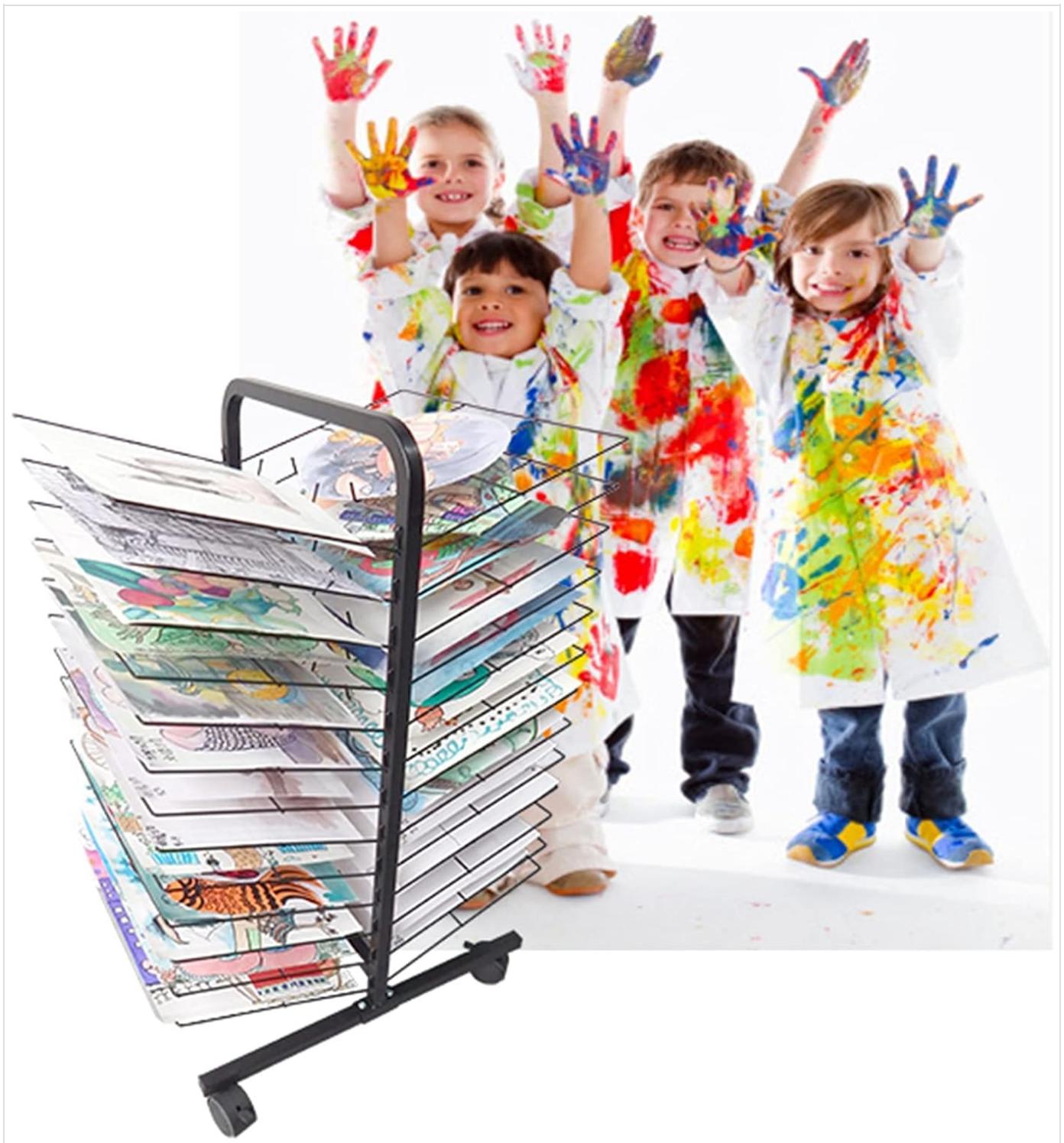
Figure 3: The drying rack loaded with various art papers, demonstrating its capacity and utility in an art setting.