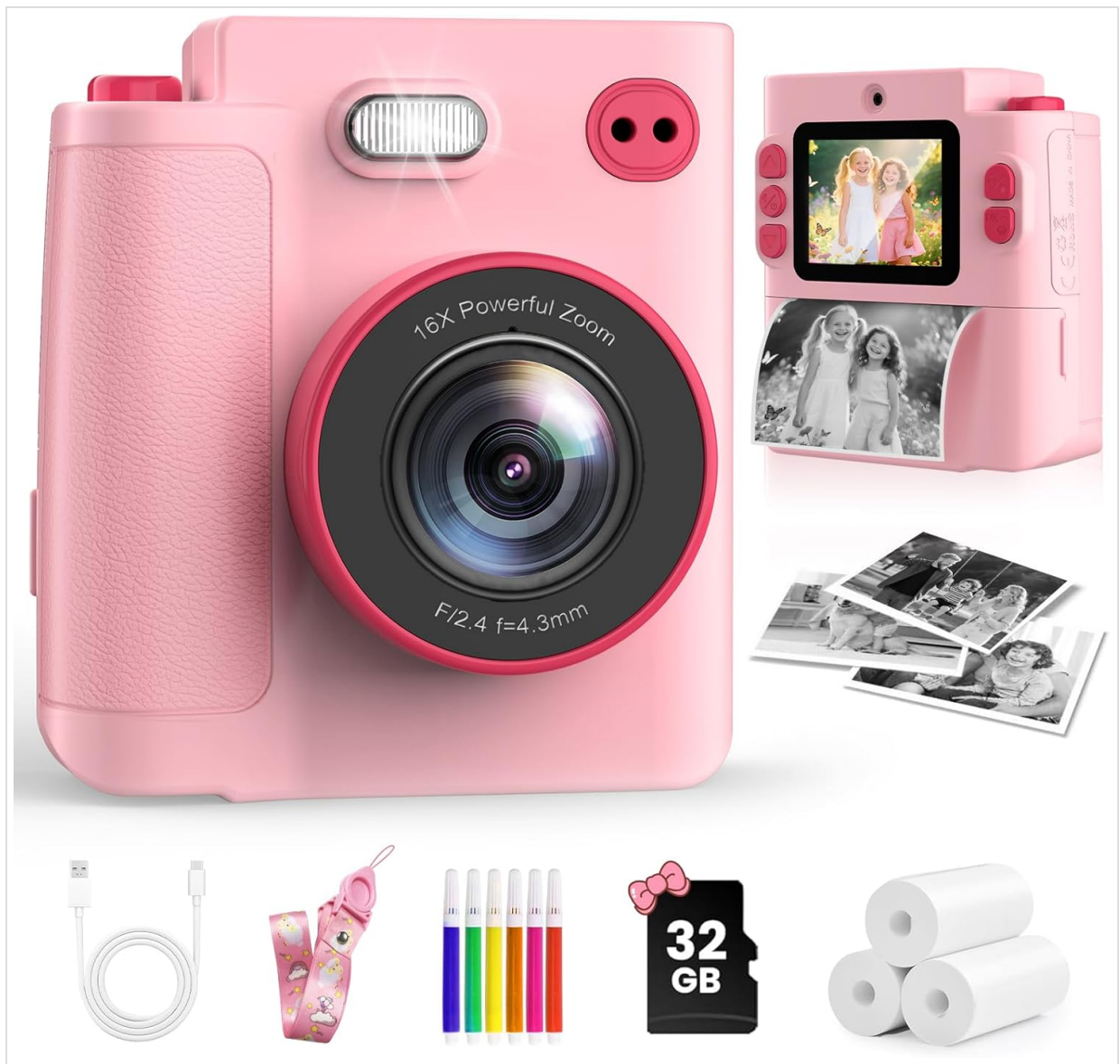
Figure 1: Front view of the MYSTILUCK Kids Camera X8D, highlighting the main lens, flash, and shutter button.