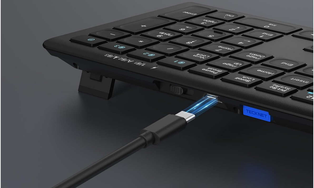
Image: The keyboard's USB-C port connected to a charging cable, illustrating its quick charge capability for extended use.