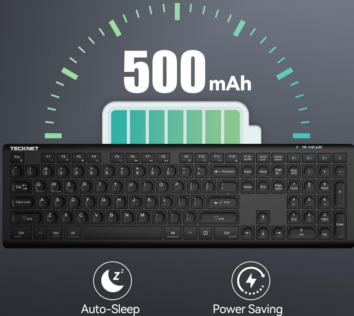
Image: Visual representation of the keyboard's 500mAh rechargeable battery, highlighting its auto-sleep and power-saving features.

Video: A brief overview of the TECKNET Bluetooth Wireless Keyboard, showcasing its rechargeable nature and key features.