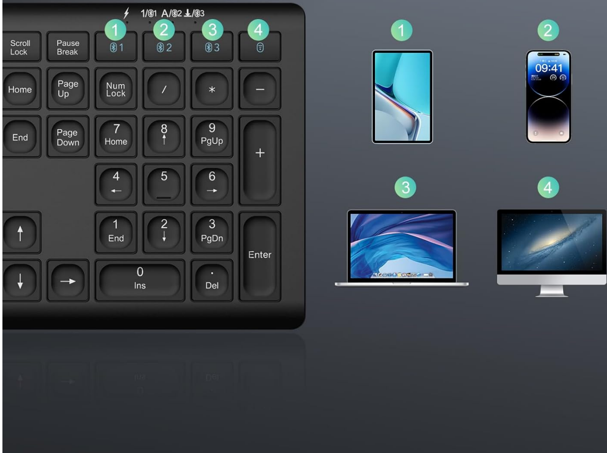
Image: The TECKNET KB005 keyboard highlighting its ability to connect to four different devices simultaneously via 2.4G and Bluetooth modes.