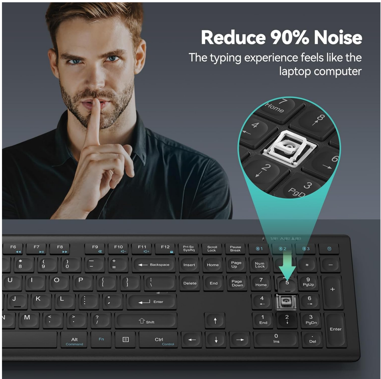
Image: Highlighting the quiet typing experience of the keyboard, featuring a close-up of a scissor-switch key mechanism and a 'Reduce 90% Noise' label.