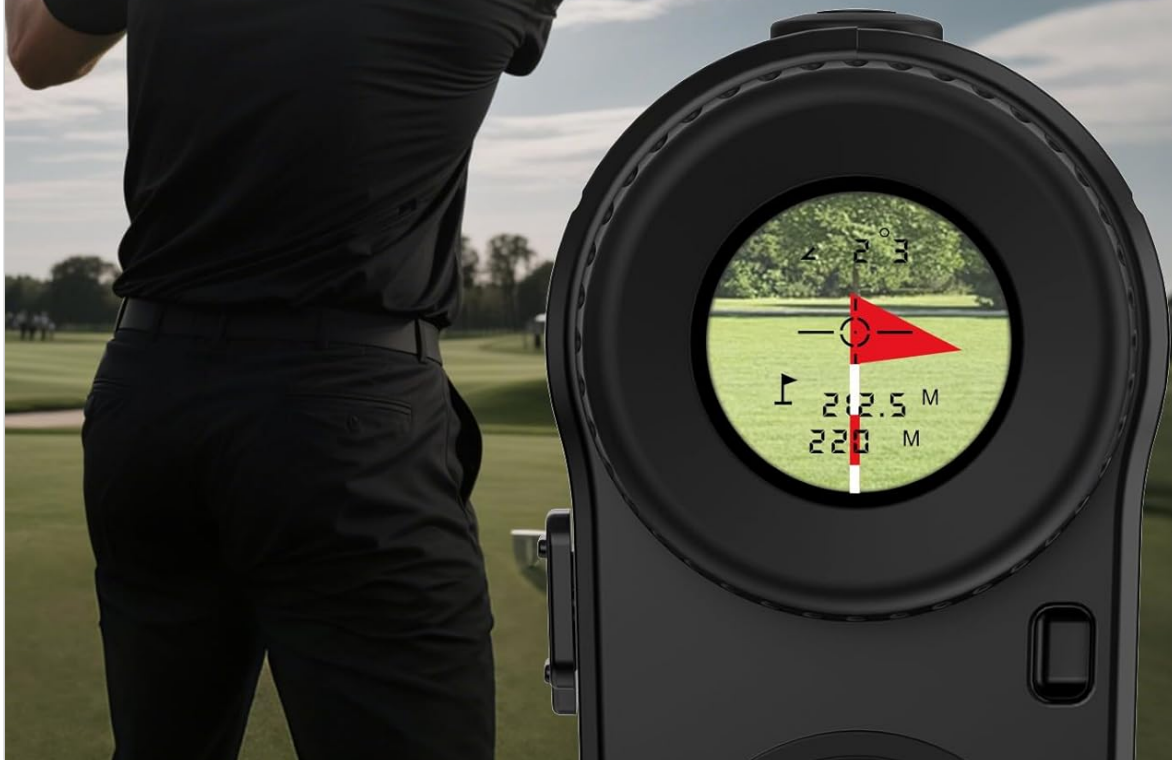
Image 7: Flag Lock Mode in Use. This image shows a golfer using the rangefinder, with an overlay demonstrating the flag lock feature and its ability to lock onto a flag within 250 yards.