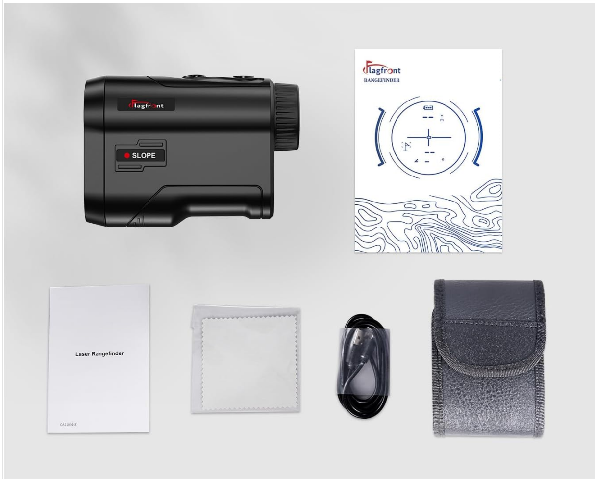
Image 3: Package Contents. This image displays all items included in the product package: the rangefinder, a soft case, a Type-C cable, a lens cloth, and the user manual.