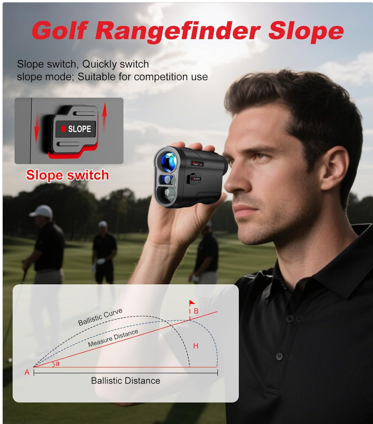
Image 6: Slope Switch Functionality. This image demonstrates the physical slope switch on the rangefinder, allowing users to quickly enable or disable the slope compensation feature for competition or practice.