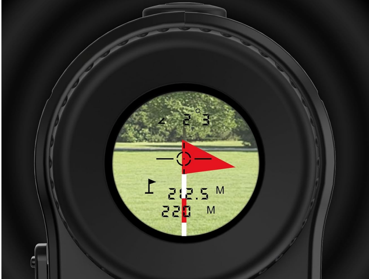
Image 2: Rangefinder Display View. This image illustrates the internal display of the rangefinder, showing target reticle, distance readings in yards and meters, and flag lock indicator.