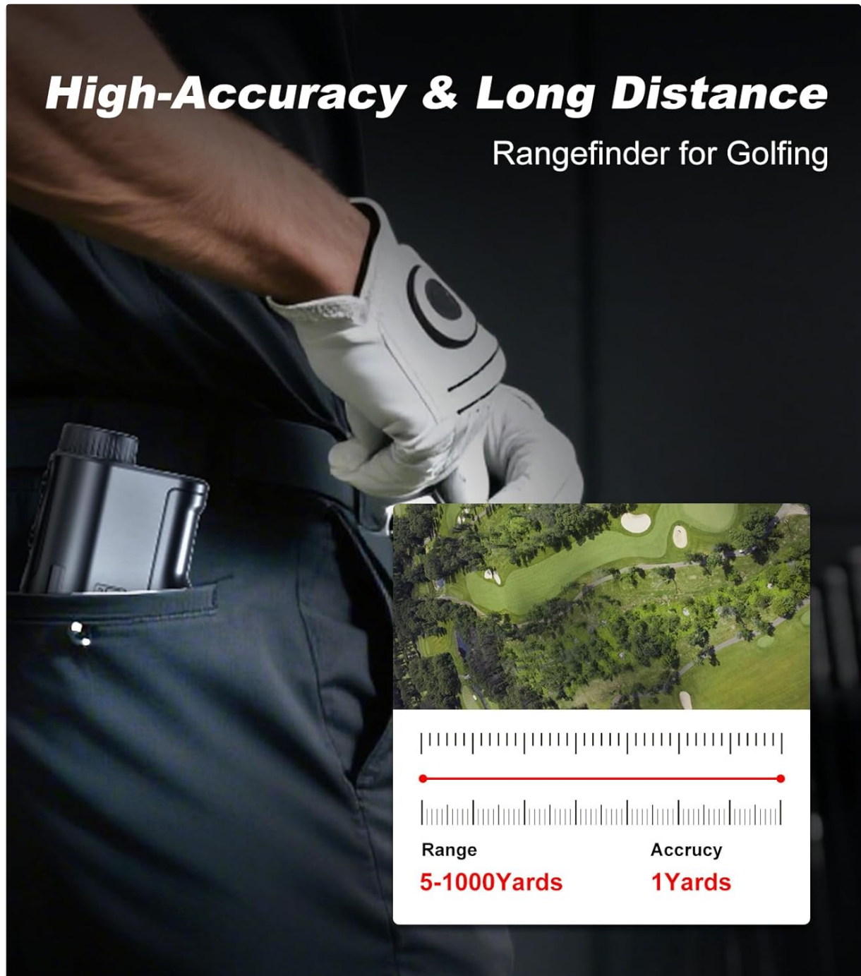
Image 5: High Accuracy and Long Distance Measurement. This graphic illustrates the rangefinder's capability to measure distances from 5 to 1000 yards with 1-yard accuracy, emphasizing its precision for golfing.

3. For continuous scanning, press and hold the measurement button while sweeping across multiple targets.