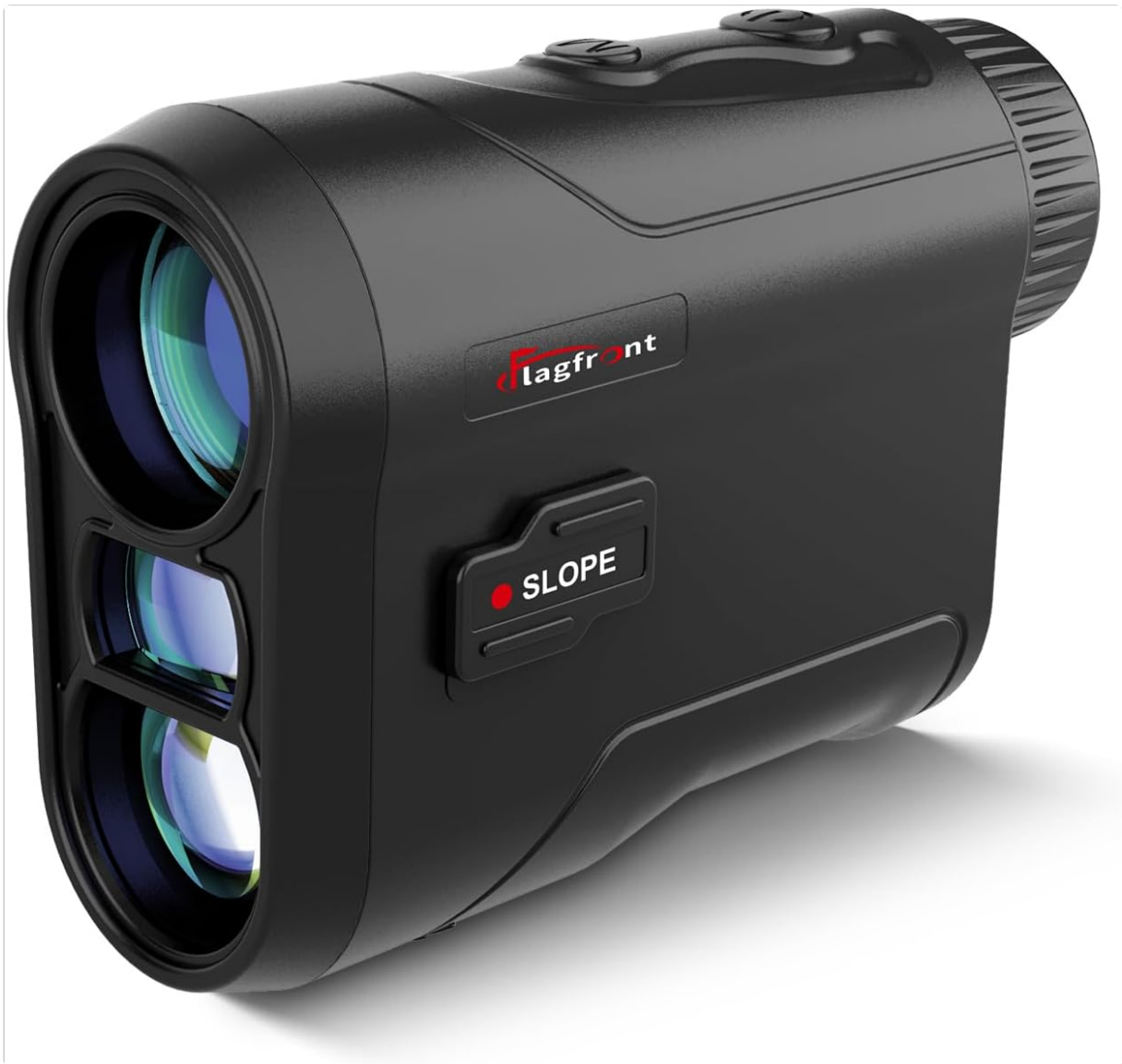
Image 1: Flagfront Golf Rangefinder. This image displays the overall design of the rangefinder, featuring its compact black casing and optical lenses.