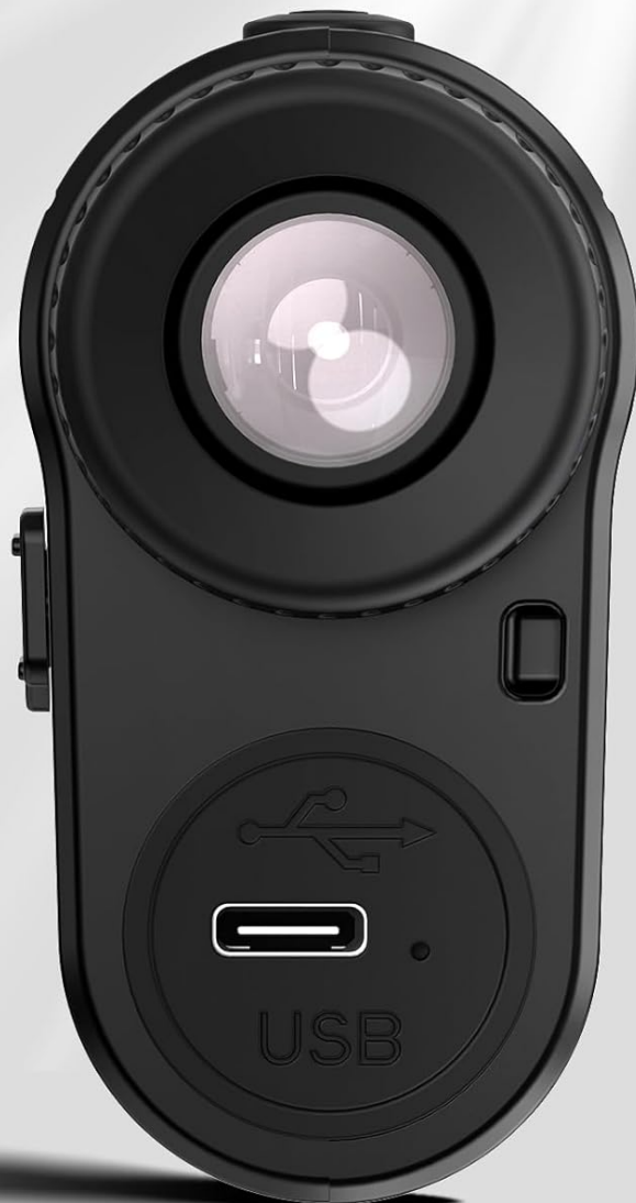
Image 4: Rechargeable Battery Port. This image highlights the Type-C USB charging port located on the rangefinder, indicating its rechargeable nature.