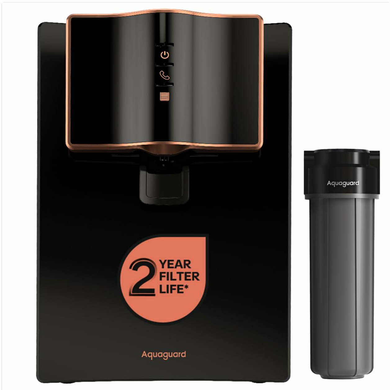
Image: Aquaguard Enrich Marvel RO+UV+UF 2X Water Purifier, showcasing its sleek black design with copper accents and the external mega sediment filter.