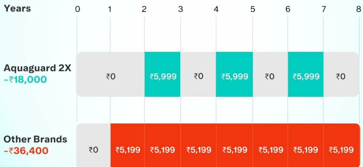
Image: A chart comparing filter replacement costs over years, highlighting the extended filter life of Aquaguard 2X.