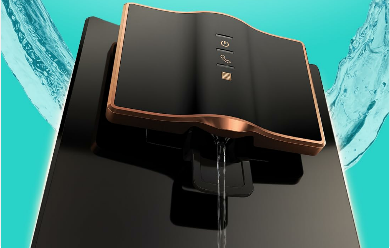
Image: Close-up of the Aquaguard Enrich Marvel water purifier dispensing water, highlighting its water-saving RO technology.

Water Saving RO Technology for Efficient Purification