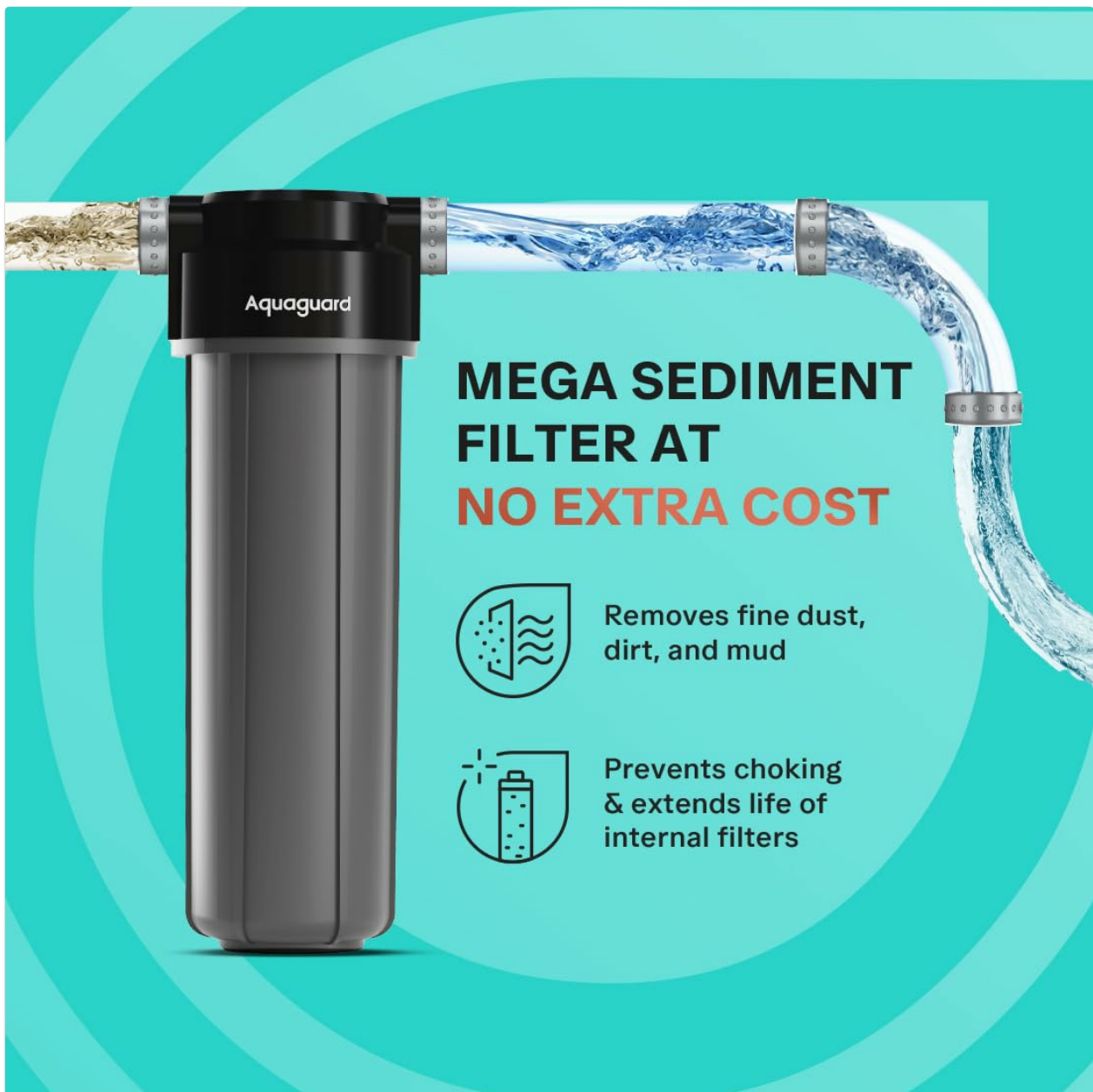
Image: The external Mega Sediment Filter, illustrating its role in removing fine dust, dirt, and mud to prevent choking and extend the life of internal filters.