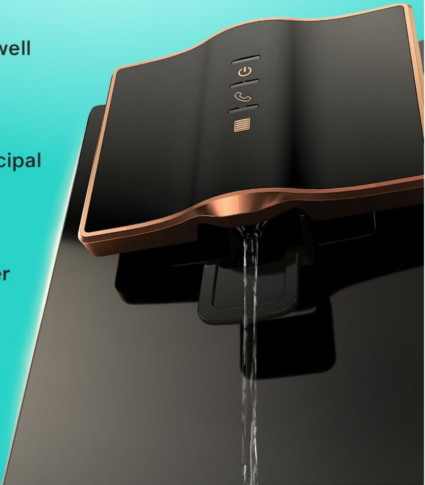
Image: Aquaguard Enrich Marvel water purifier with icons indicating suitability for borewell, municipal, and tanker water sources.