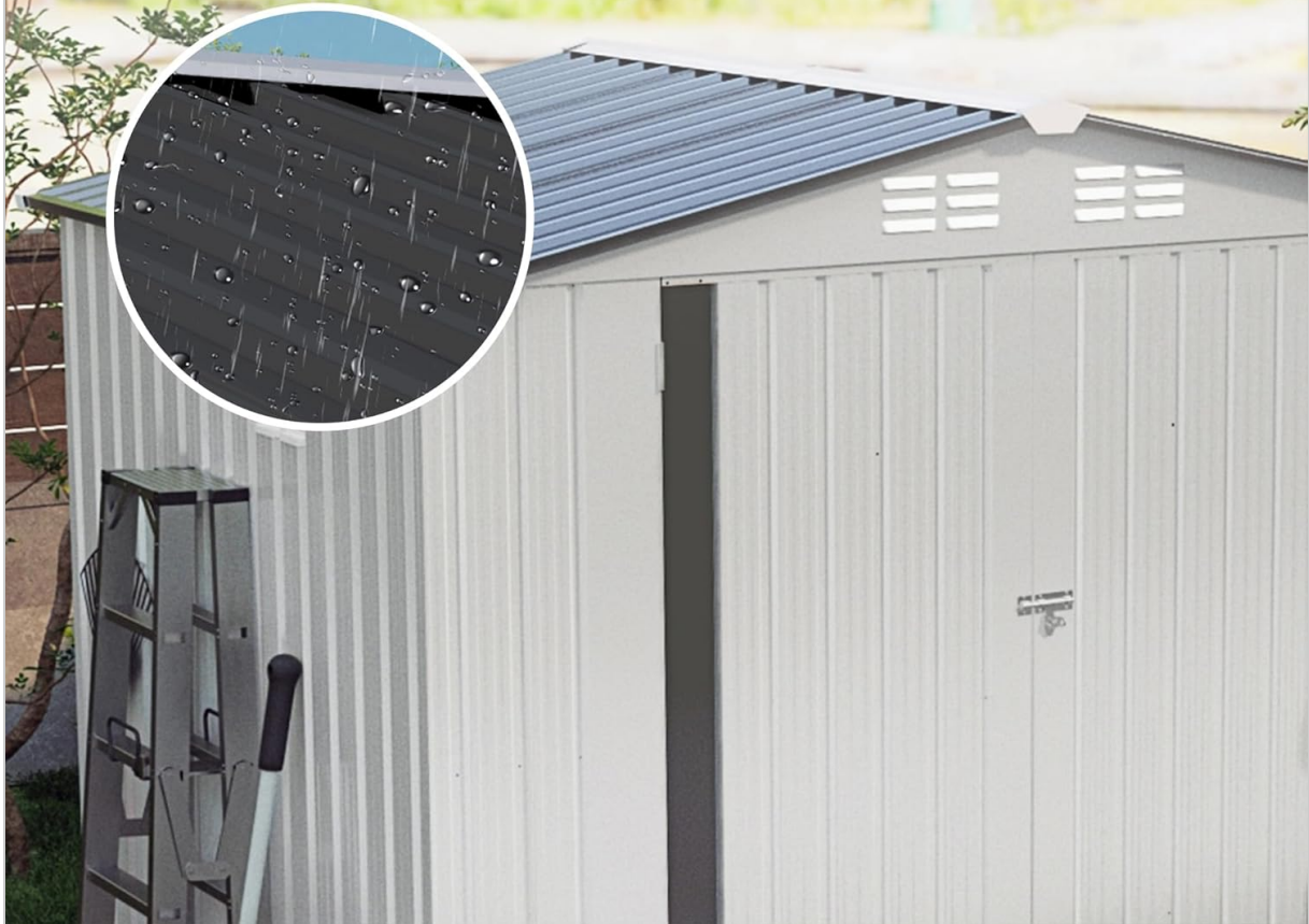
Image: The pitched roof of the storage shed, demonstrating its design for insulation from wind and rain, with features like no gaps and grooves to prevent water accumulation.