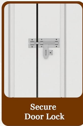
Secure Door Lock