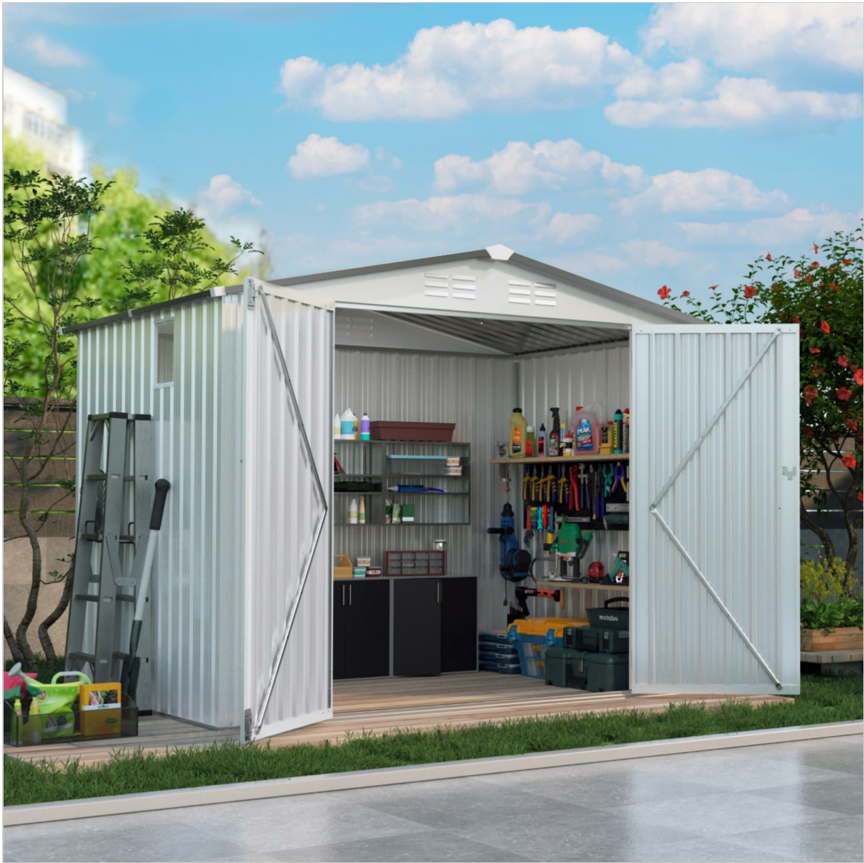
Image: The Vigo huseeo 8x5.7x6FT Galvanized Steel Outdoor Storage Shed, showcasing its overall design and size.