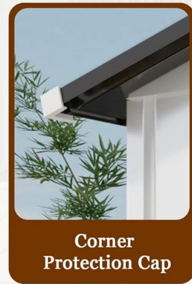
Corner Protection Cap

Image: A side view of the shed highlighting the four air vents for effective odor expulsion and fresh air circulation, along with a visual window for natural light.