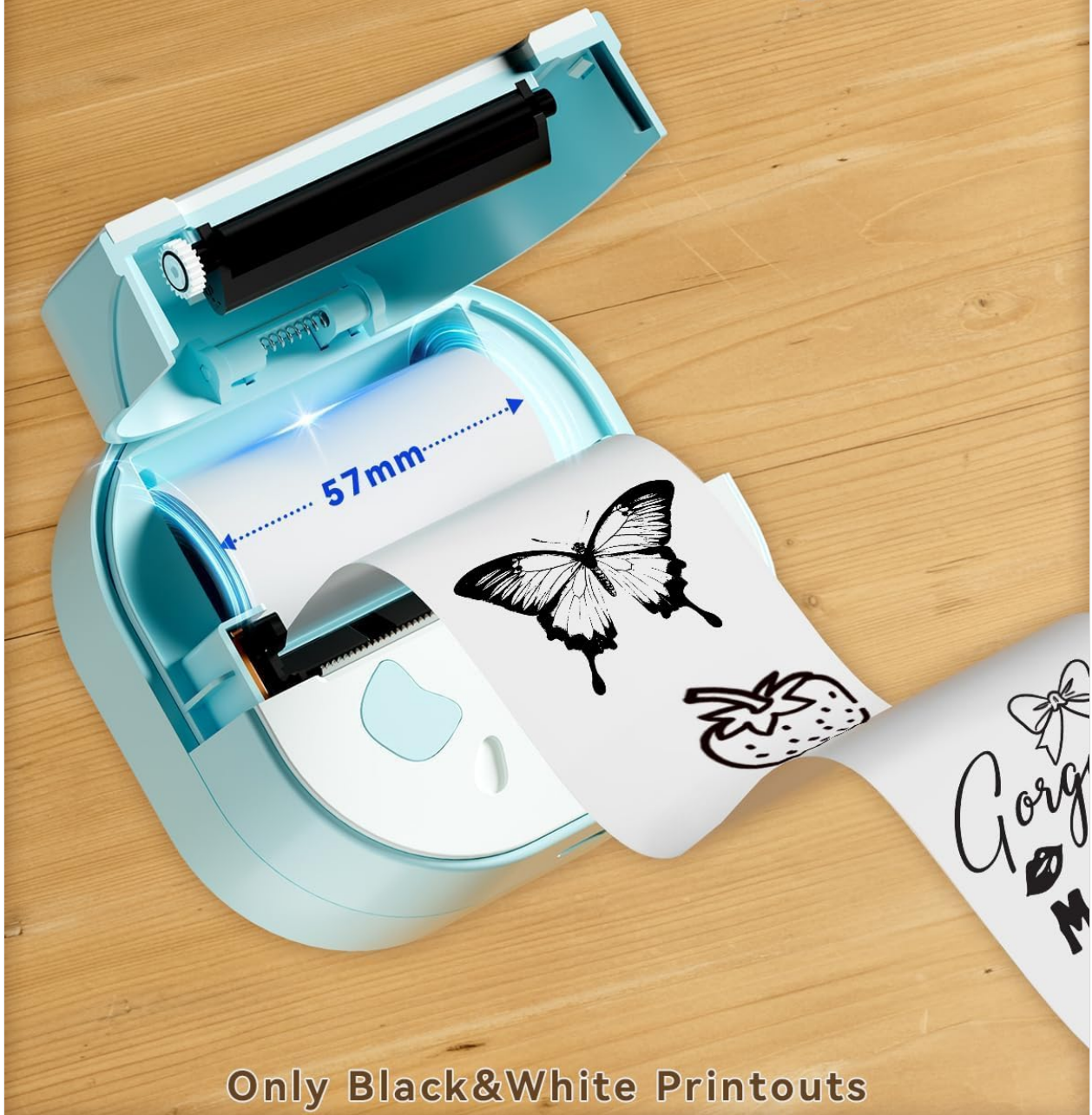
Image: The D21 printer with its top cover open, illustrating the correct way to insert a 57mm thermal paper roll into the designated slot.