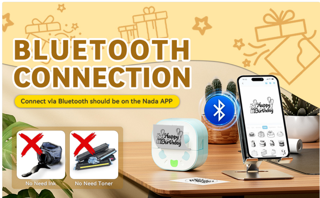
Image: A visual representation highlighting the NADA Print App and the printer's Bluetooth connectivity, along with icons indicating no ink or toner is required.