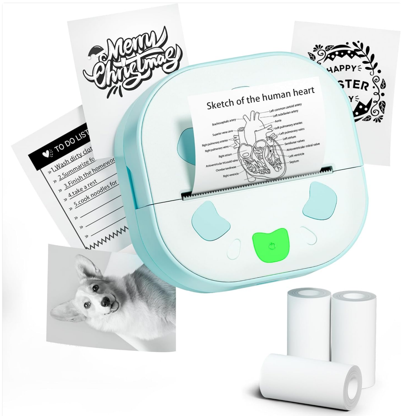
Image: The NDYIN PrintPods Mini Printer D21, showcasing its compact design alongside examples of printed notes, to-do lists, and stickers, and three rolls of thermal paper.