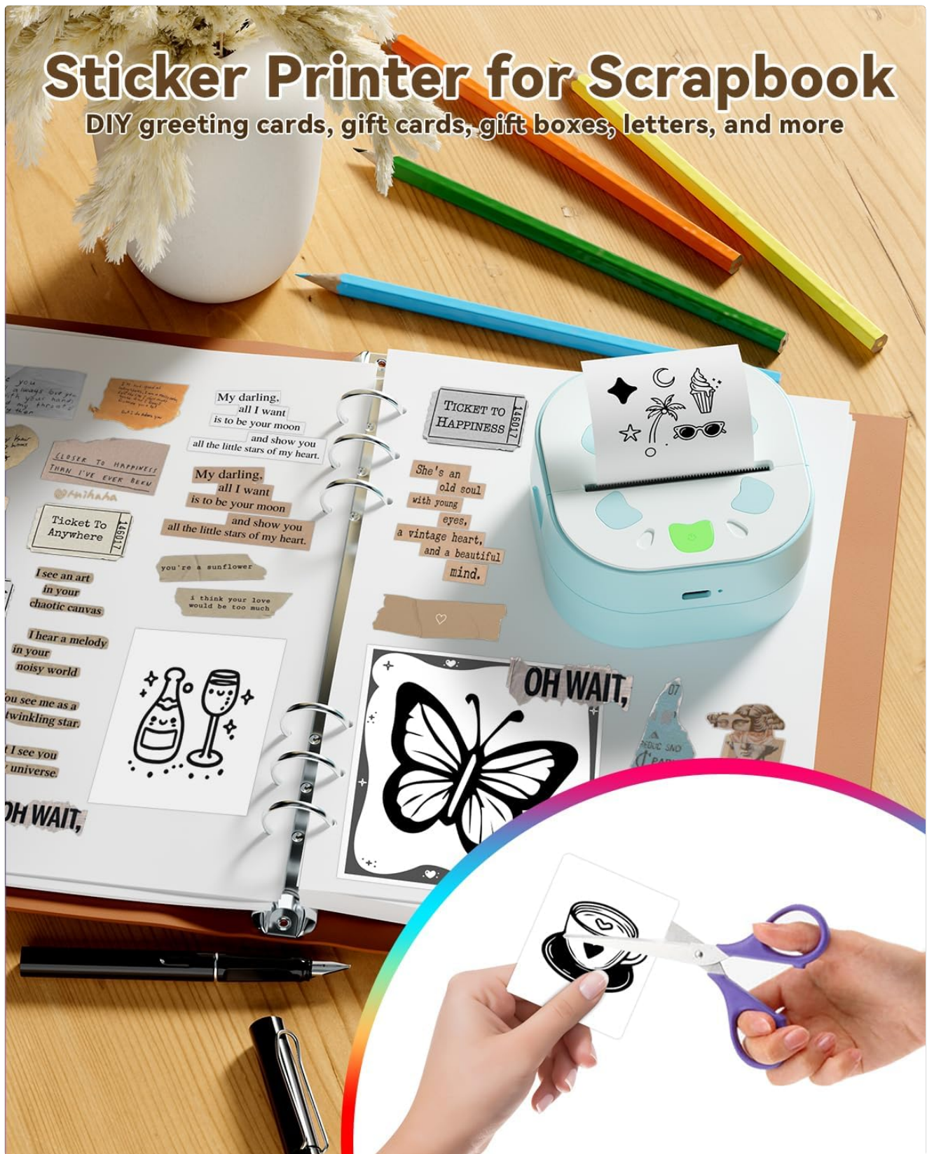
Image: The D21 printer in use, positioned next to an open scrapbook, illustrating how it can be used to print various stickers and notes for creative and organizational purposes.

DIY greeting cards, gift cards, gift boxes, letters, and more