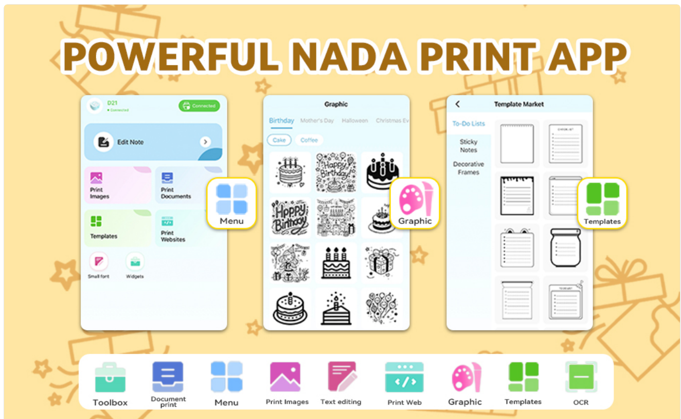
Image: An overview of the NADA Print App's user interface, displaying its main menu, graphic design options, and a marketplace for various printing templates.