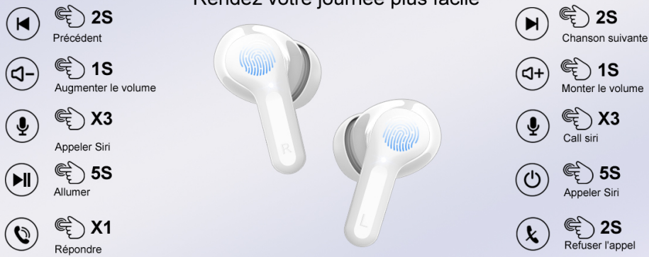
Image: Detailed touch control functions.