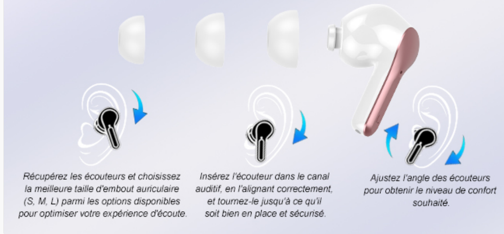
Image: Guide for secure and comfortable earbud fit.