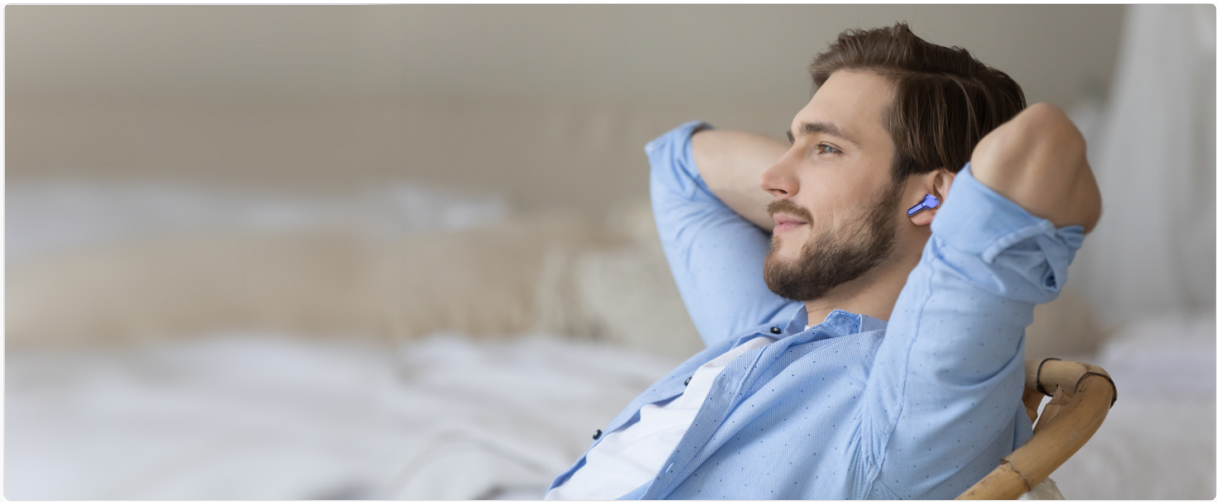
Image: Battery life and charging time overview.