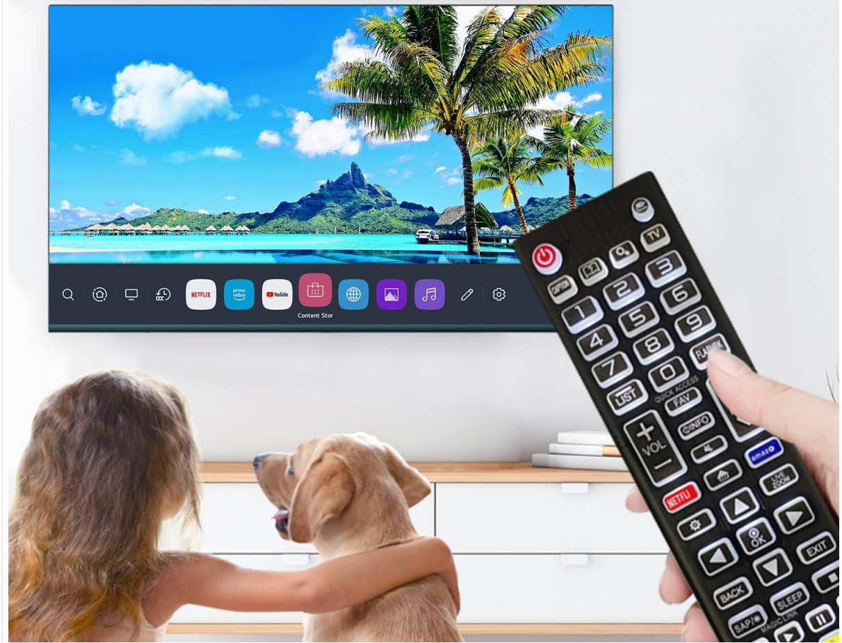
Image: The remote control positioned next to a TV screen, illustrating its direct usability without requiring setup.