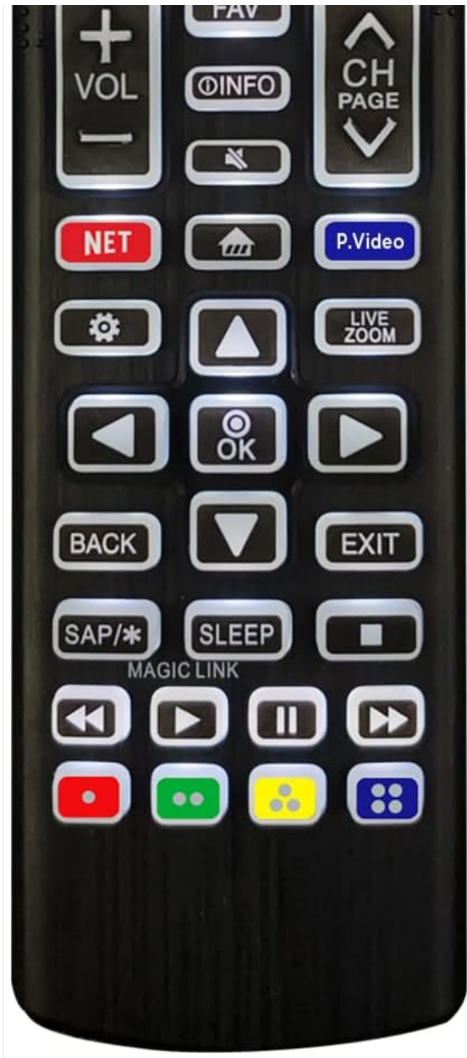
Image: The Piudekei AKB75095307 Backlit Replacement Remote Control, showcasing its button layout.