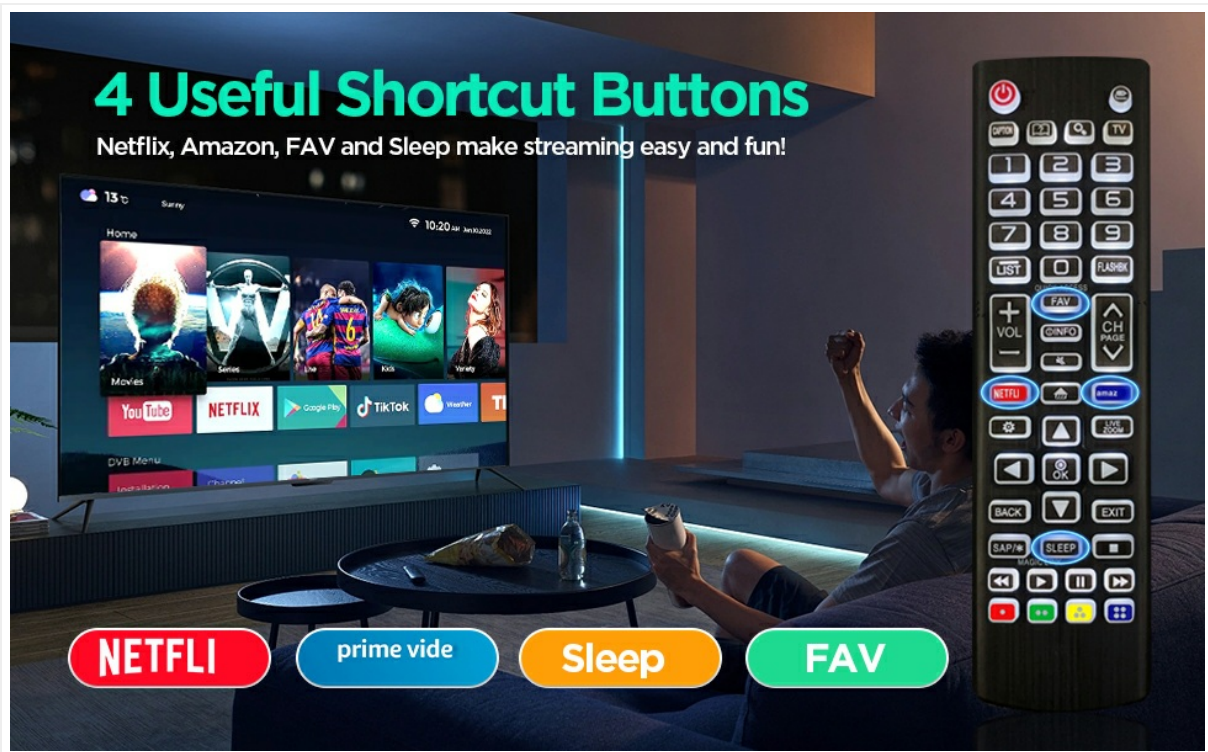
Image: The remote control with its four useful shortcut buttons (Netflix, Amazon, FAV, Sleep) highlighted, making streaming and TV control easier.