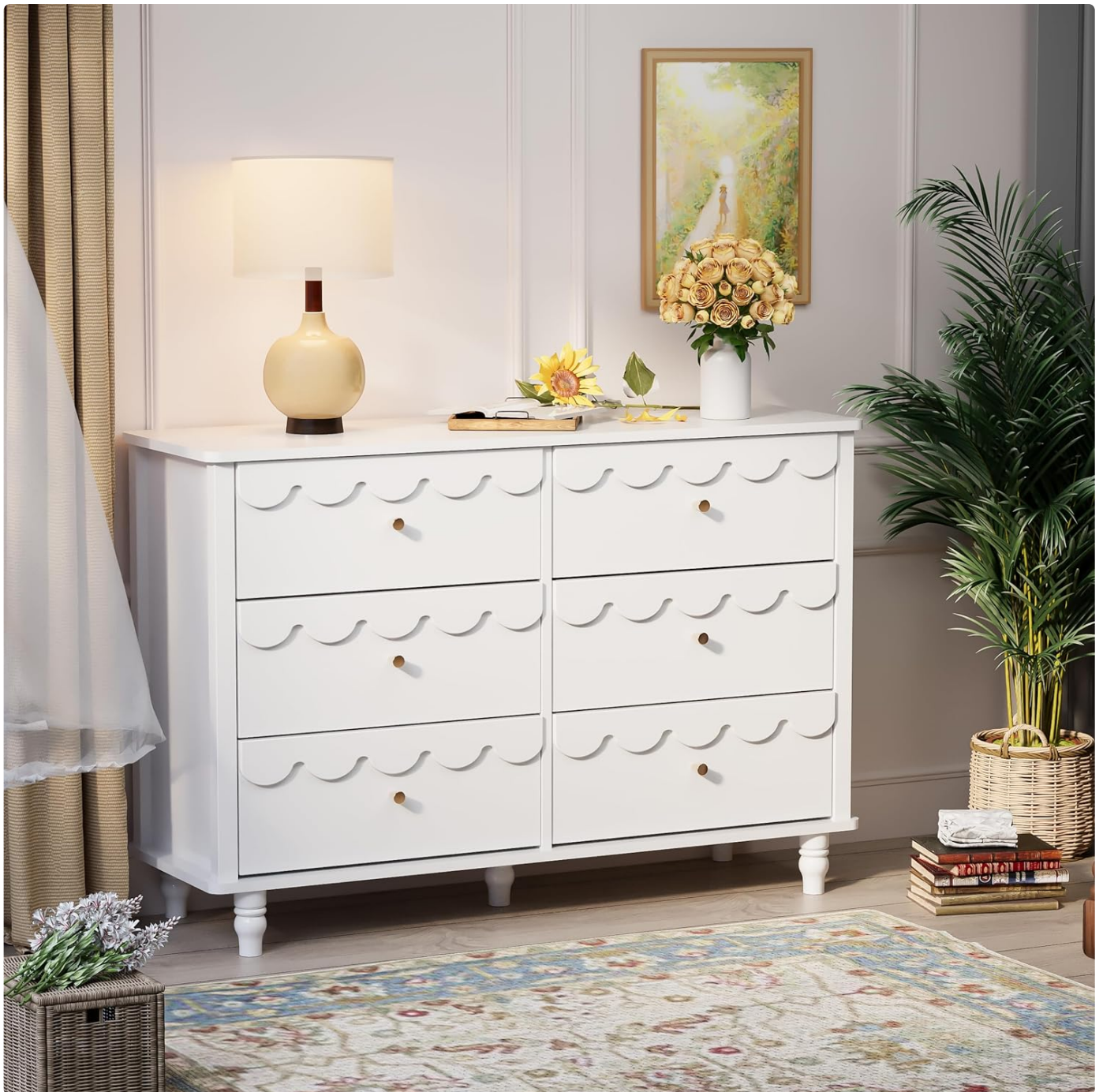
Figure 1: The Anbuy White Scalloped Nursery Dresser, showcasing its design and six drawers, positioned in a room with a lamp and plant.