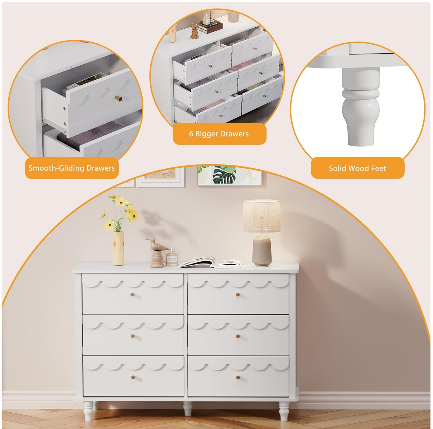
Figure 2: Detail of the dresser's features, highlighting the smooth operation of the drawers and the sturdy solid wood feet.