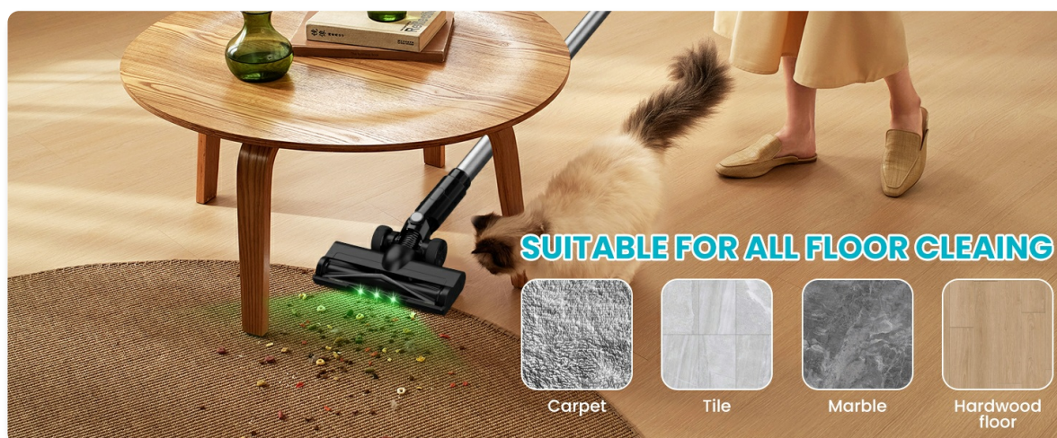
Image: The motorized floor brush with green LED headlights illuminating dirt on a hard floor surface, demonstrating its effectiveness in low-light areas.

The motorized floor brush is equipped with LED headlights and a flexible swivel design.