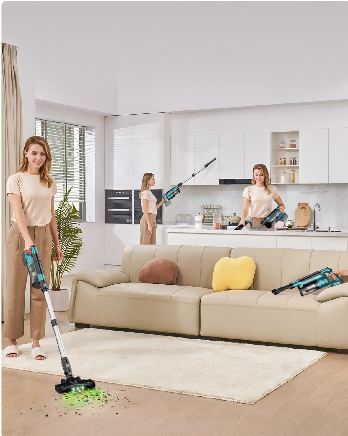
Image: Various configurations of the vacuum cleaner, demonstrating its 7-in-1 convertible design for different cleaning tasks around the home and car.

The 7-in-1 convertible design allows for various configurations: