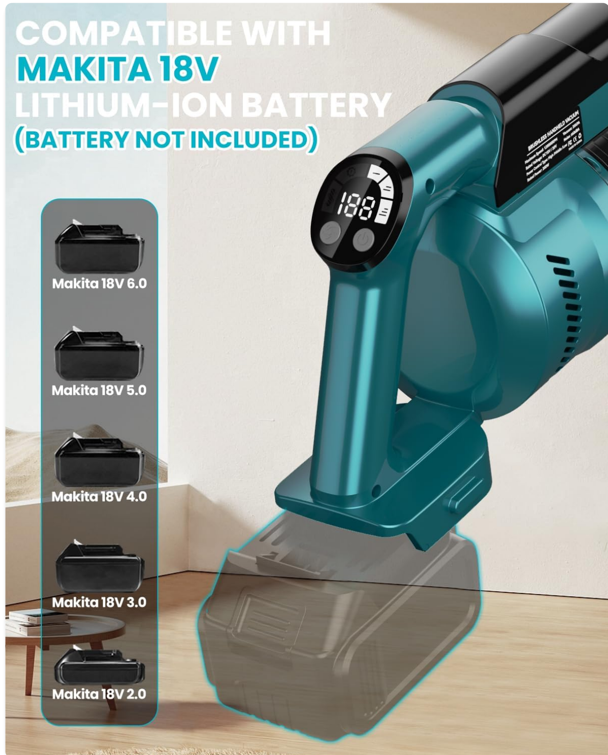
Image: The main vacuum unit showing compatibility with various Makita 18V battery models. The battery slides into the designated slot at the base of the handle.

This vacuum cleaner is designed for use with Makita 18V batteries (e.g., BL1860, BL1850, BL1840, BL1830, BL1815). Battery is NOT included.