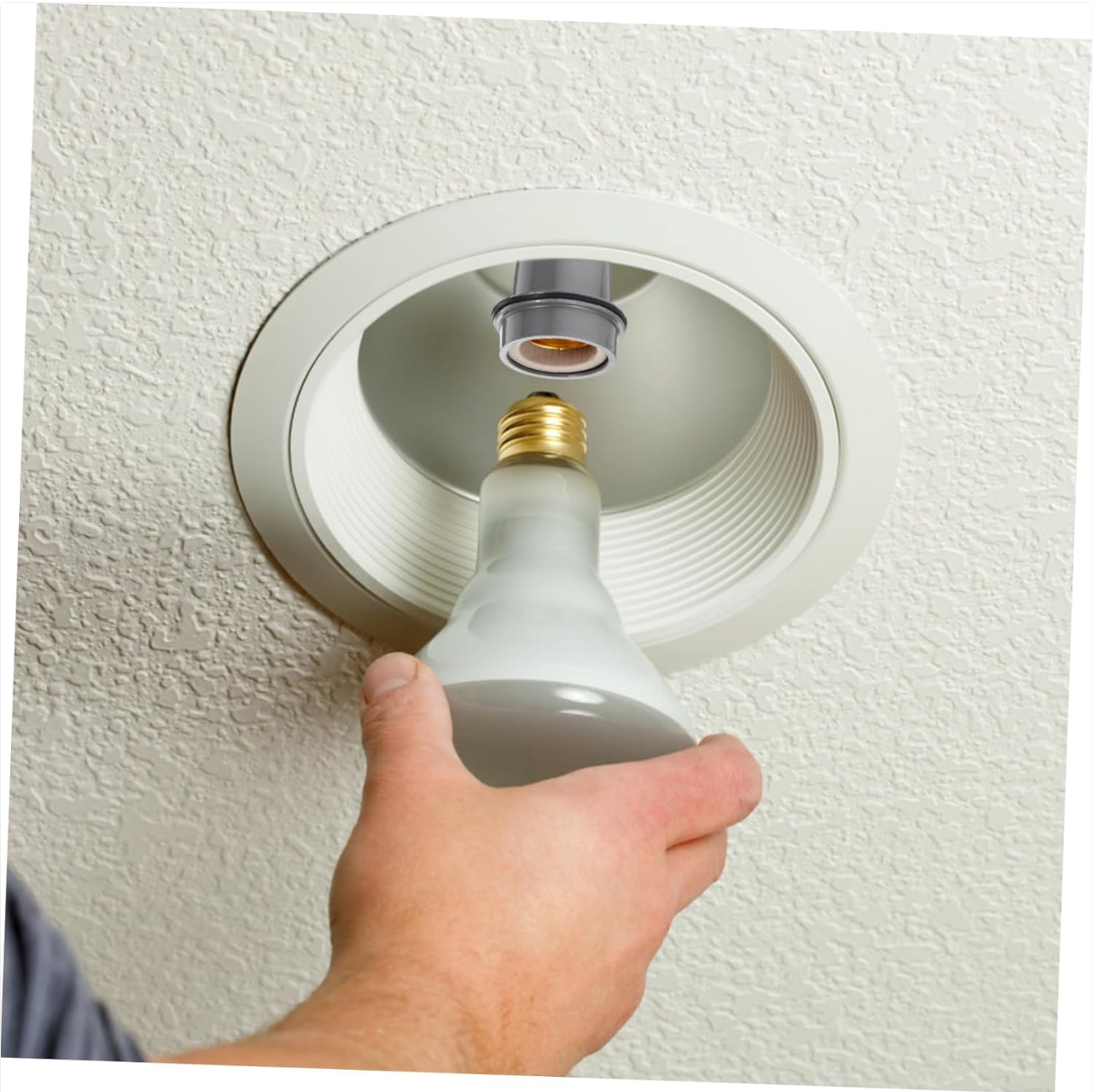
Image 3.1: Illustration of a hand installing an E27 bulb into a recessed light fixture, demonstrating the compatibility and ease of use of the socket.