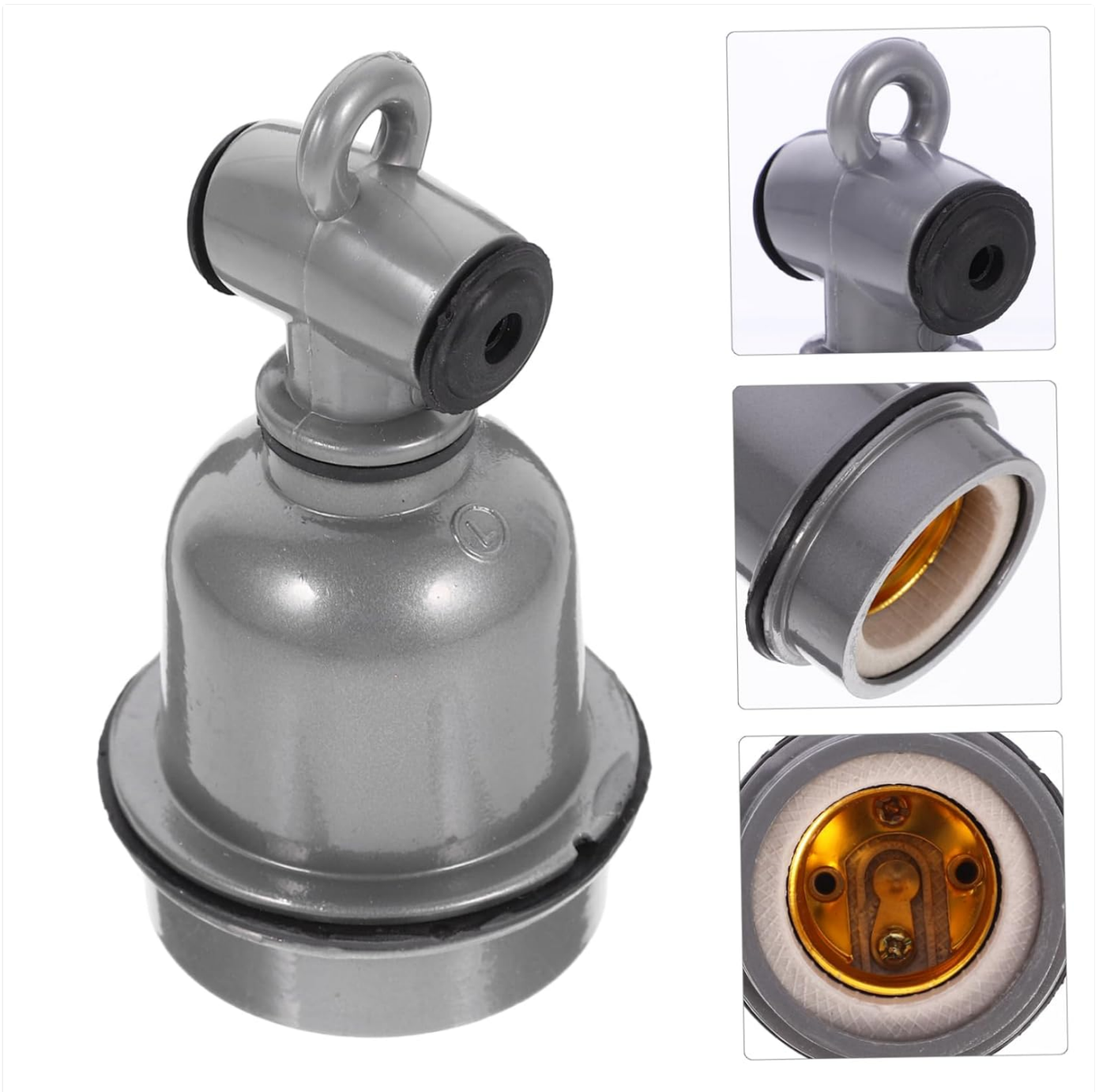
Image 7.2: Detailed views of the E27 light socket, highlighting the internal ceramic component and the external waterproof seal.