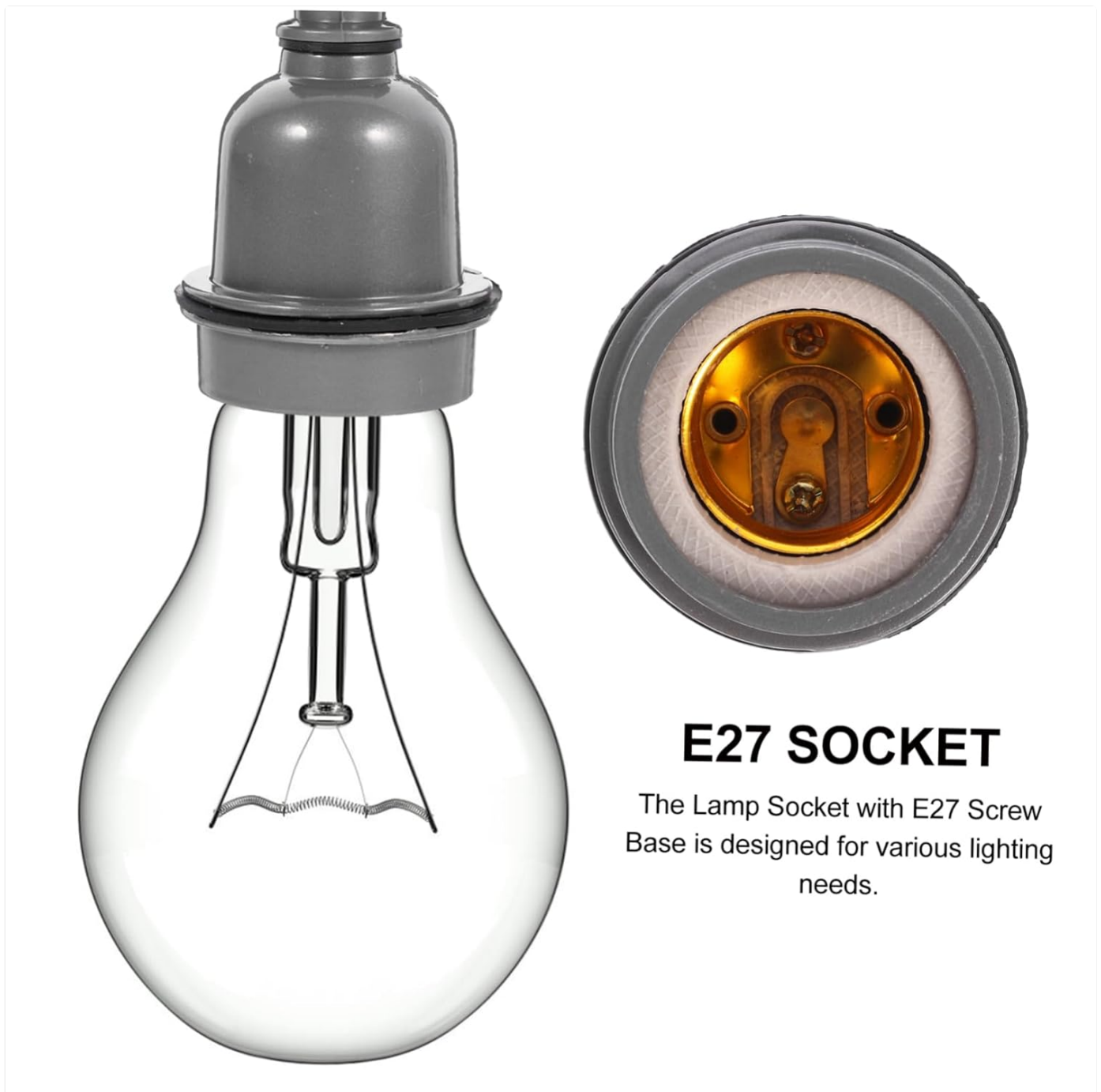
Image 4.1: A clear E27 light bulb screwed into the POPETPOP socket, demonstrating the proper fit and connection for operation.