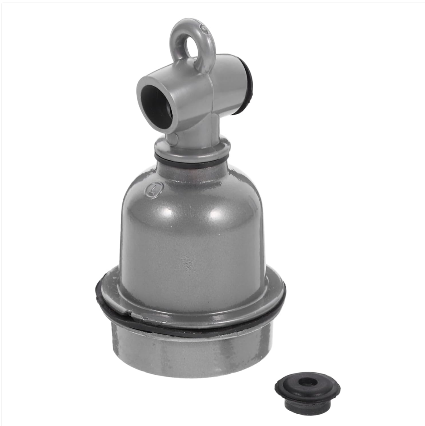
Image 1.1: Front view of the POPETPOP E27 Light Socket Base Bulb Holder, showcasing its grey finish and robust design.