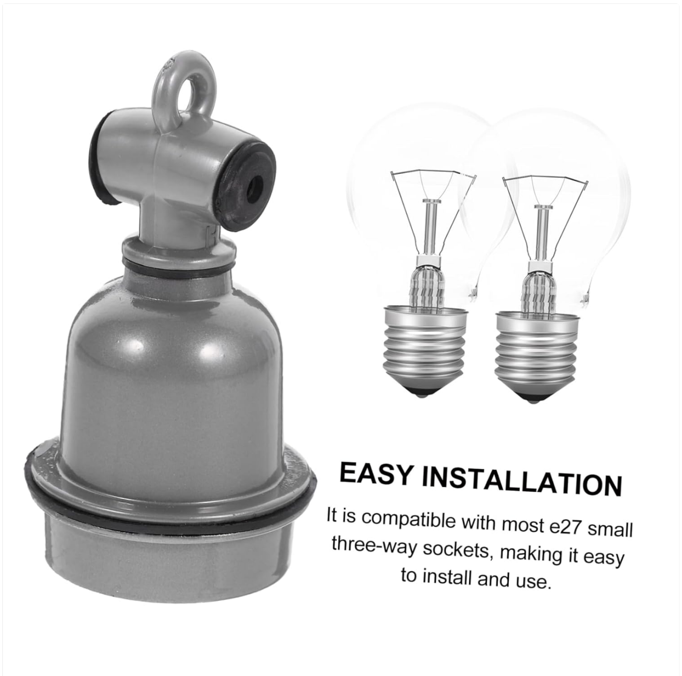
Image 3.2: The E27 light socket positioned next to two E27 base light bulbs, highlighting its compatibility and ease of installation.