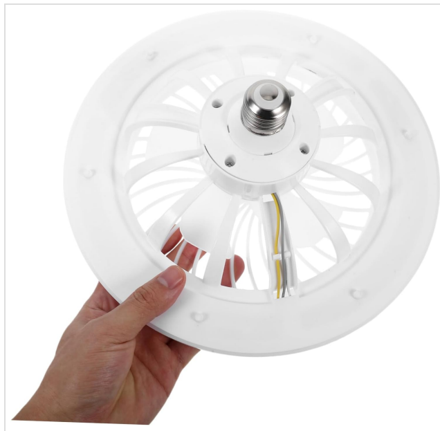
Image: A hand holding the fan light, illustrating its compact size and E27 screw-in base for easy handling.