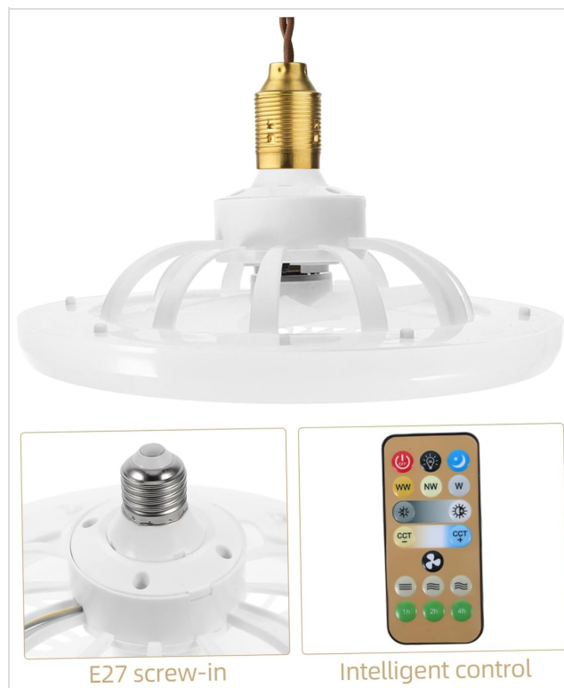
Image: Close-up view of the E27 screw-in base for installation, alongside the remote control.