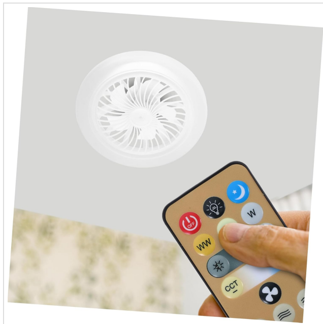
Image: The mini ceiling fan installed and hanging from a ceiling fixture, ready for use.