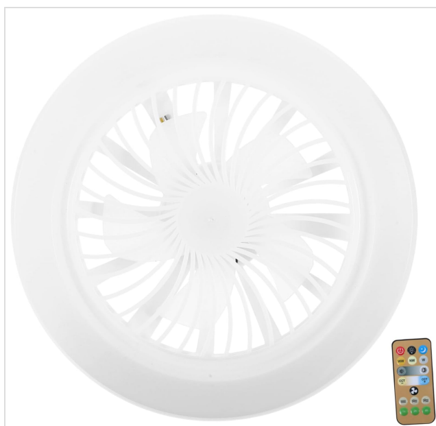
Image: The jojofuny Mini Ceiling Fan with LED Light and its accompanying remote control.