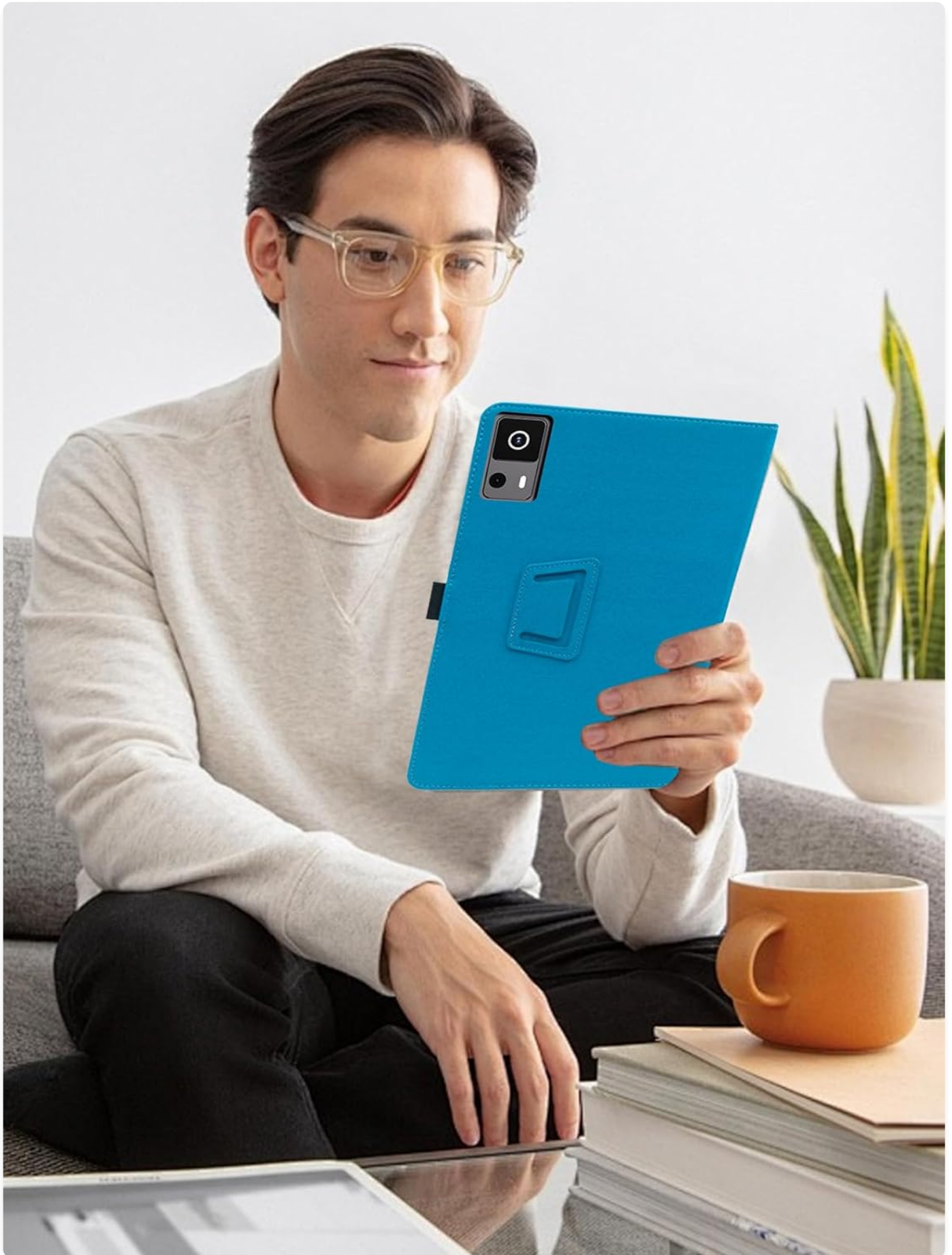
Figure 2: Proper handling of the tablet with the installed protective case.