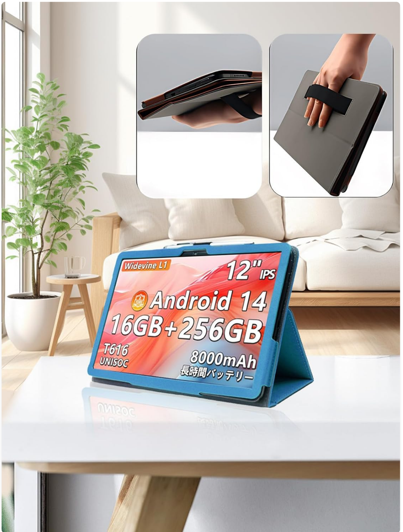
Figure 3: The case configured for an optimal viewing angle.