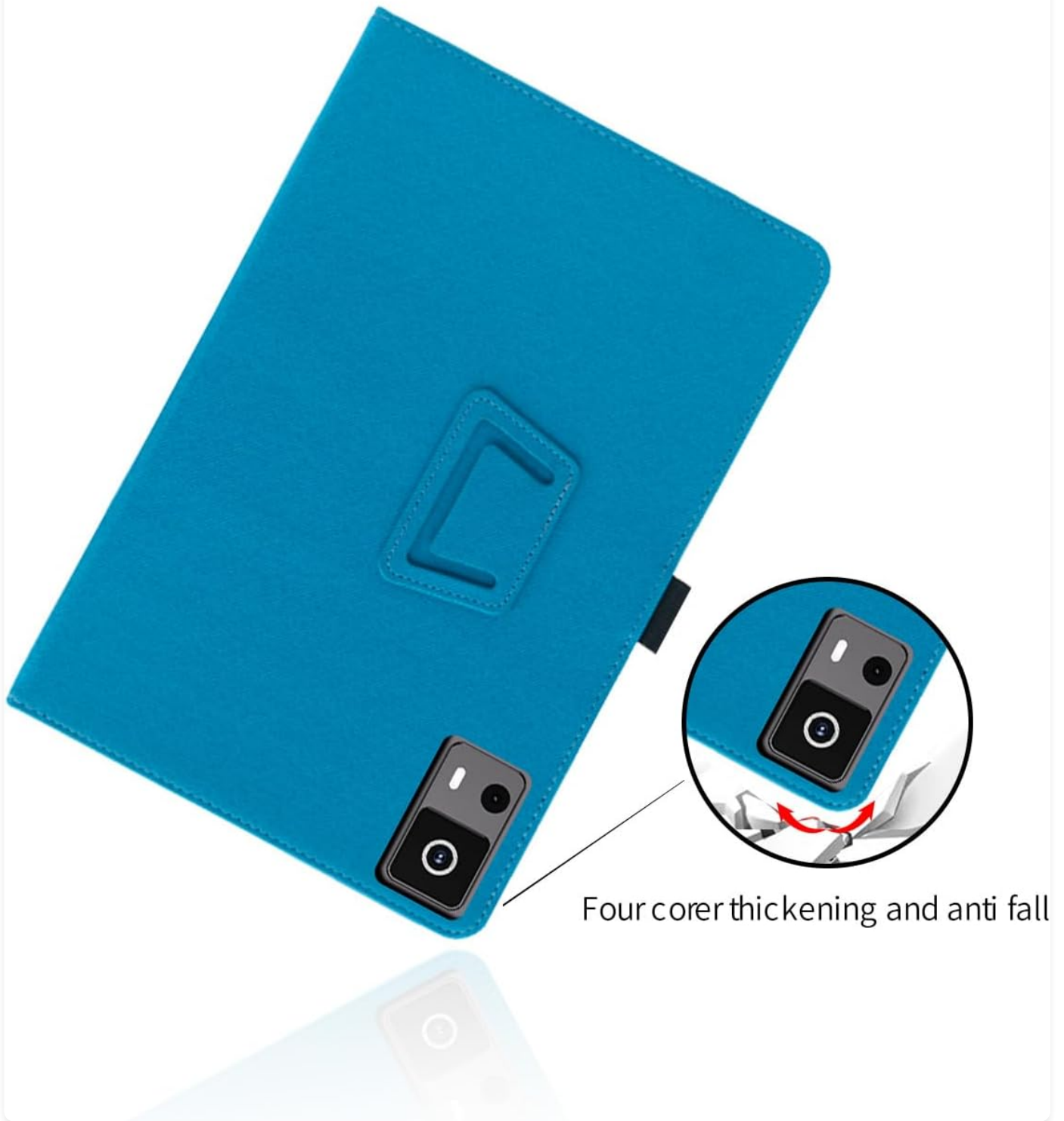
Figure 7: Highlight of the case's drop resistance and anti-scratch features, particularly the reinforced corners.