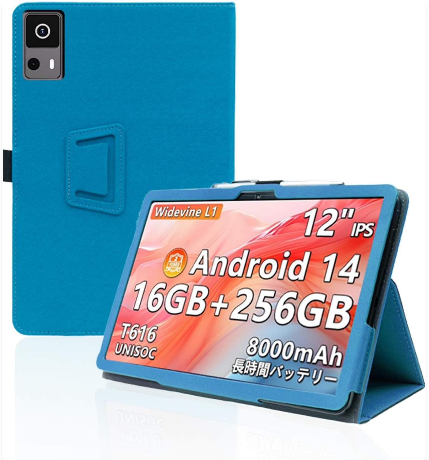
Figure 1: The BOVUGAC Sky Blue protective case for Callsky T12s tablet, showcasing its integrated stand.