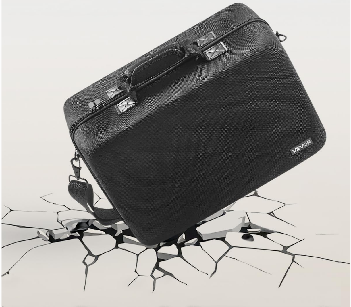
Image: The VEVOR PS5 Carrying Case, highlighting its durable and shockproof EVA material construction, designed to resist drops, bumps, and scratches.

Hard shell effectively resists drops, bumps and scratches