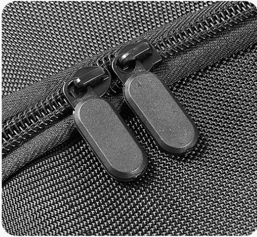
Smooth Double Zipper