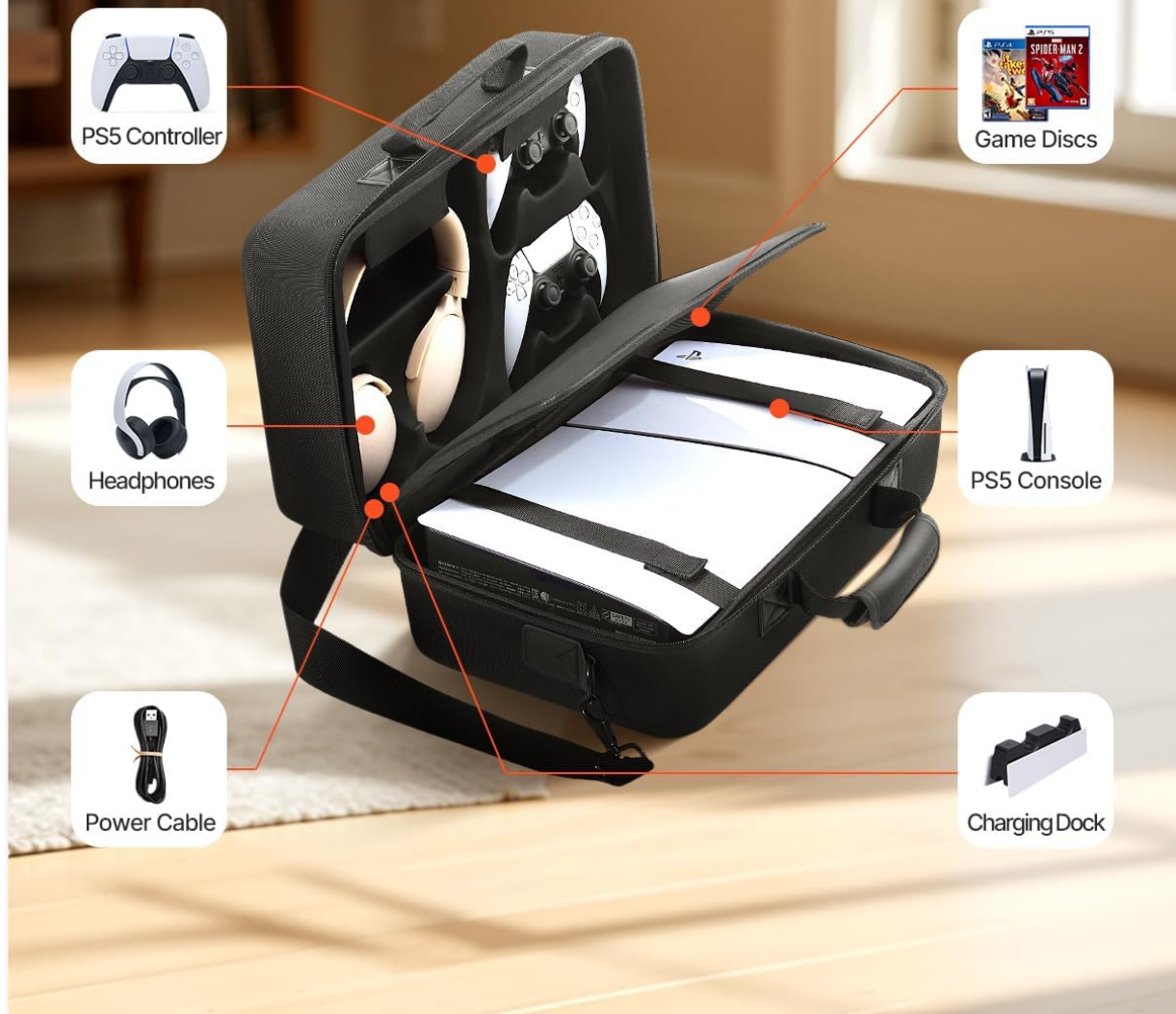
Image: The interior of the VEVOR PS5 Carrying Case with padded dividers, illustrating how to organize the PS5 Slim console, controllers, headphones, game discs, power cable, and charging dock.