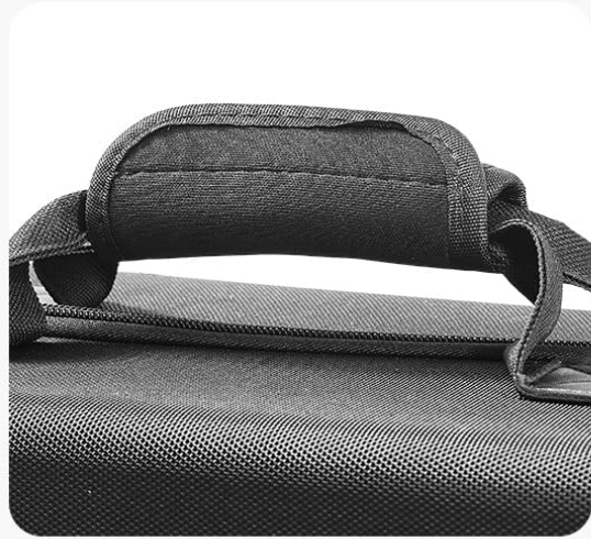
Comfortable Carry Handle