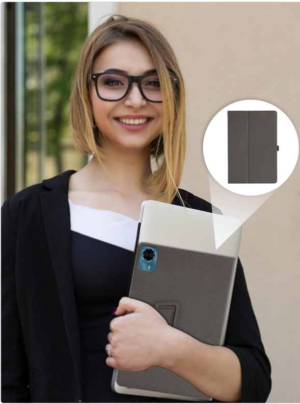
Figure 2.1: Product Details. This image illustrates the case's skin-friendly and high-quality material, circular arc design for comfort, anti-fingerprint surface, soft interior lining, precise cutouts, integrated hand strap, and multi-angle bracket design.