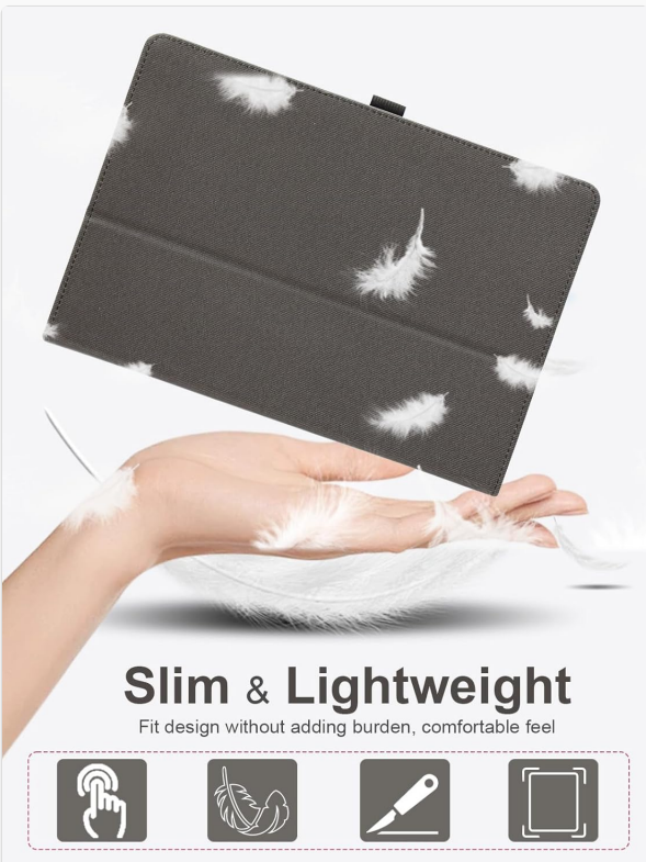
Figure 2.6: Slim and Lightweight Design. The case is engineered for a comfortable feel and a slim profile, adding minimal burden to your tablet.