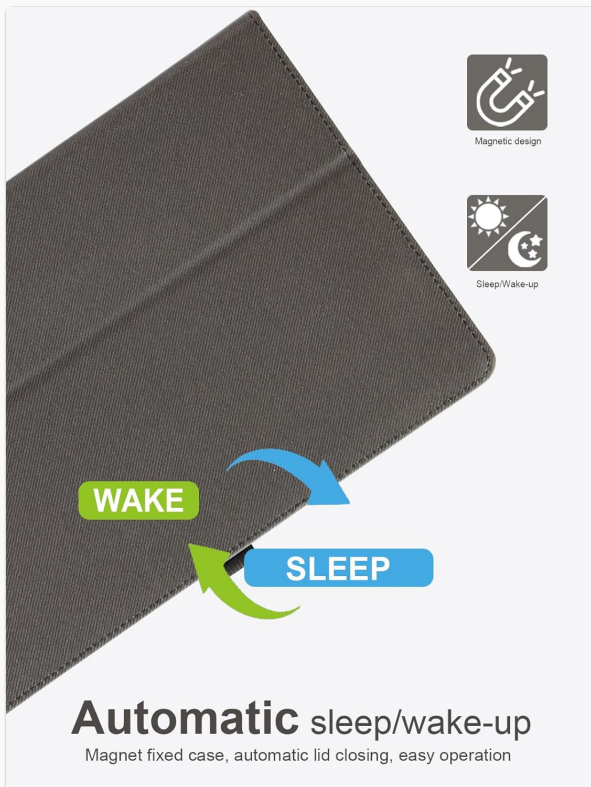
Figure 2.2: Automatic Sleep/Wake Function. The magnetic design enables the tablet to automatically wake up when the cover is opened and sleep when closed, conserving battery life.