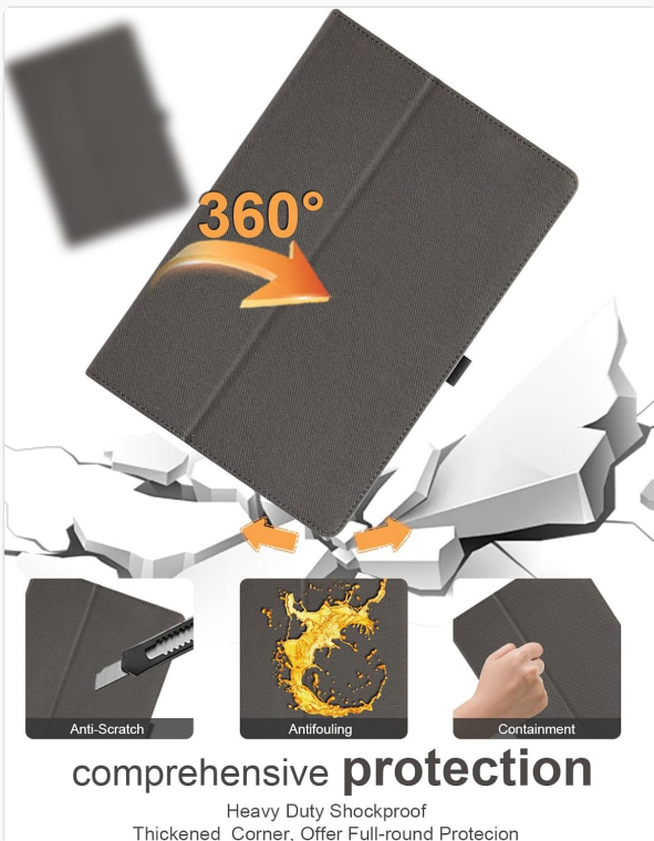
Figure 2.4: Comprehensive Protection. This image highlights the case's robust protection against scratches, fouling, and impacts, featuring thickened corners for all-round defense.