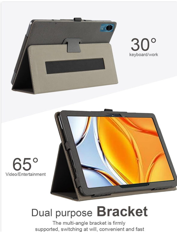
Figure 2.3: Dual-Purpose Multi-Angle Stand. The integrated stand provides two primary angles: approximately 30 degrees for typing or work, and 65 degrees for video viewing or entertainment.