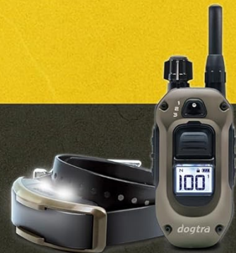
Image 5.1: The Dogtra 1900X Fit Guide illustrates the appropriate dog sizes for the collar, indicating that it is suitable for dogs 45 lbs and up for a perfect fit.

* Dogs 7lb+: consider Dogtra IQ-Mini Dogs 10lb+: consider Dogtra 280X Dogs 15lb+: consider Dogtra ARC-X