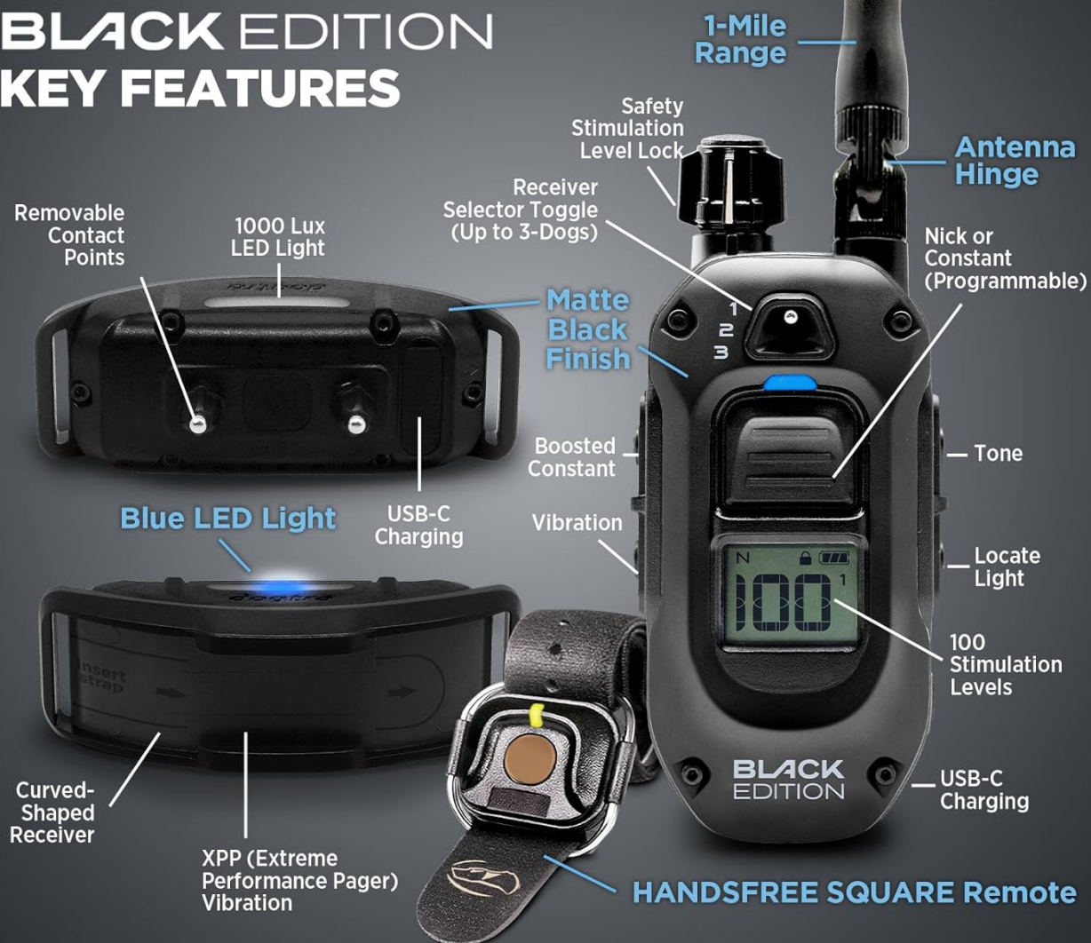
Image 4.1: Detailed diagram highlighting the features of the 1900X remote transmitter and receiver collar.