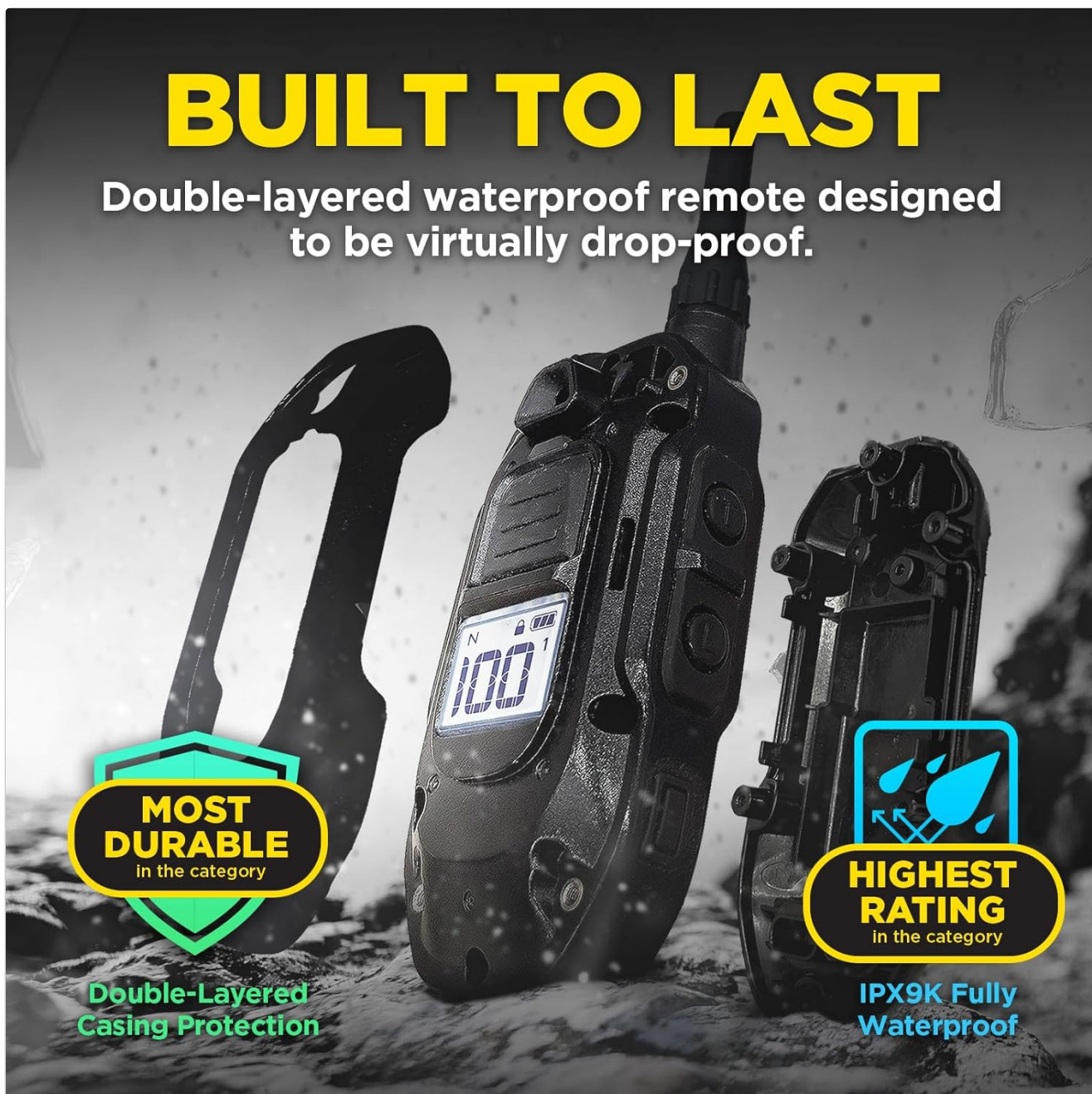
Image 7.1: The Dogtra 1900X is built with double-layered casing and IPX9K waterproofing for maximum durability in various environments.