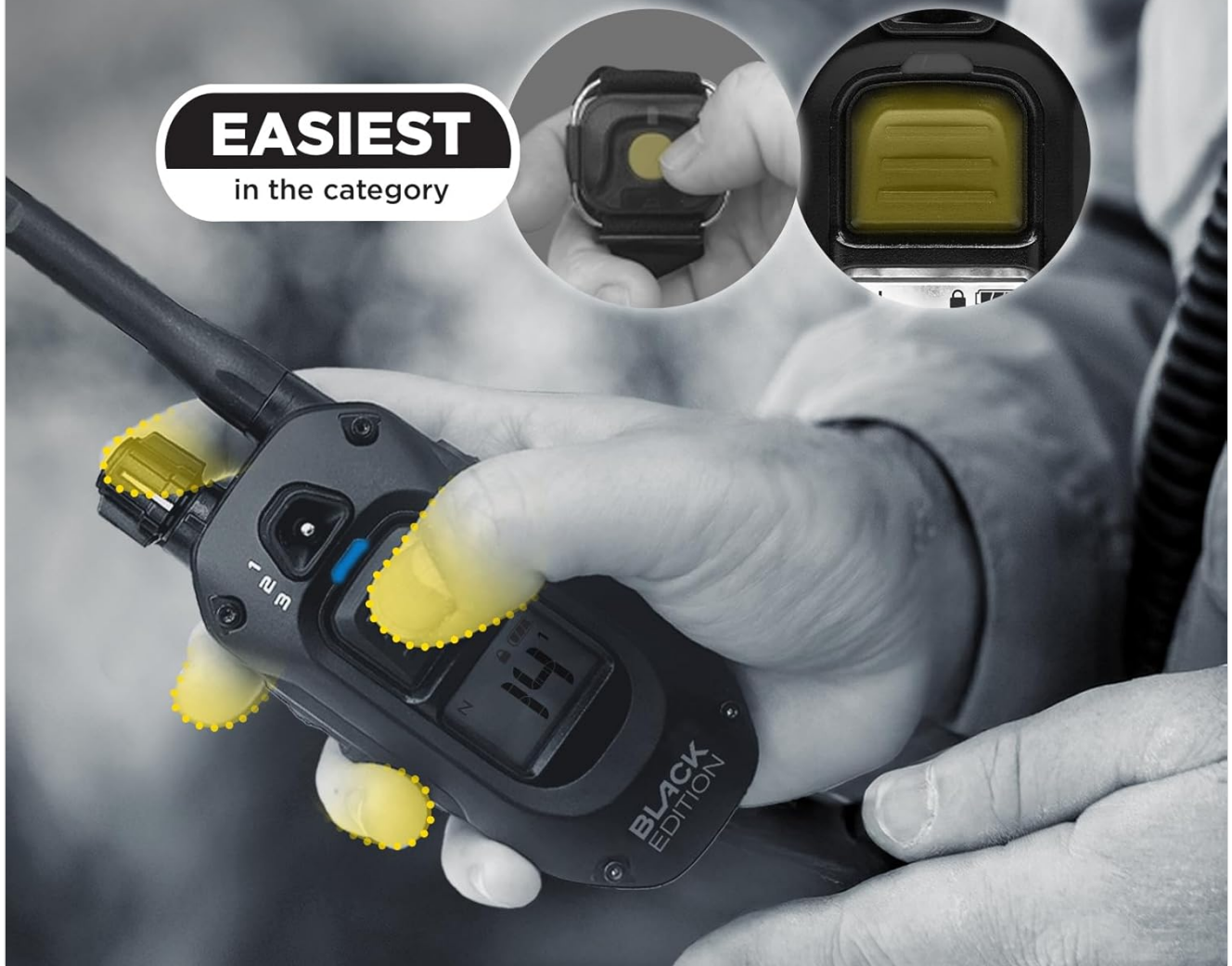
Image 6.1: The remote transmitter is designed for easy one-hand operation, allowing trainers to maintain focus on their dog.