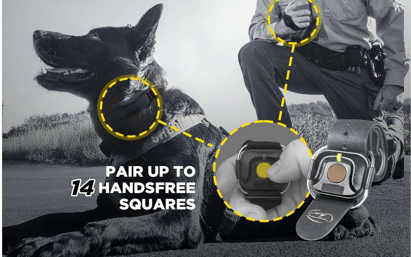
Image 6.2: The Handsfree Square Remote provides convenient, discreet control, allowing trainers to focus on their dog's behavior.