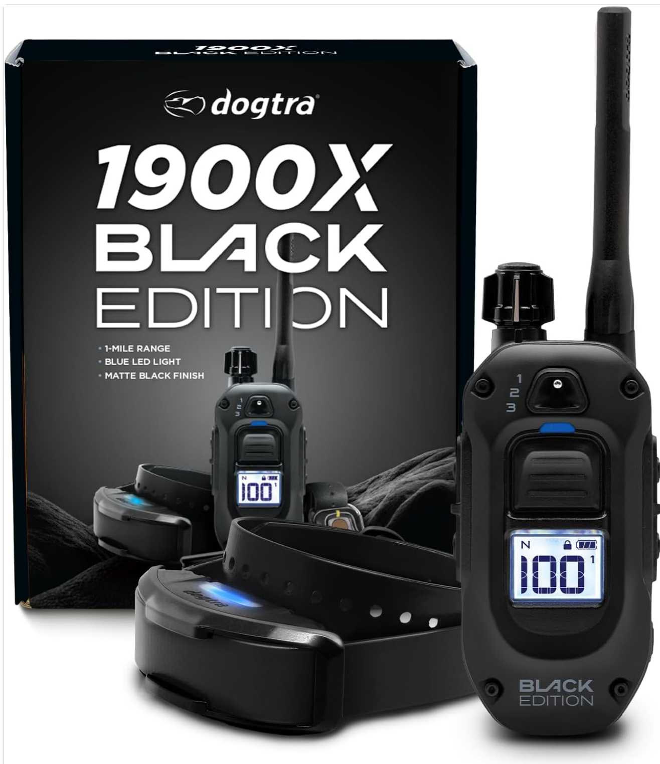
Image 1.1: The Dogtra 1900X Black Edition E-Collar system, including the remote transmitter, receiver collar, and product packaging.