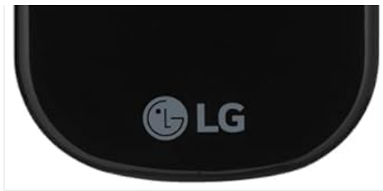
Image: The LG webOS Re:New Program logo, illustrating the commitment to providing software updates and feature refreshes for up to 5 years, ensuring long-term performance.