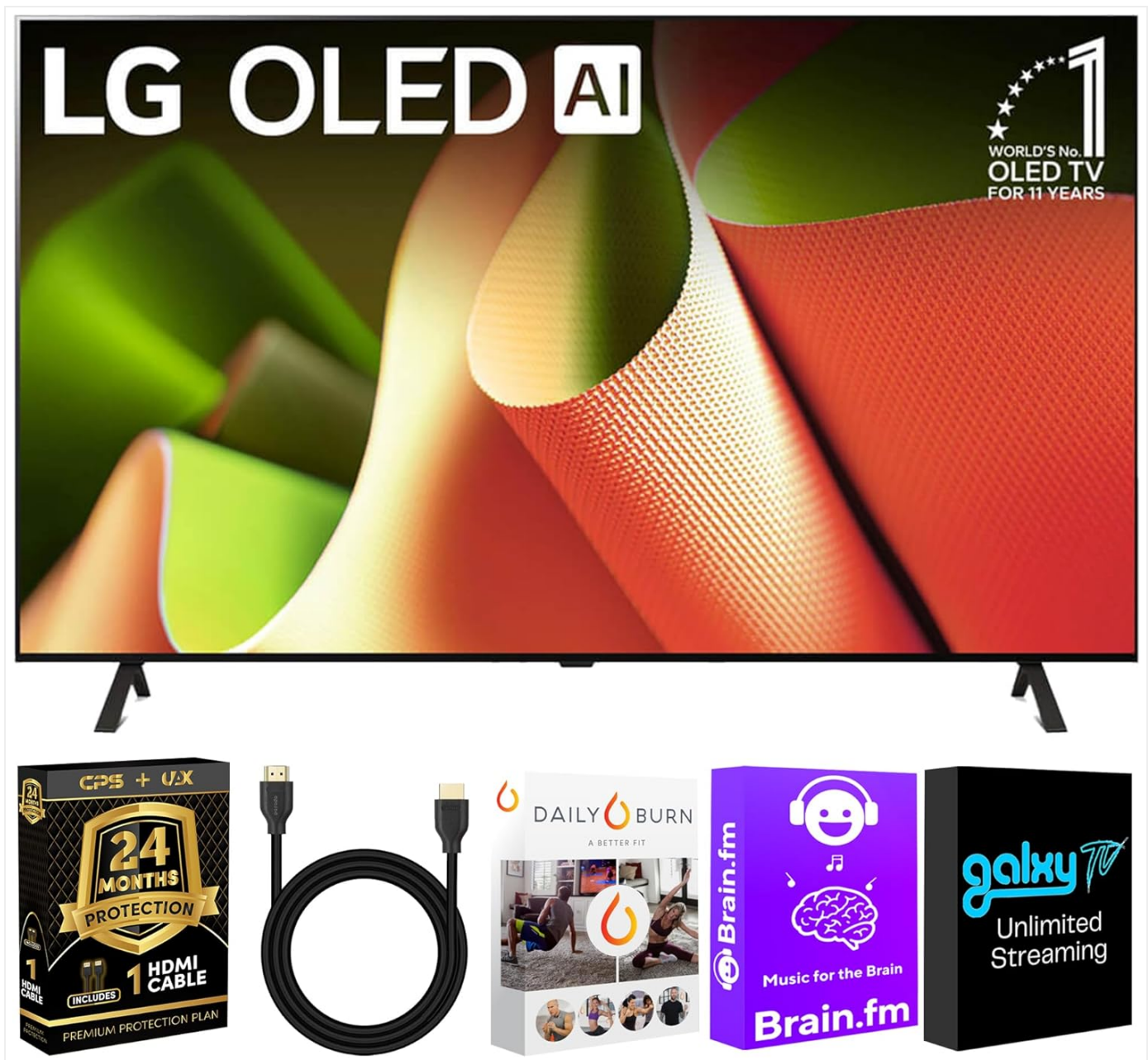
Image: The LG OLED B4 Series 4K Smart OLED TV, showcasing its sleek design and the various bundled accessories, including the HDMI cable and protection plan packaging.