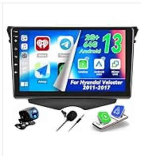
Image Description: A split screen view on the car stereo display, showing the Apple CarPlay interface on one side with navigation and music apps, and the Android Auto interface on the other side with similar functionalities.

Video Description: A short demonstration showing how to establish a wireless CarPlay connection with the car stereo, including the pairing process.