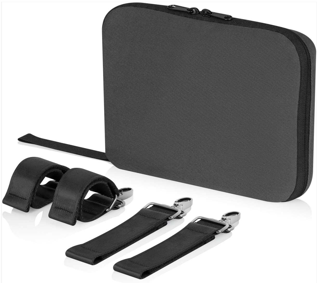
Image 1.1: The Lionelo Leo Stroller Hammock in its compact, folded state, accompanied by its attachment straps and hooks.