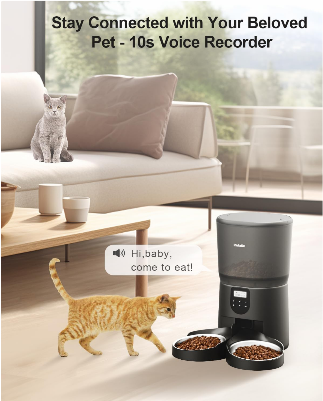
Image: The feeder's control panel highlighting the microphone button for recording personalized meal calls.

5. The recorded message will play automatically at each scheduled meal time.