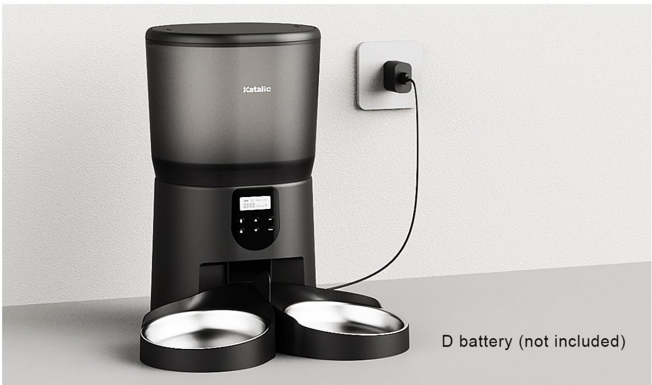
Image: Illustration of the feeder connected to AC power and highlighting the battery compartment for backup power.

The battery is used for emergency when the power is cut off.