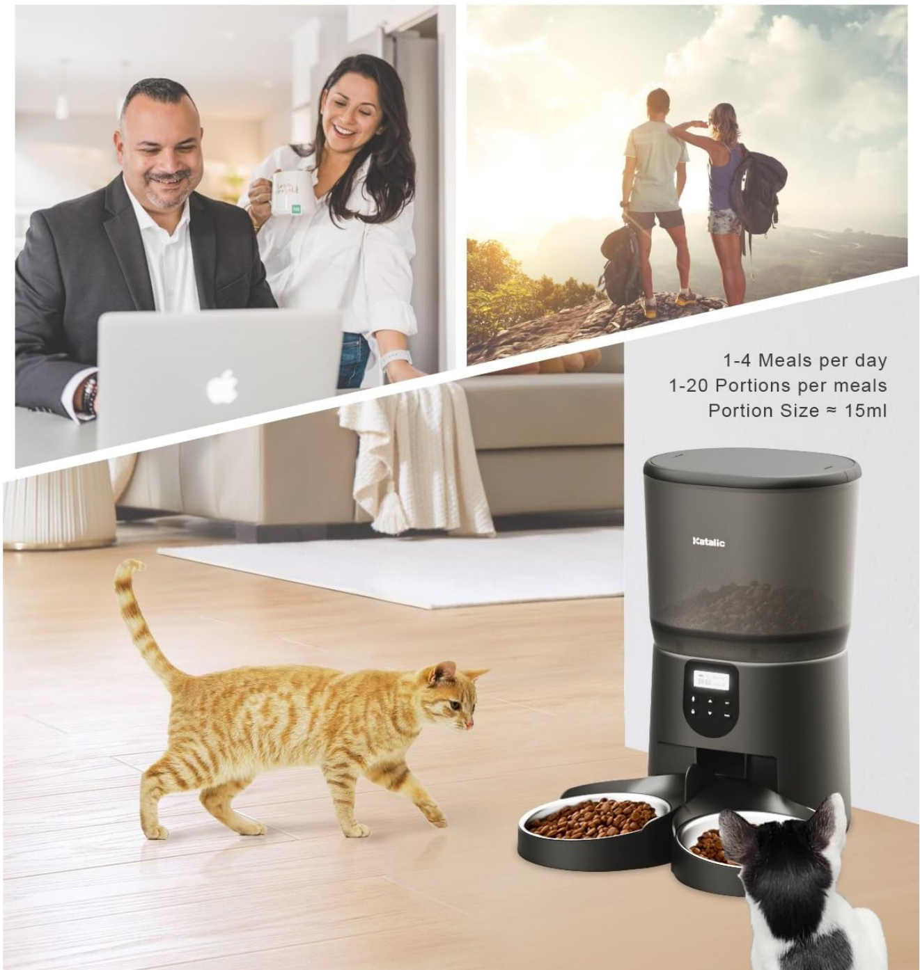
Image: The feeder's display showing programmed meal times and portion sizes, illustrating a typical feeding schedule.

Your browser does not support the video tag.