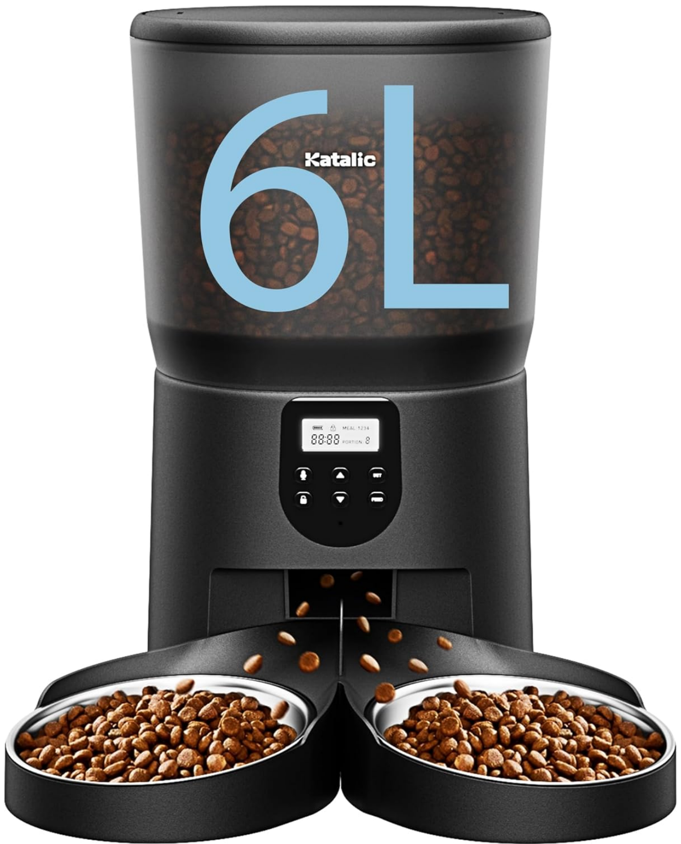
Image: The Katalic Automatic Cat Feeder, showcasing its 6-liter food reservoir and two stainless steel feeding bowls.