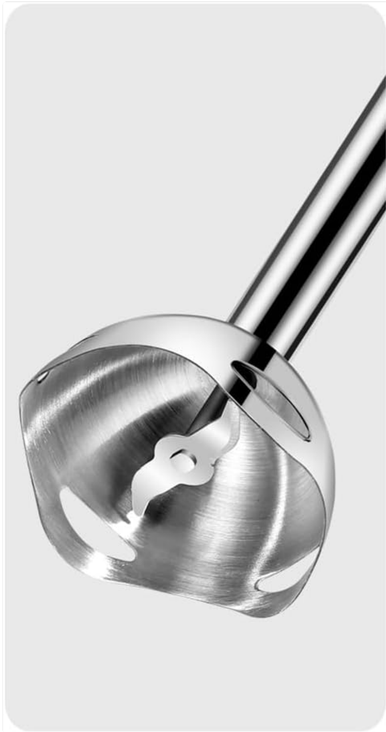
Image: A close-up view of the stainless steel blending blade and guard, illustrating the design for efficient blending and easy cleaning.