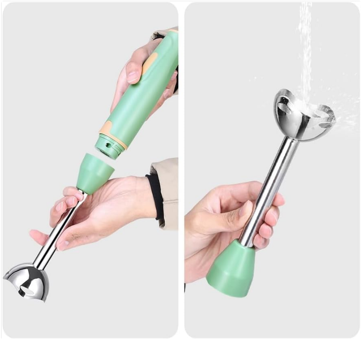
Image: Overview of the Wuden Immersion Hand Stick Blender, showing the motor unit, blending shaft, and blade guard.