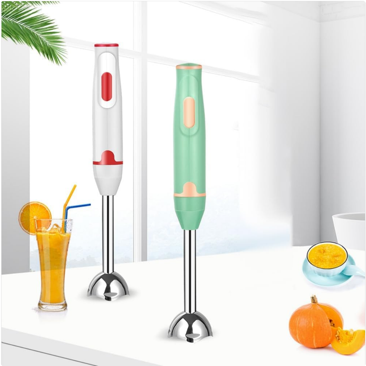
Image: The immersion blender in use, blending ingredients for orange juice and pureed pumpkin.