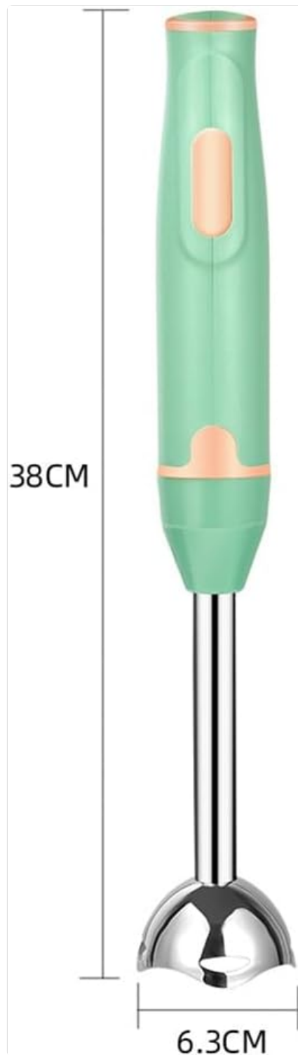
Image: Diagram illustrating the dimensions of the immersion blender, showing a total length of 38cm and a blending head width of 6.3cm.