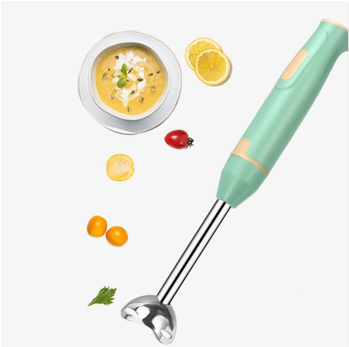
Image: The immersion blender positioned next to a bowl of soup and fresh ingredients, demonstrating its use for liquid-based recipes.