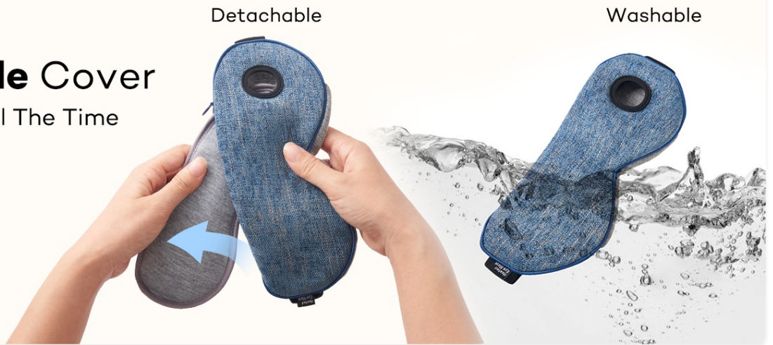
Image: A step-by-step visual guide on detaching and washing the outer cotton cover of the eye mask.