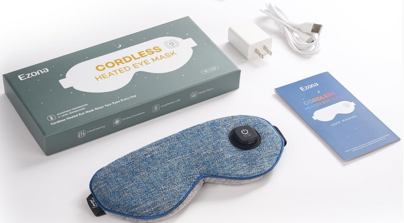
Image: The Ezona Cordless Heated Eye Mask, its packaging, charging accessories, earplugs, and storage bag.