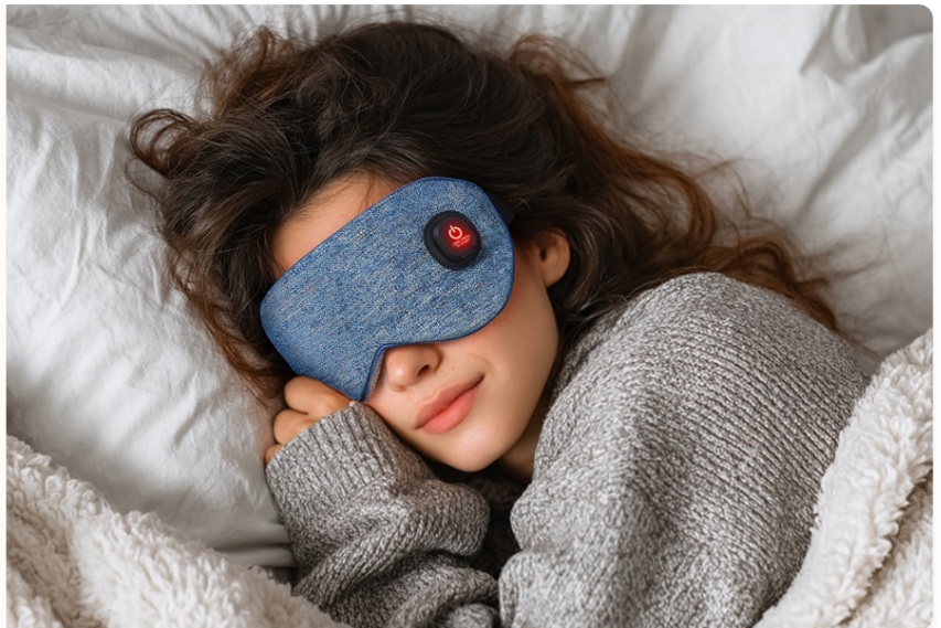
Image: A woman wearing the Ezona Cordless Heated Eye Mask, relaxing in bed, illustrating its use for pre-sleep relaxation.

Transform your nights, refresh your days