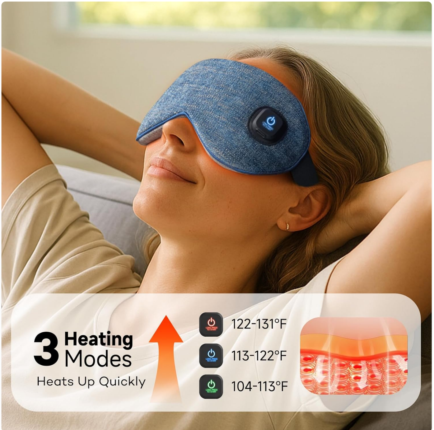
Image: A visual representation of the three adjustable heat settings (Low, Medium, High) with their respective indicator lights and temperature ranges.

Your browser does not support the video tag.