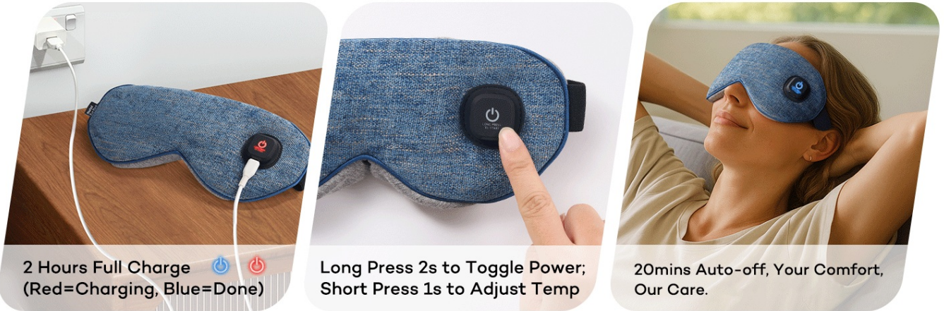
Image: A visual guide demonstrating how to charge the eye mask, operate the power button, and wear the mask.