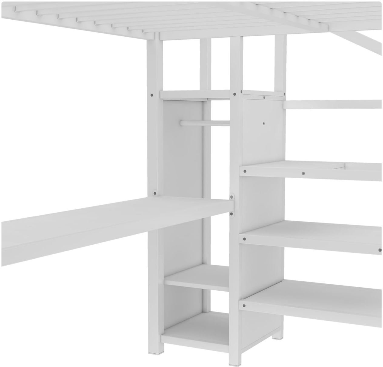
Figure 2: Detailed dimensions of the Bellemave Queen Loft Bed.