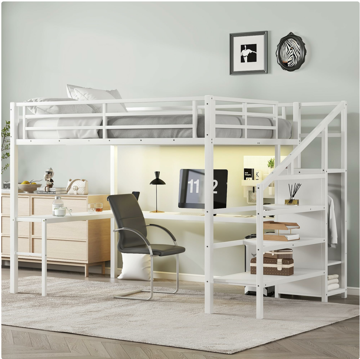
Figure 1: Overview of the Bellemave Queen Loft Bed with Desk and Stairs.