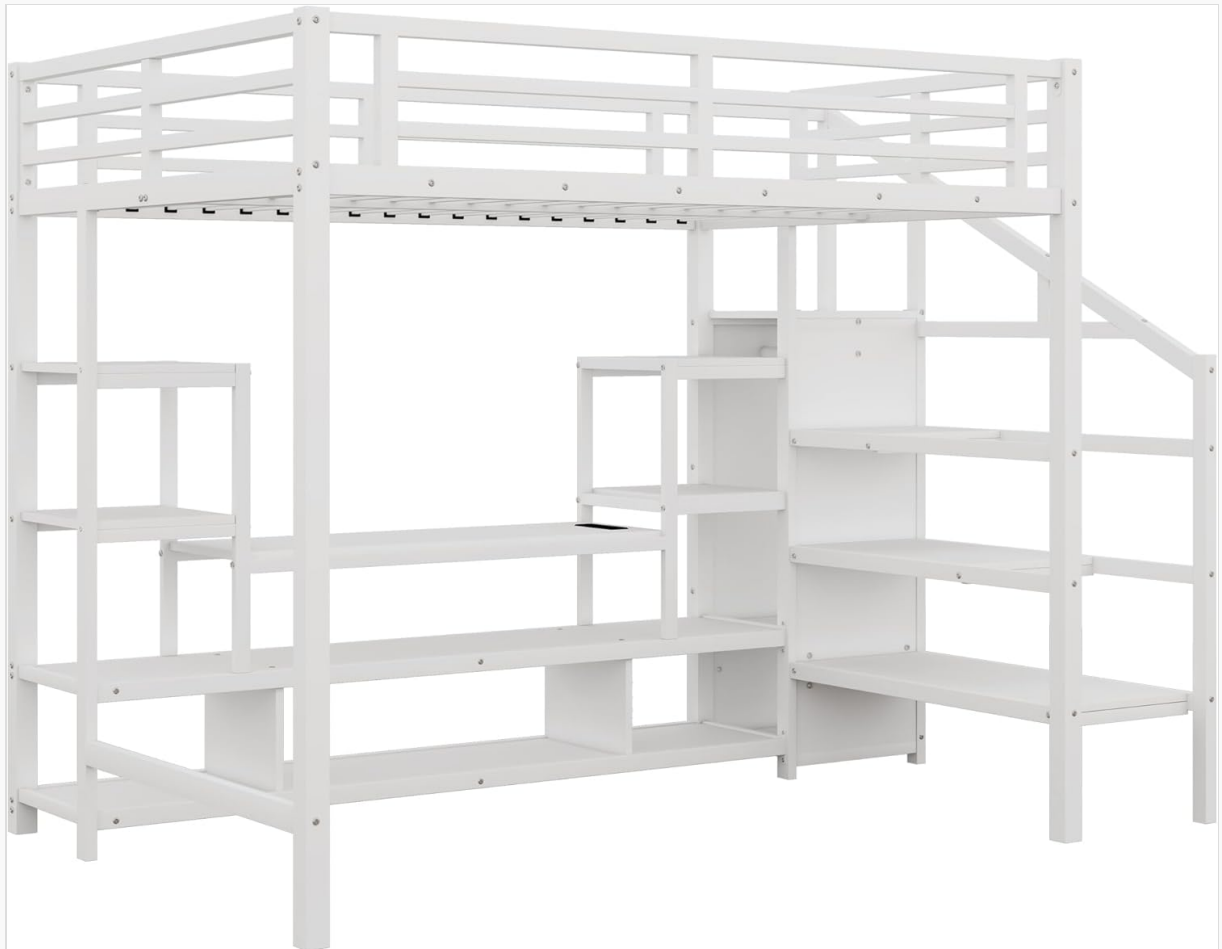
Image 3: Angled view of the assembled loft bed, highlighting the integrated storage shelves and staircase.