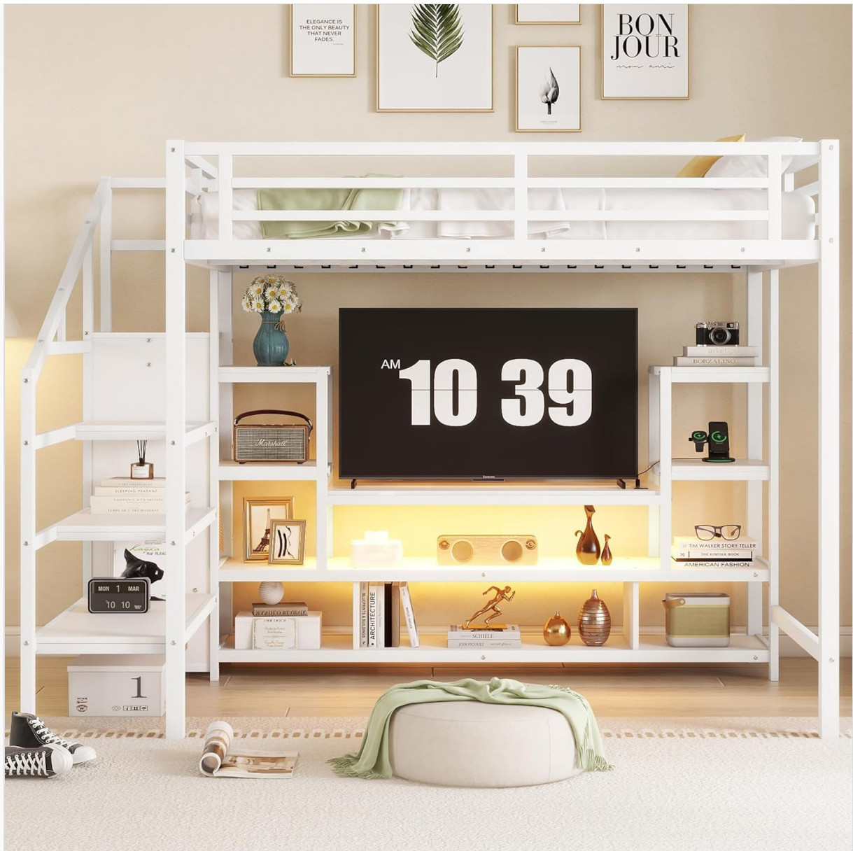
Image 5: Lifestyle view of the loft bed in a room setting, featuring a TV on the stand and various items on the shelves.