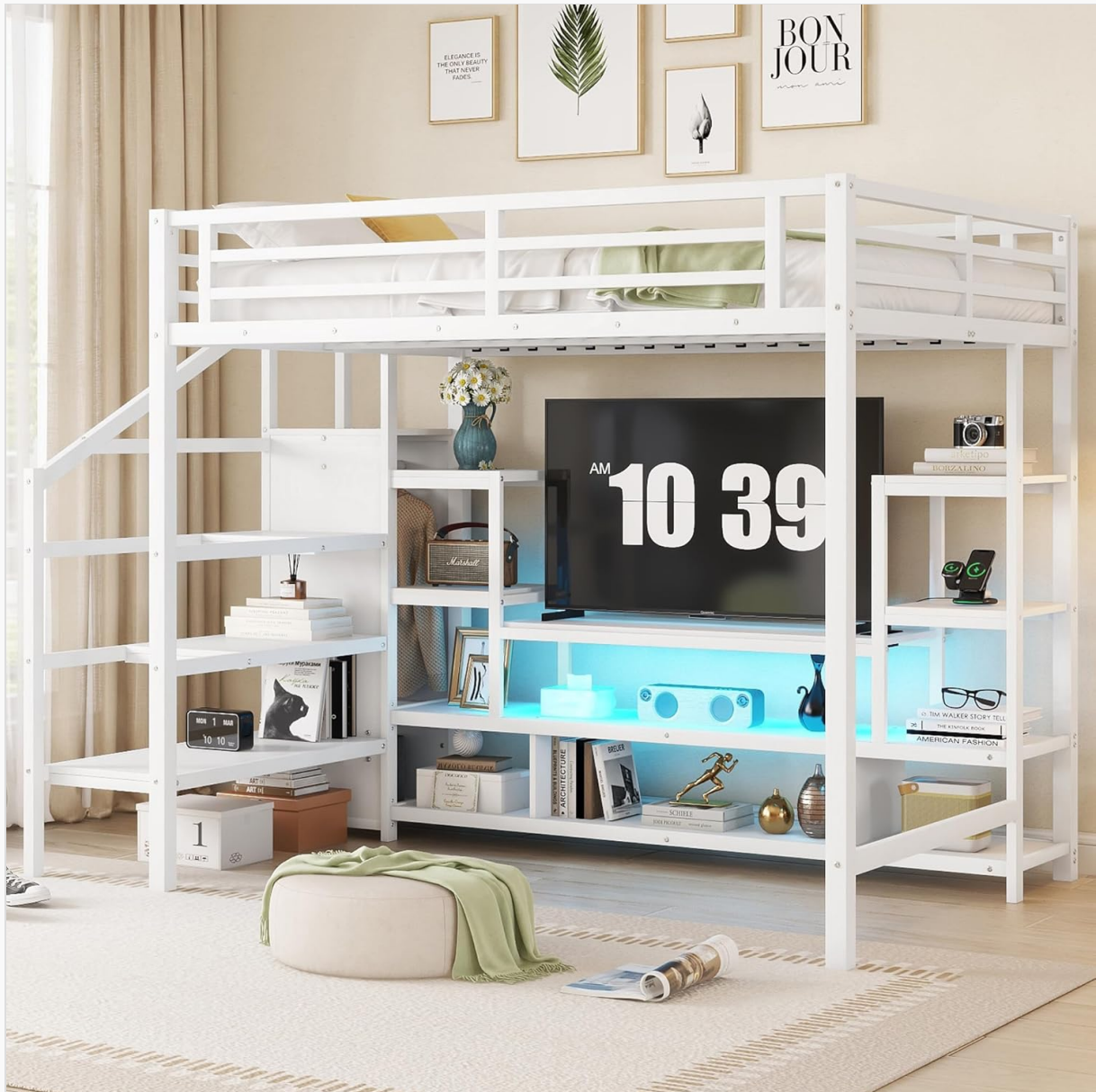
Image 1: Overall dimensions of the loft bed. Length: 93.3 inches, Width: 56.7 inches, Height: 68.7 inches. The upper bed platform is 75.2 inches long. The space under the loft bed is 55.7 inches high.

Familiarize yourself with the overall dimensions of the loft bed to ensure it fits your intended space.