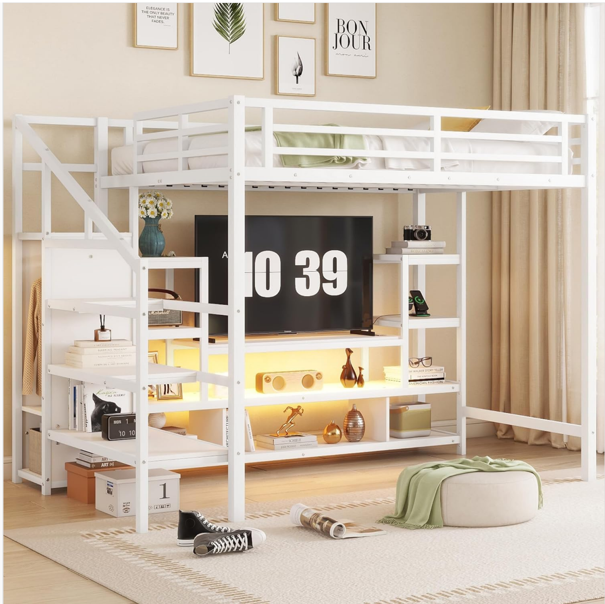
Image 6: Another lifestyle view, showing the loft bed integrated into a bedroom, emphasizing its functional storage and entertainment features.