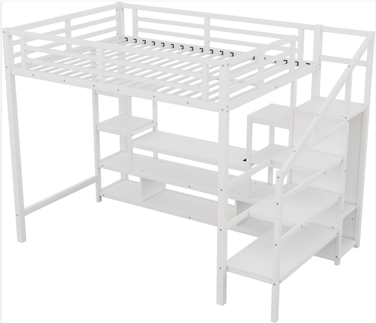
Image 4: Another angled view of the assembled loft bed, showing the full structure from a different perspective.