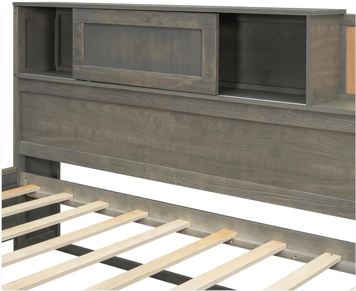
Image: A detailed view of the headboard's top storage shelf, showing the sliding panel in a partially open position.