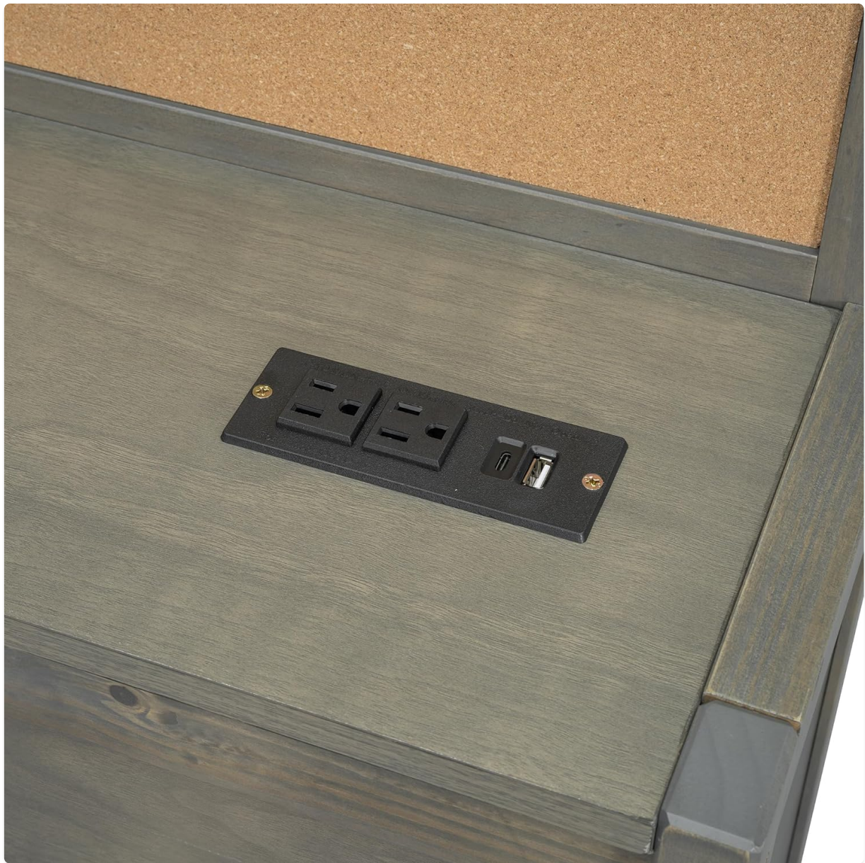
Image: A close-up shot of the charging station, highlighting the two electrical outlets and two USB ports.