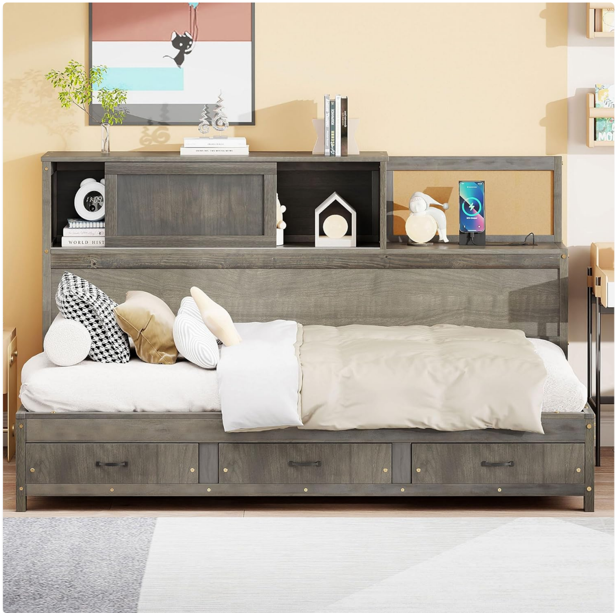
Image: Fully assembled Merax Twin Daybed with mattress and decor, showcasing its design and functionality.