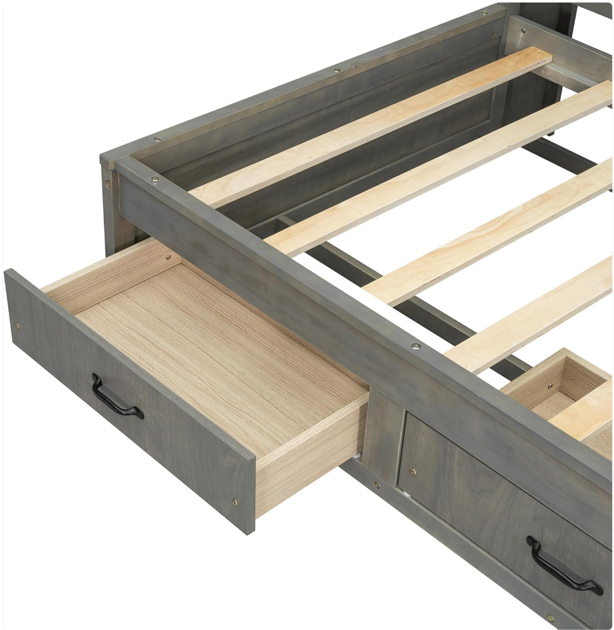
Image: A close-up view of one of the three storage drawers, partially open, showing its interior space.