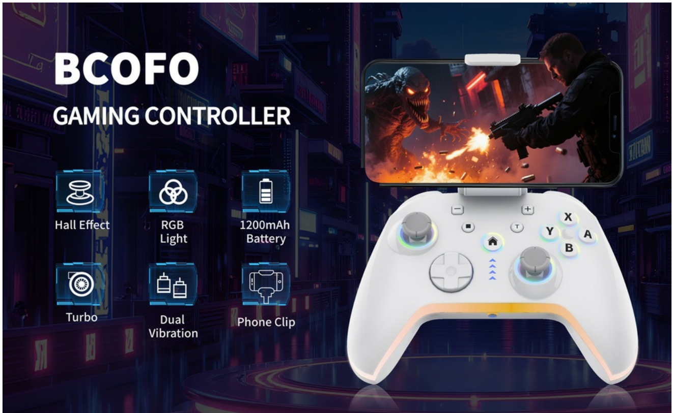
Image: The Bcofo Mobile Gaming Controller showcasing its RGB lighting effects.