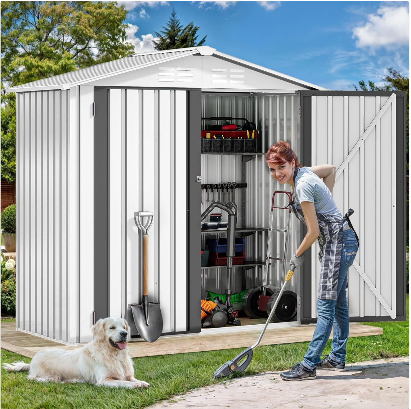
Image: The DWVO 6x4ft Metal Storage Shed, showcasing its spacious interior and secure door, situated in a backyard environment. A person is seen sweeping near the shed, and a dog is resting on the grass, illustrating the shed's integration into an outdoor space.