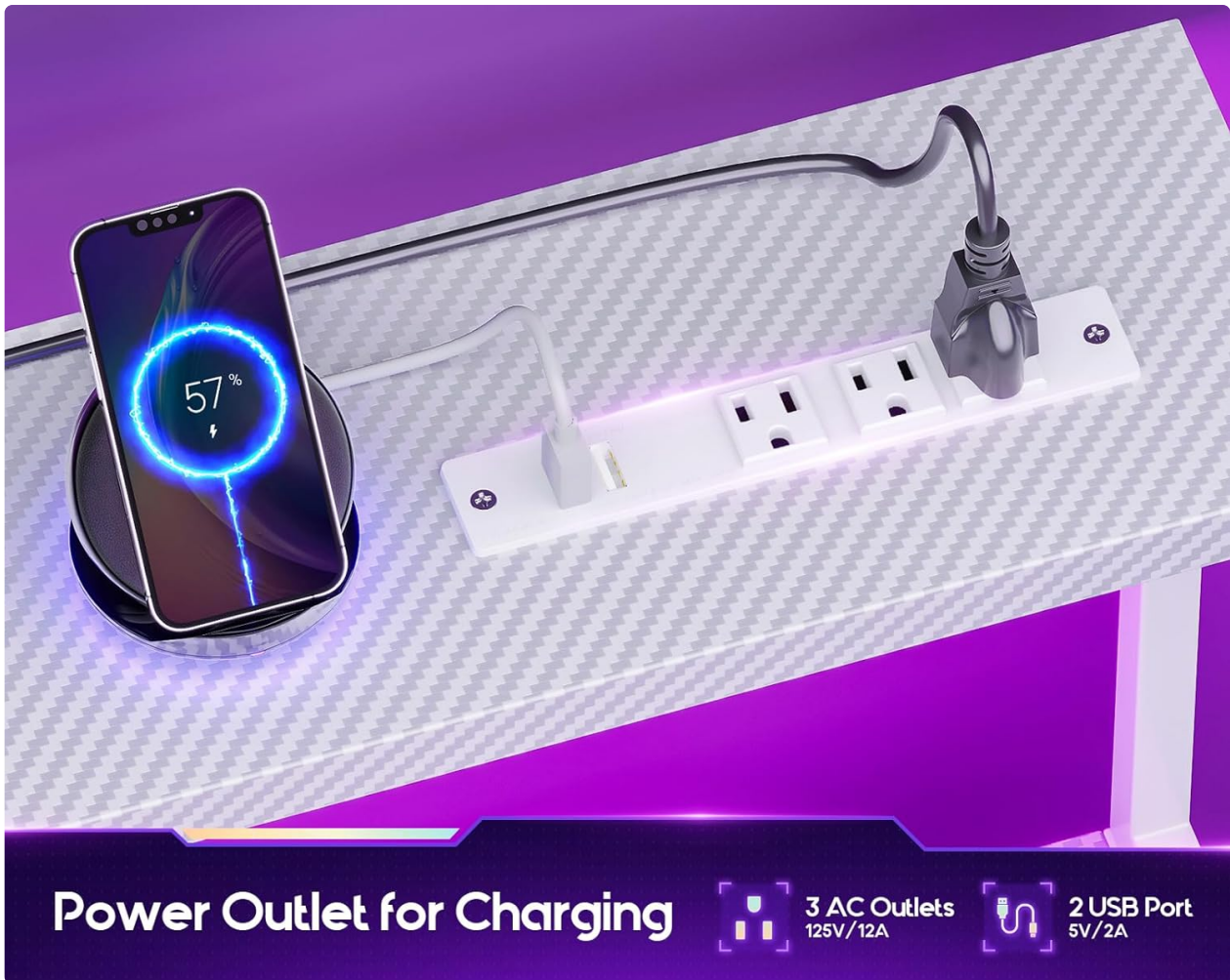
Image: Close-up of the built-in power outlet on the desk, showing 3 AC outlets and 2 USB ports in use for charging a smartphone.