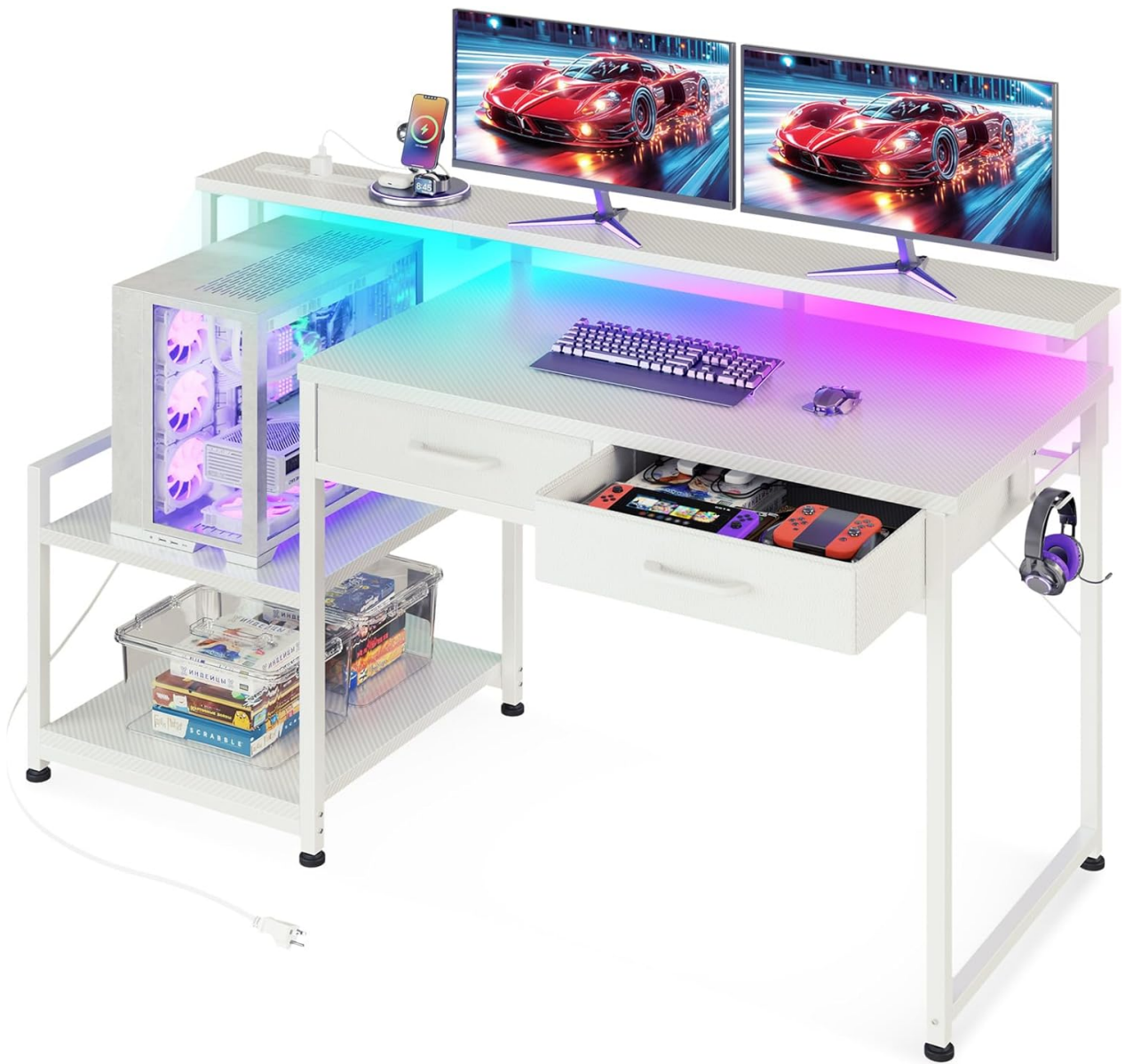
Image: The ODK 48-inch gaming desk featuring LED lights, a monitor stand, and storage shelves.