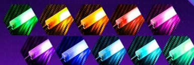
Image: The ODK gaming desk illuminated by its integrated RGB LED light strip, showcasing various color options.