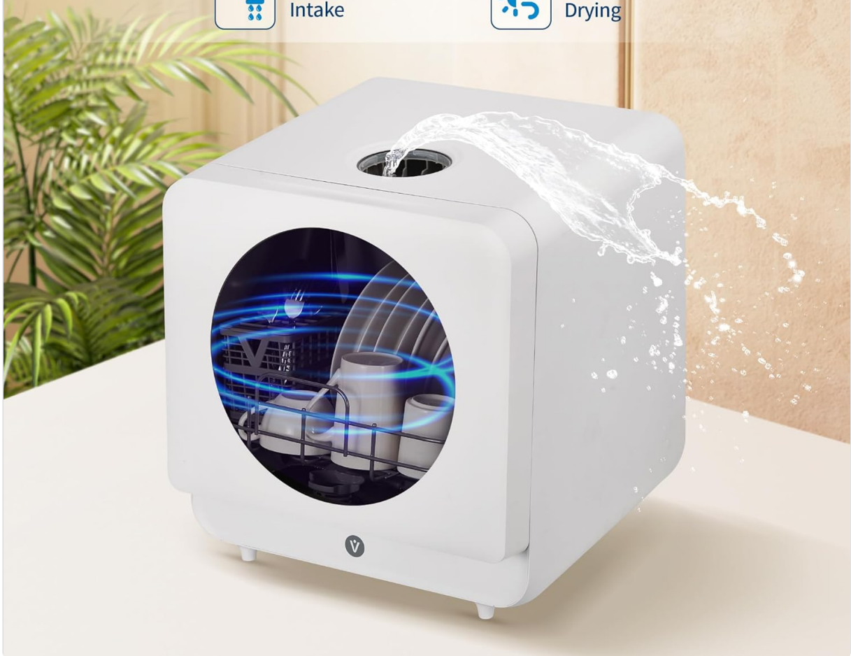
Figure 4.1: Automatic Water Intake and Hot Air Drying