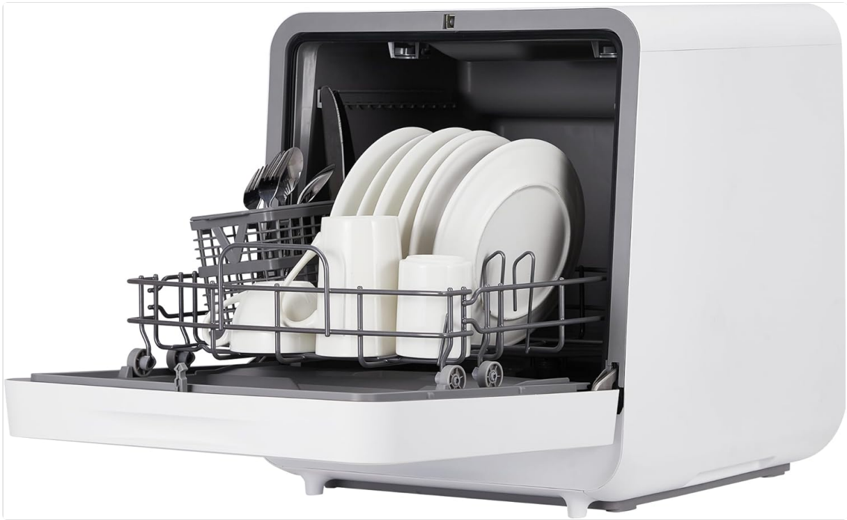
Figure 5.1: Properly Loaded Dishwasher Interior