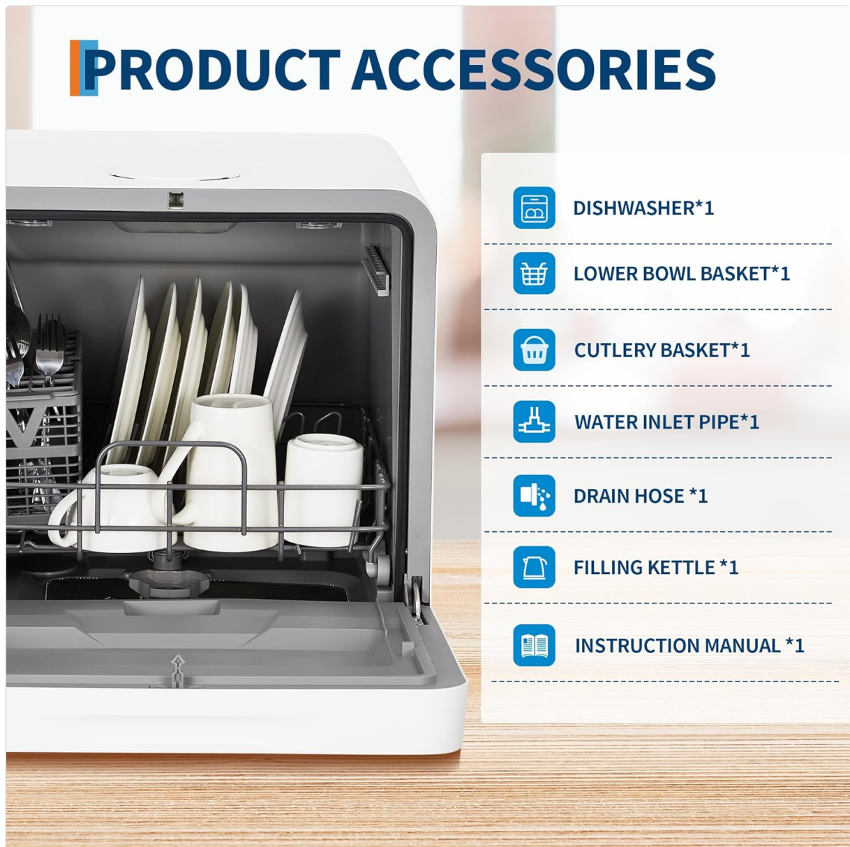
Figure 3.1: Included Product Accessories

Your Takywep Portable Countertop Dishwasher package includes: