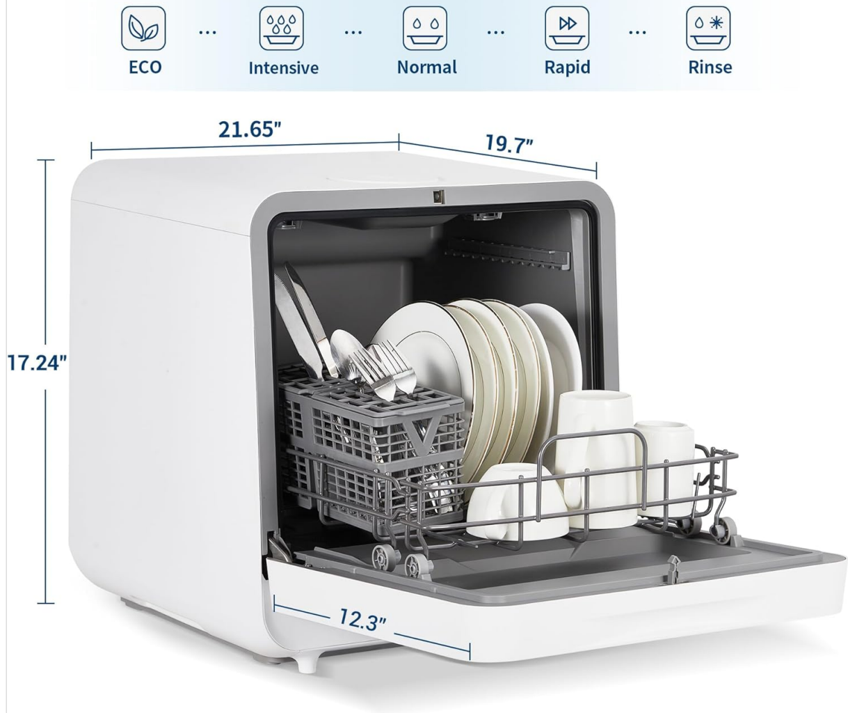
Figure 5.3: Available Wash Cycles

The dishwasher features a touch control panel with various wash cycles to suit different cleaning needs: