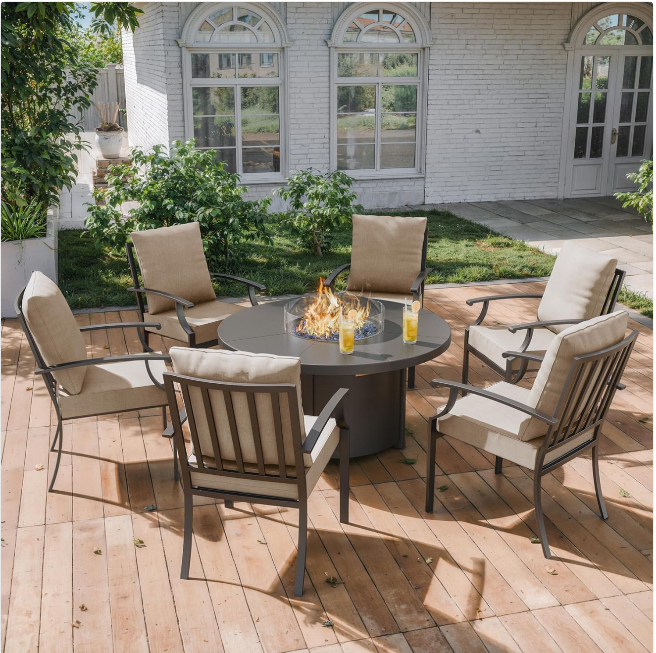
Image 1.1: The ALAULM 7-Piece Outdoor Dining Set, featuring six chairs and a round fire pit table.