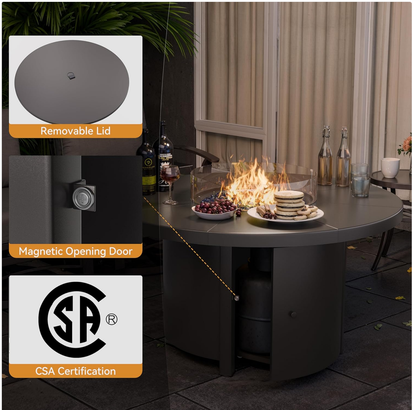
Image 2.1: The fire pit table features a magnetic opening door for propane tank access and is CSA certified for safety.