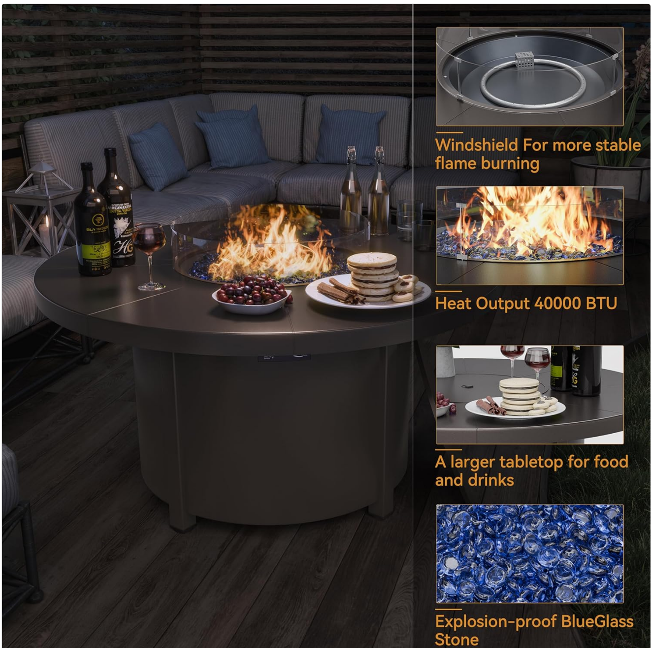
Image 5.1: The fire pit table operating with a windshield for stable flame burning, showcasing its 40,000 BTU heat output and decorative blue glass stones.