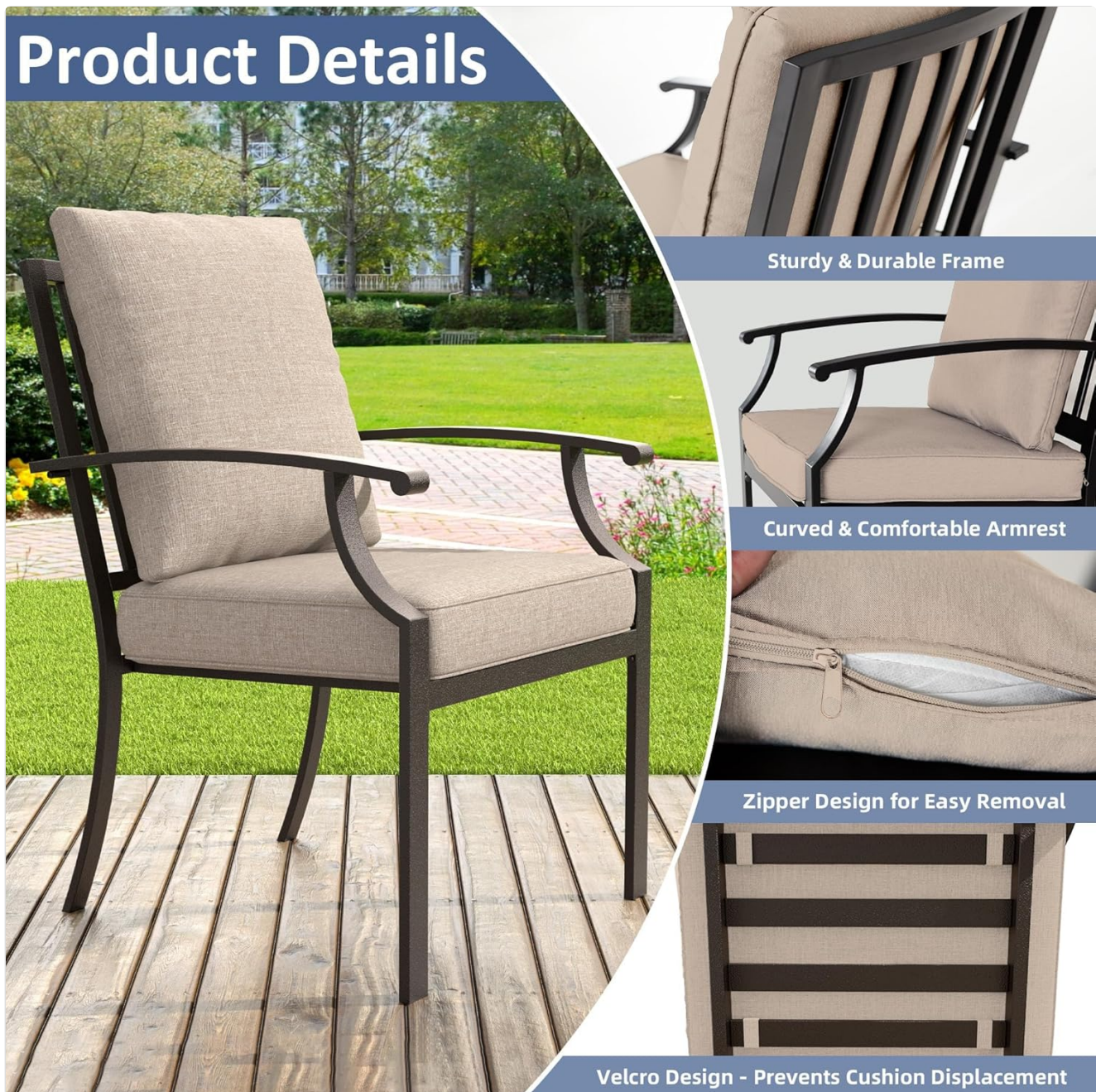
Image 4.1: Detailed view of chair features, including the sturdy frame, curved armrest, zippered cushion cover, and Velcro for cushion stability.