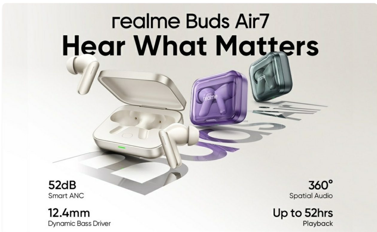
Image: An overview graphic highlighting key features like 52dB Smart ANC, 12.4mm Dynamic Bass Driver, 360° Spatial Audio,