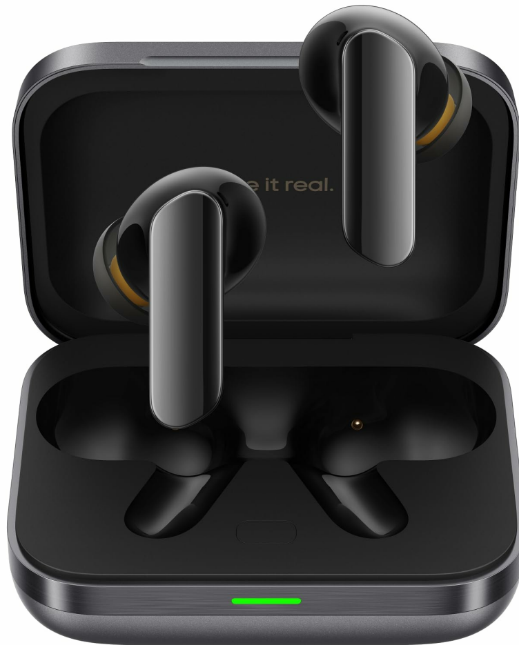
Image: The realme Earbuds Air 7 charging case in Slate Grey, with the realme logo visible.