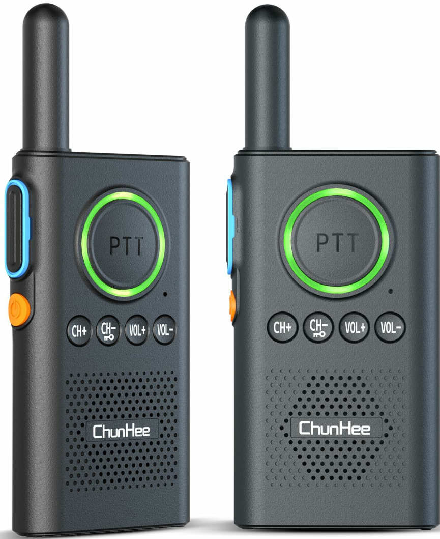
Figure 1: ChunHee WT42 Wireless Intercom Unit