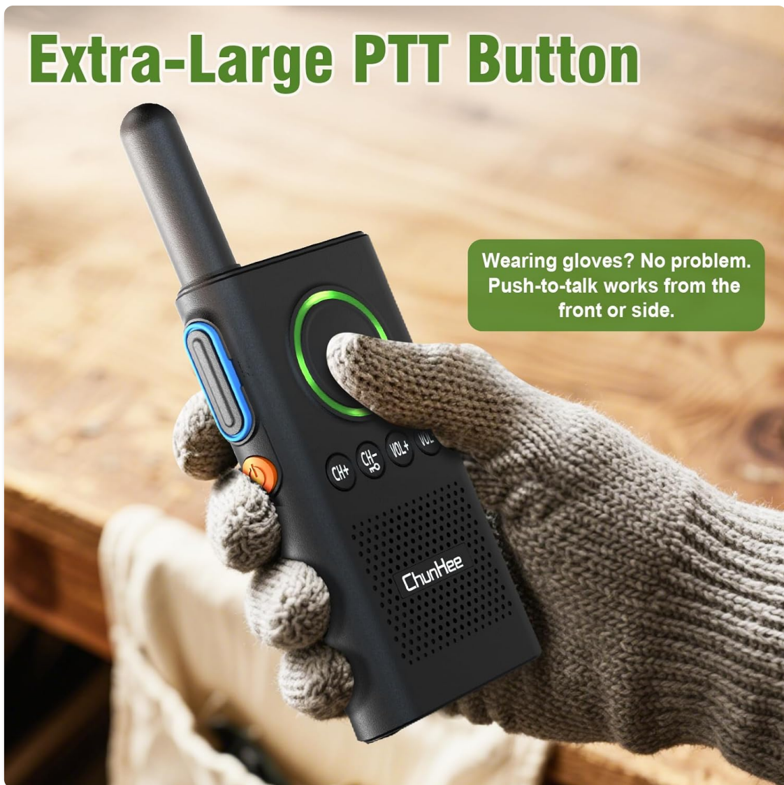
Figure 4: Extra-Large PTT Button for easy use.

To speak, press and hold the large PTT (Push-to-Talk) button. The PTT button will light up red, indicating transmission. Release the button to listen. For clear communication, speak directly into the microphone located below the PTT button.