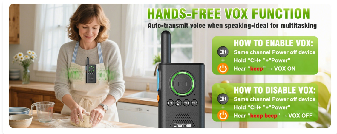
Figure 5: Hands-Free VOX Function in use.

Video 3: Detailed guide on how to enable and disable the VOX function.