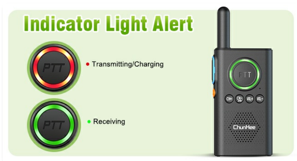
Figure 3: Indicator Light Alerts