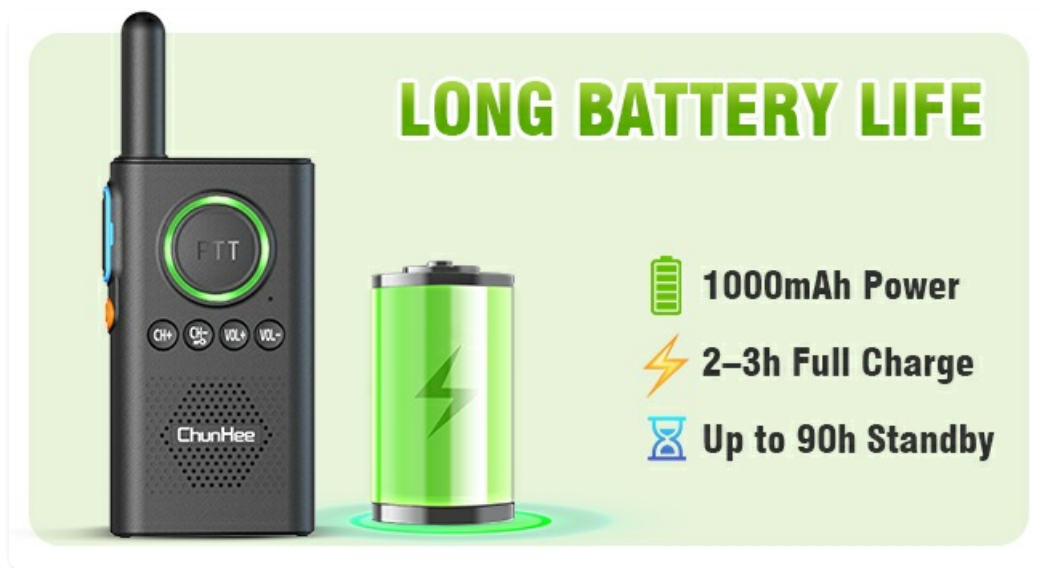
Figure 2: Battery and Charging Information