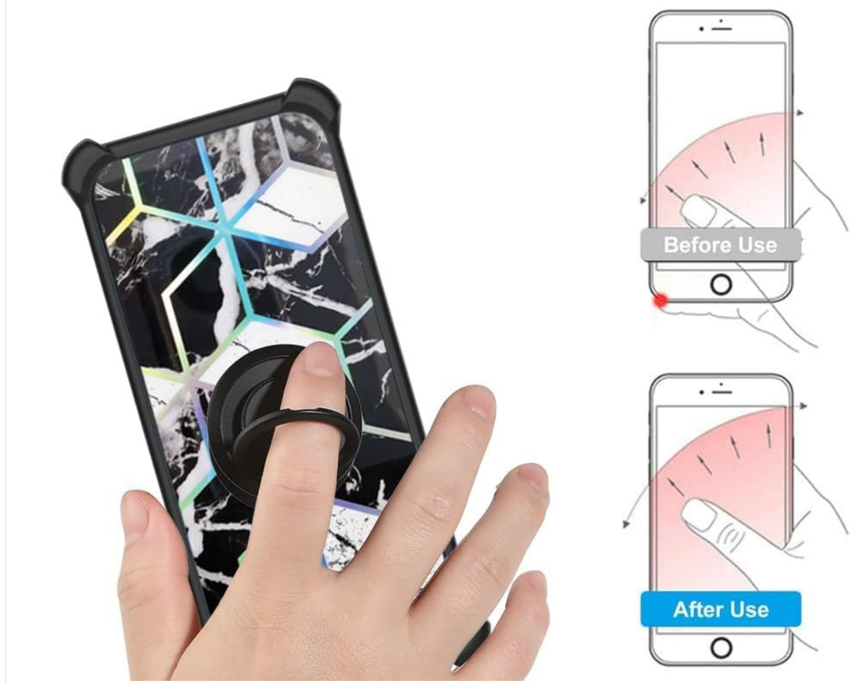
Image 6: Illustration of how the ring support enables easier one-hand operation and reach across the screen.