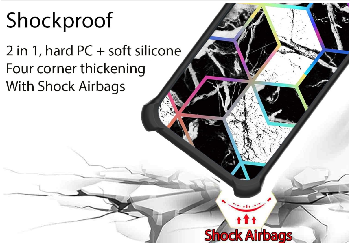
Image 2: Illustration of the shockproof design with reinforced corners and shock airbags.

2 in 1, hard PC + soft silicone Four corner thickening With Shock Airbags