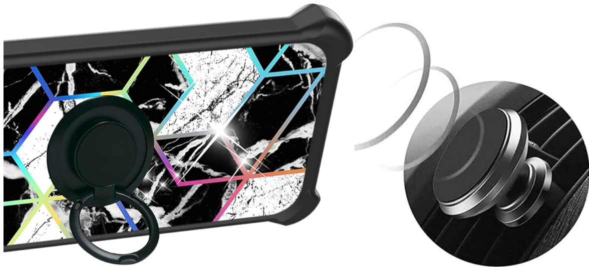
Image 7: Depiction of the case's compatibility with magnetic car mounts, showing the ring rotating 180 and 360 degrees.

Not include magnetic car mount, not support wireless charging.