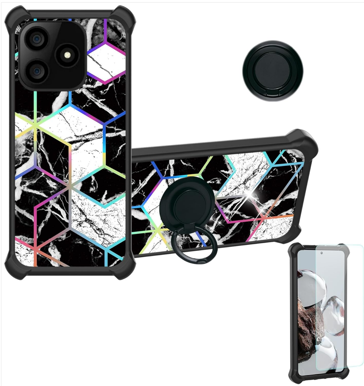
Image 1: Contents of the package including the phone case, ring holder, and screen protector.