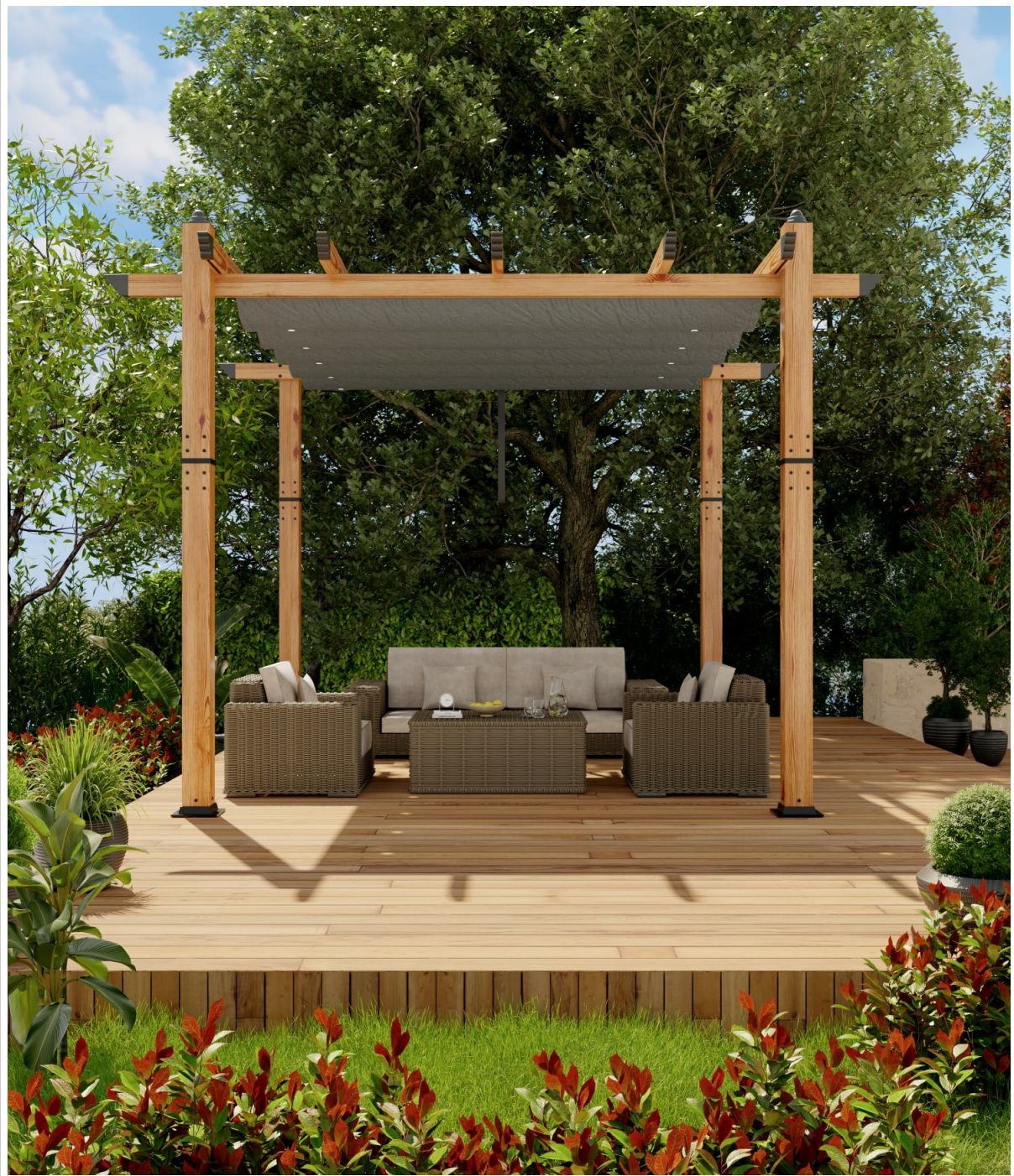
Image 2.1: The Hipicute 10x10FT Outdoor Pergola with its retractable canopy fully extended.