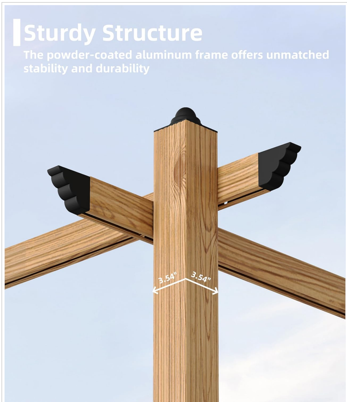
Image 4.1: Close-up of the sturdy aluminum frame construction with faux wood finish.

posts. Ensure all screws are tightened securely.