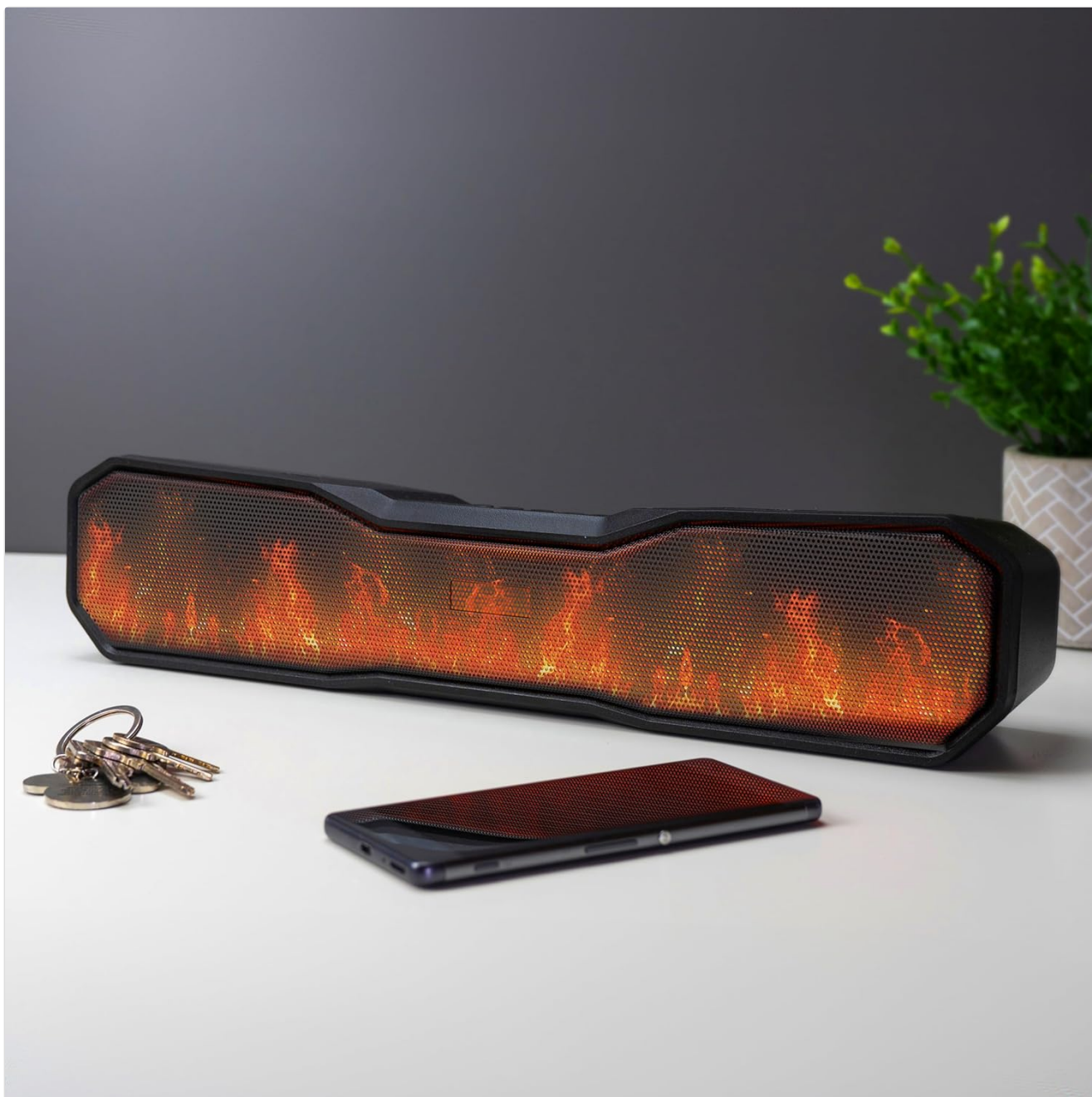
Image: The speaker displaying an orange flame effect, positioned on a surface next to a smartphone and keys.

a light bulb icon) on the top panel to cycle through the available lighting patterns and colors. These include various flame simulations and color-changing effects.