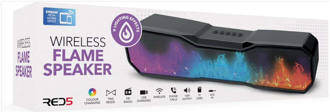
Image: The retail packaging for the RED5 Wireless Flame Speaker, indicating contents.