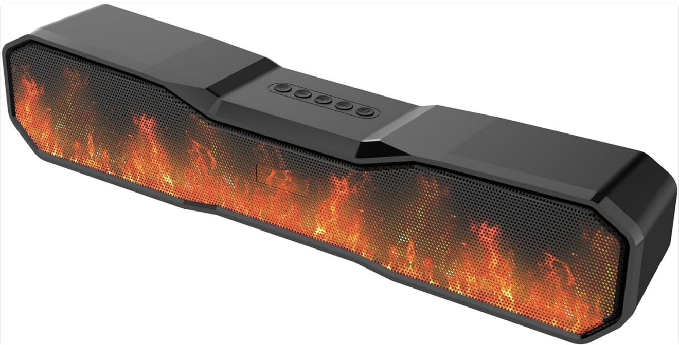
Image: The speaker displaying a classic orange flame effect.