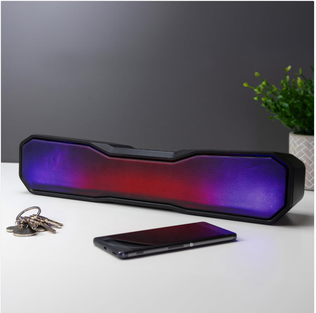
Image: The speaker illuminated with a dynamic purple and red light effect.