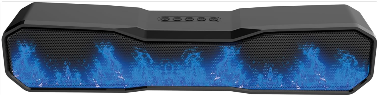
Image: The speaker showcasing a cool blue light effect.