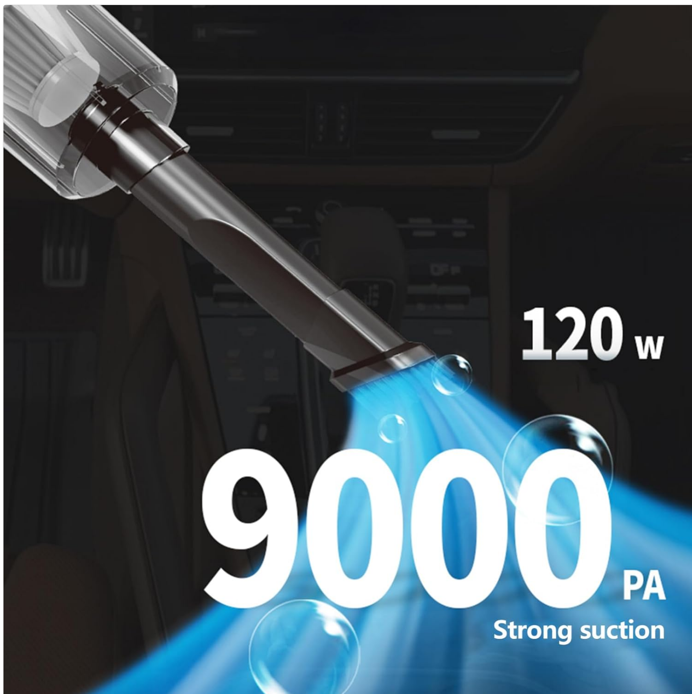
Figure 8: Visual representation of the vacuum cleaner's strong suction power, rated at 9000Pa with a 120W motor, indicating its capability for effective cleaning.