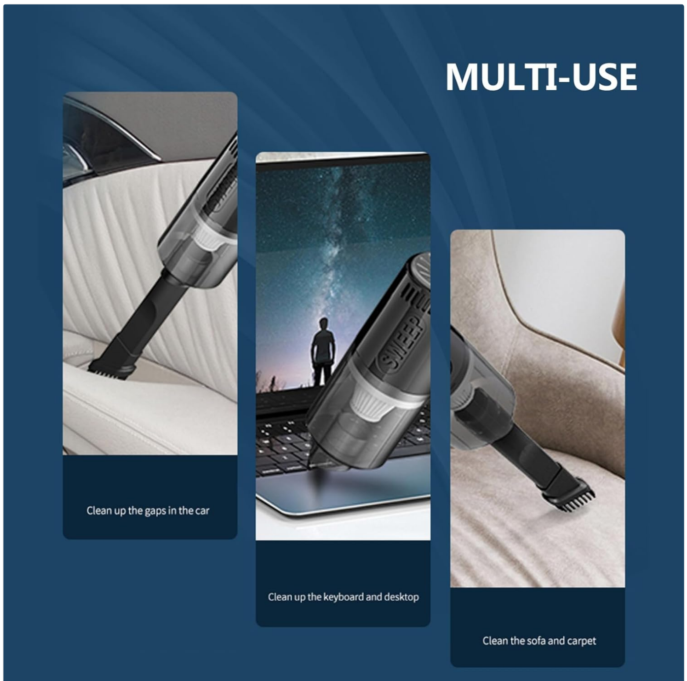
Figure 7: Examples of multi-use applications for the vacuum cleaner. It effectively cleans gaps in cars, keyboards and desktops, and sofas and carpets.