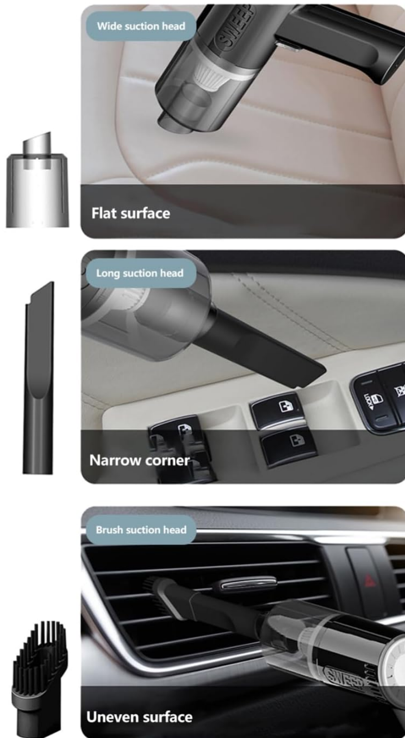
Figure 6: Overview of the replaceable suction heads. This includes a wide suction head for flat surfaces, a long suction head (crevice tool) for narrow corners, and a brush suction head for uneven surfaces.