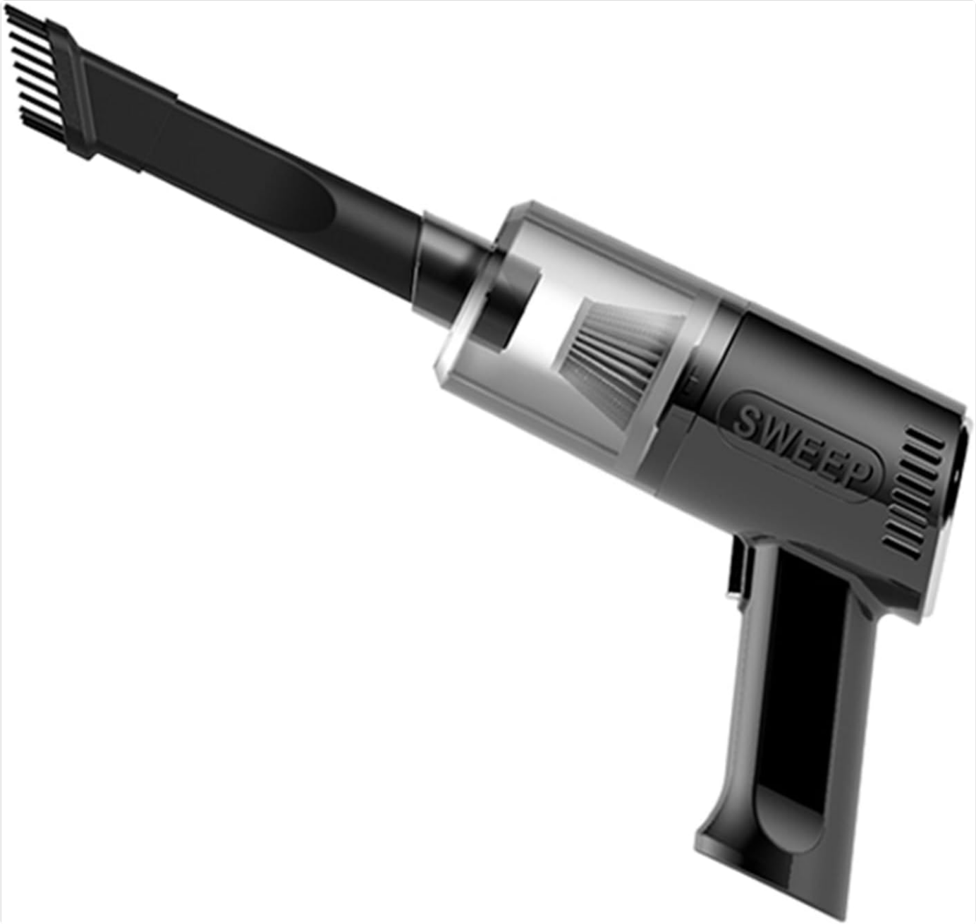
Figure 1: Main unit of the Handheld Cordless Electric Vacuum Cleaner. This image shows the compact design of the vacuum cleaner, featuring the main body, dustbin, and a brush attachment.