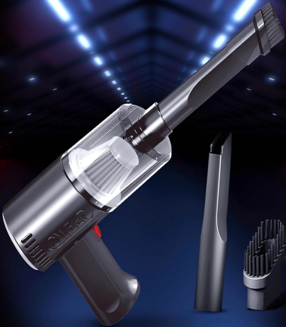
Figure 2: The handheld vacuum cleaner shown with its included accessories: a long crevice tool and a brush attachment. These attachments enhance the versatility of the vacuum for different cleaning needs.