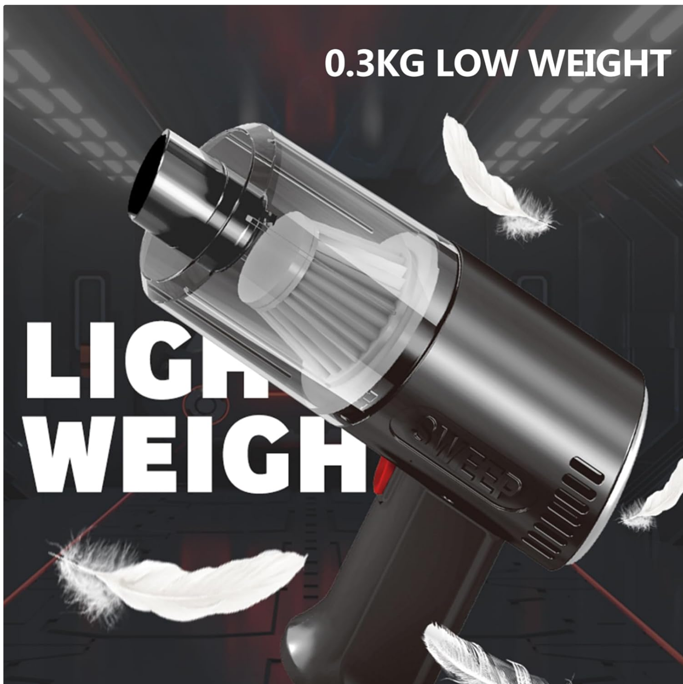
Figure 4: Illustration emphasizing the lightweight design of the vacuum cleaner, weighing approximately 0.3kg. This feature contributes to comfortable extended use without fatigue.