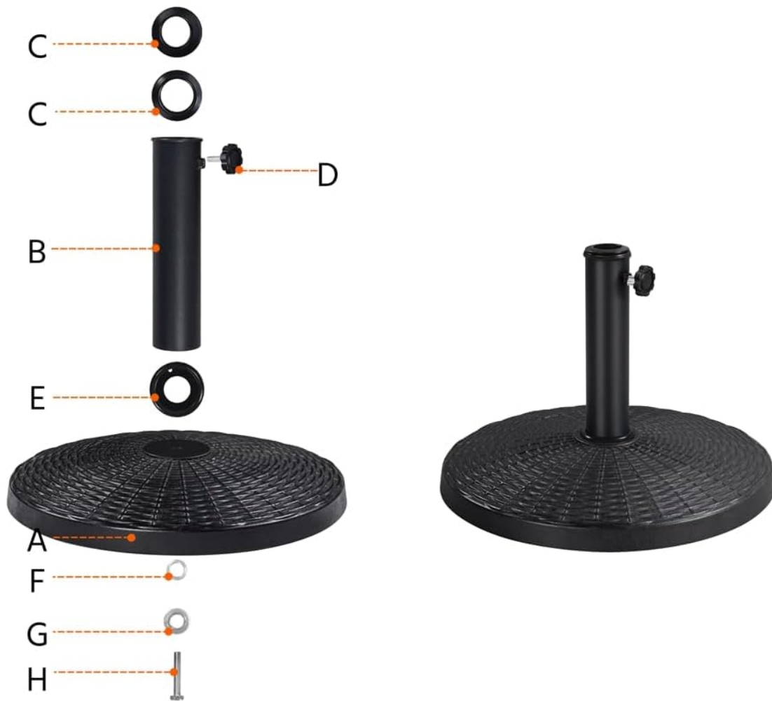
Image 8: The resinous material of the base, indicating waterproof, sunproof, and aging-resistant properties.