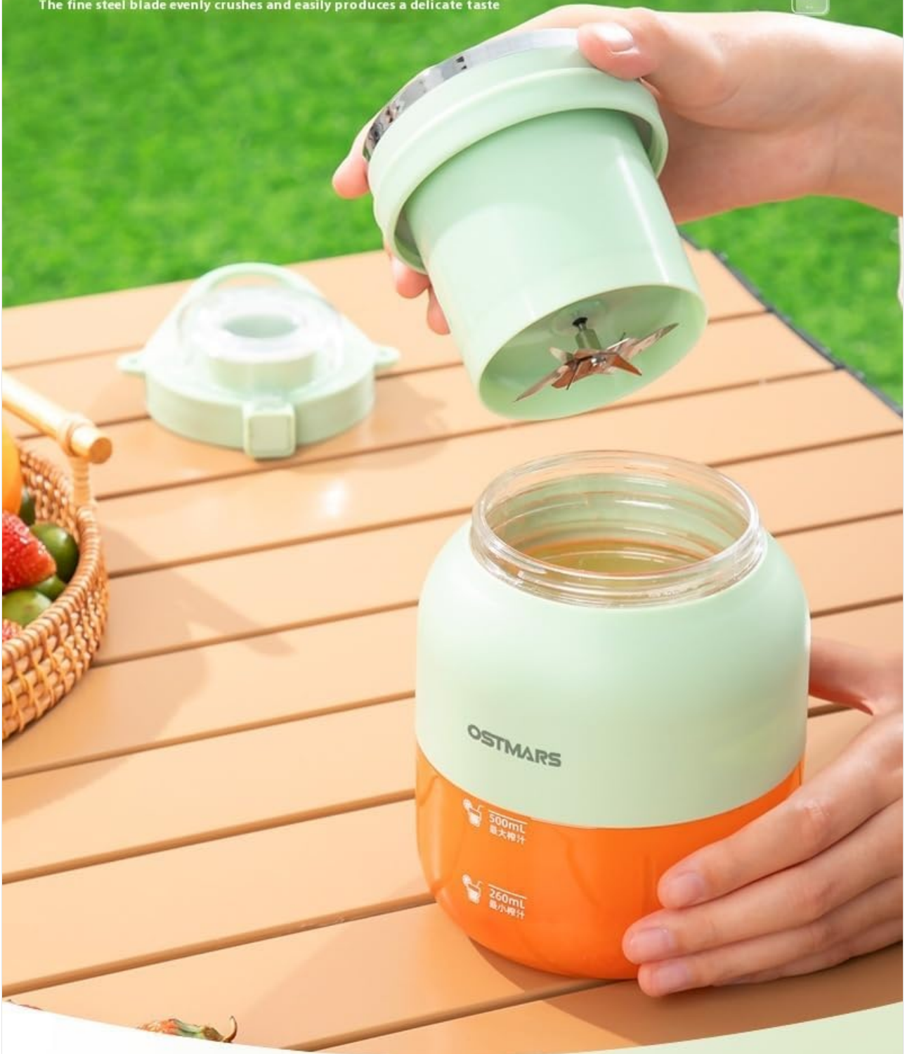
Image: Disassembled view of the blender, illustrating the motor base with its integrated blade, the transparent blending cup, and the lid. This shows the