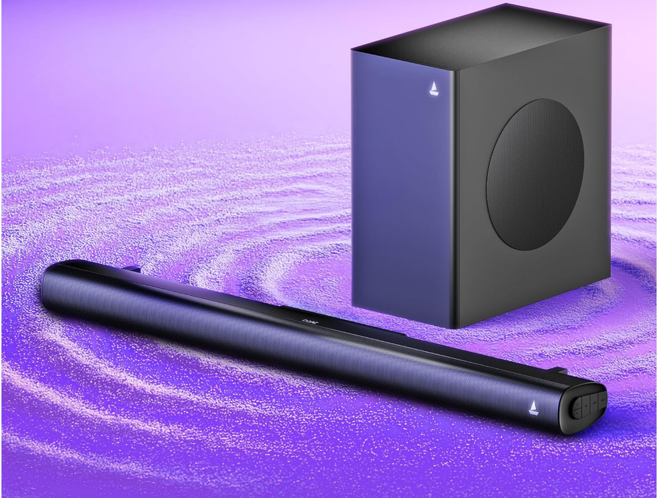
Image 3.1: The boAt Aavante 2.1 2000 Soundbar and its wired subwoofer.