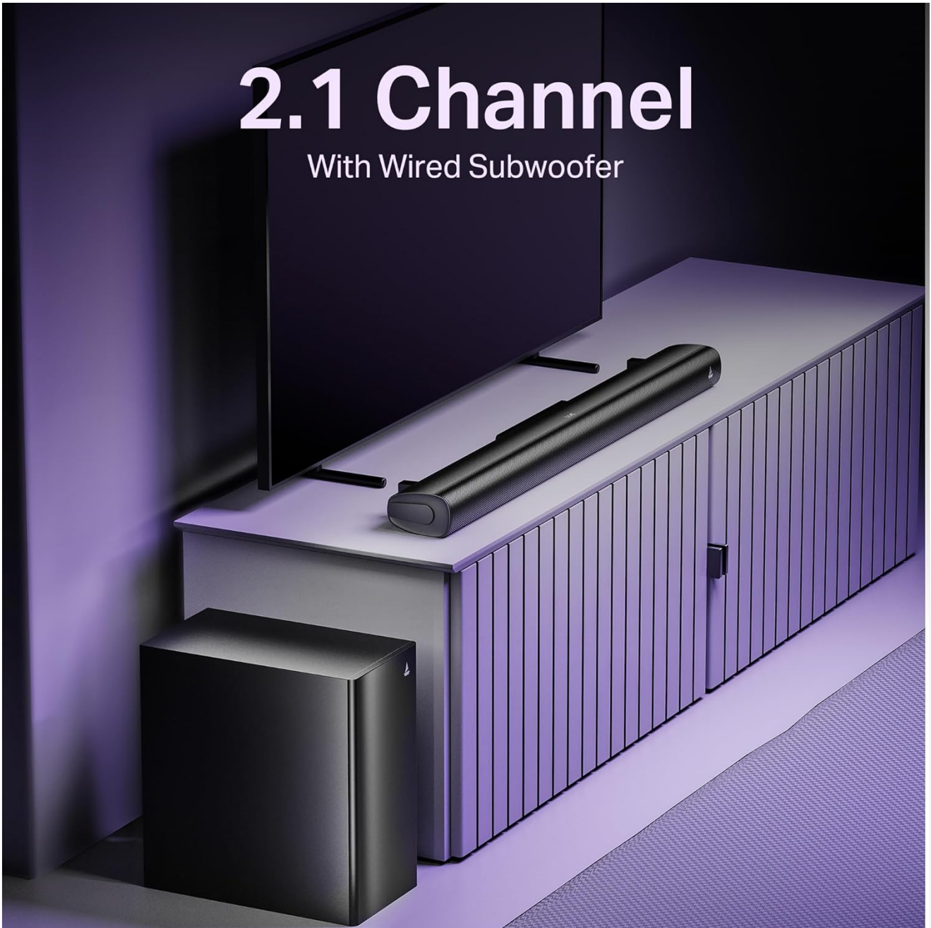
Image 3.2: The soundbar and subwoofer integrated into a home entertainment setup.