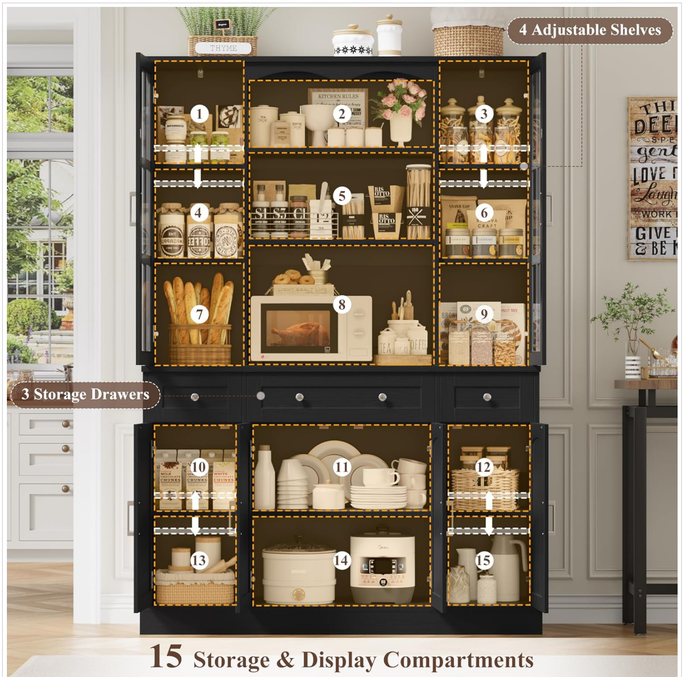
Figure 4.2: Overview of the 15 storage compartments and 3 drawers, highlighting the adjustable shelves.

Ensure all connections are tightened securely after assembly to maintain stability. Do not overtighten screws to avoid damaging the engineered wood.