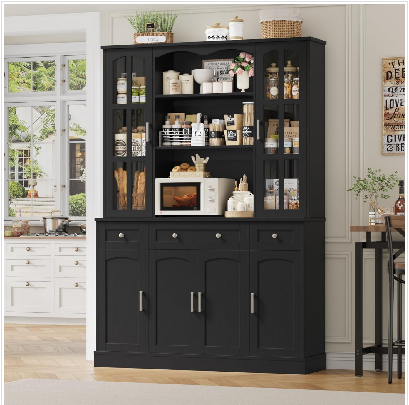
Figure 5.1: The cabinet functioning as a kitchen pantry with a microwave on the countertop.