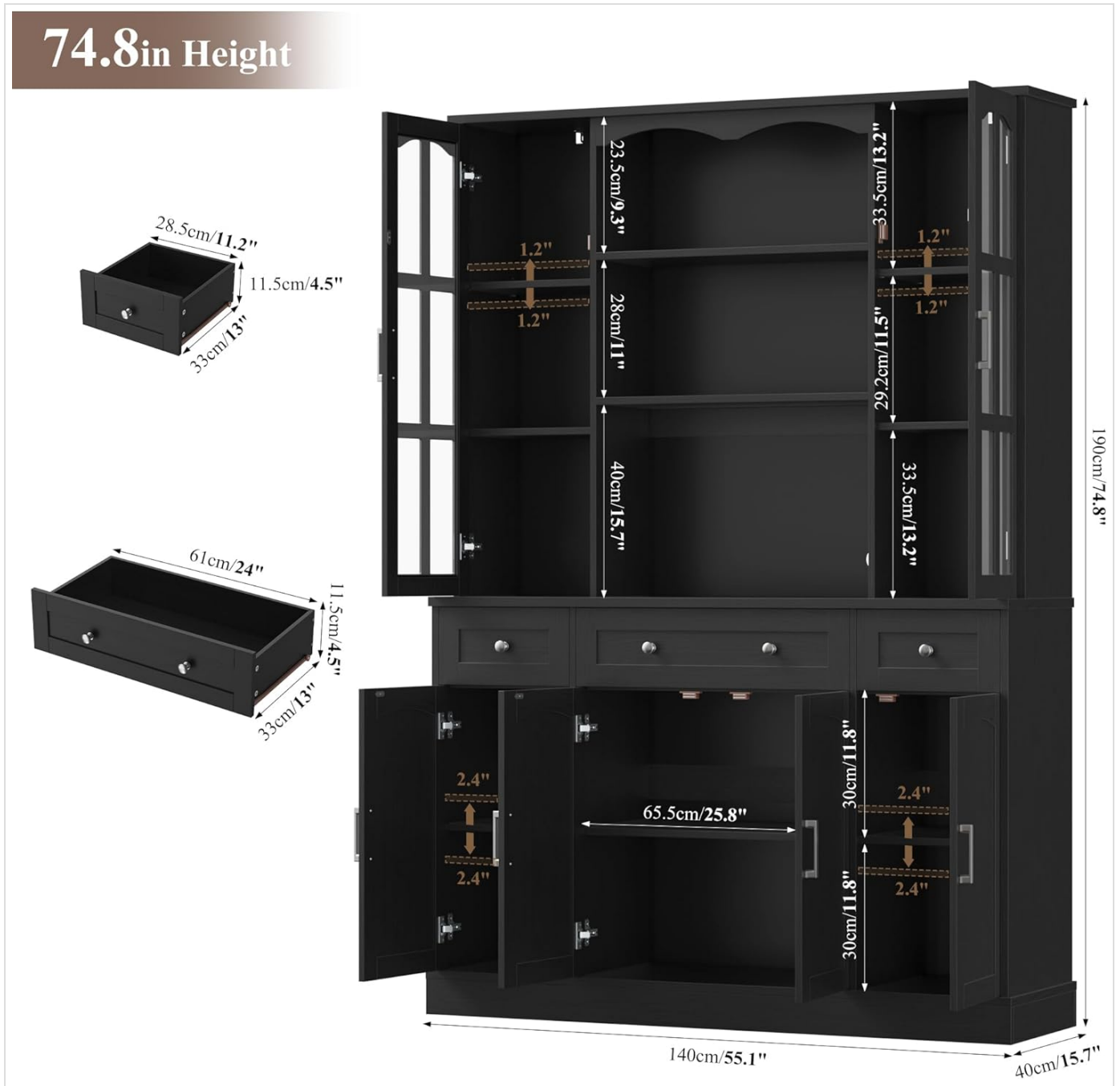
Figure 4.1: Detailed dimensions and internal layout of the cabinet, crucial for assembly planning.

Detailed step-by-step assembly instructions are provided in the separate instruction manual included in your package. Each part is numbered, and detailed steps are outlined for clarity. We recommend having two people for certain assembly steps, particularly when lifting and positioning the upper section onto the lower base.