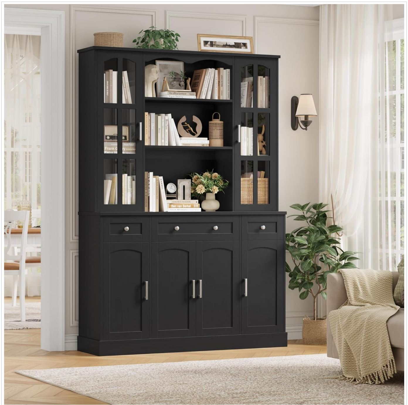
Figure 5.2: The cabinet adapted for use in a living room, showcasing its versatility.