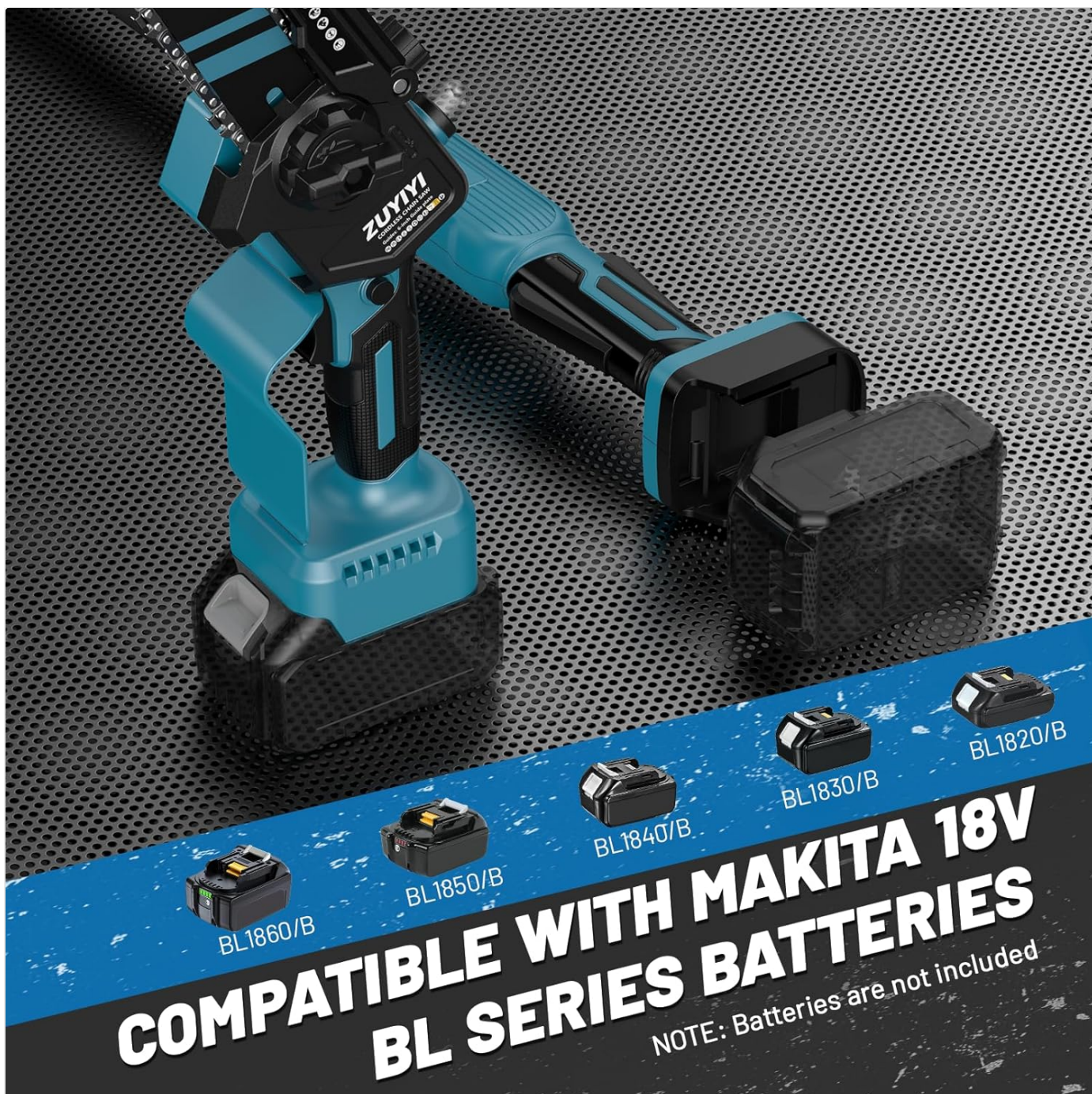
Image: Close-up of the tool's battery port, illustrating its compatibility with various Makita 18V BL series batteries.