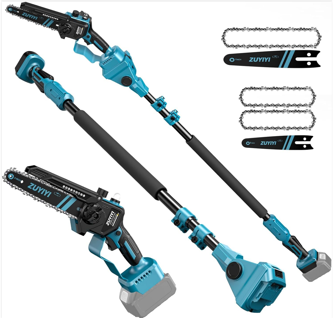
Image: Overview of the ZUYIYI 3-in-1 Cordless Pole Saw and Mini Chainsaw, showing the main unit, extension pole, and various chains and bars.