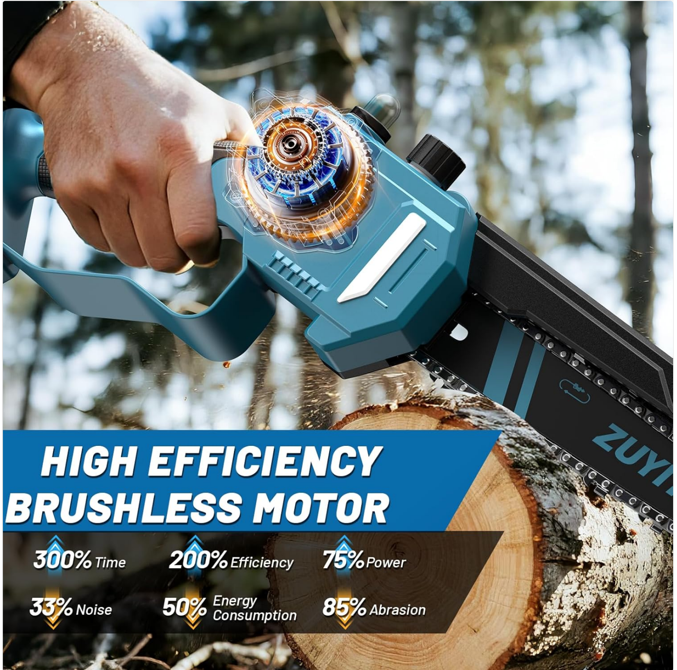
Image: Illustration of the high-efficiency brushless motor, emphasizing its benefits such as increased power and reduced energy consumption.

Included Components: Protective Cover, Cleaning Brush, User Manual, 2x 6-inch Chainsaw Chain, 1x 6-inch Bar, 2x 8-inch Chainsaw Chain, 1x 8-inch Bar, Bare Tool