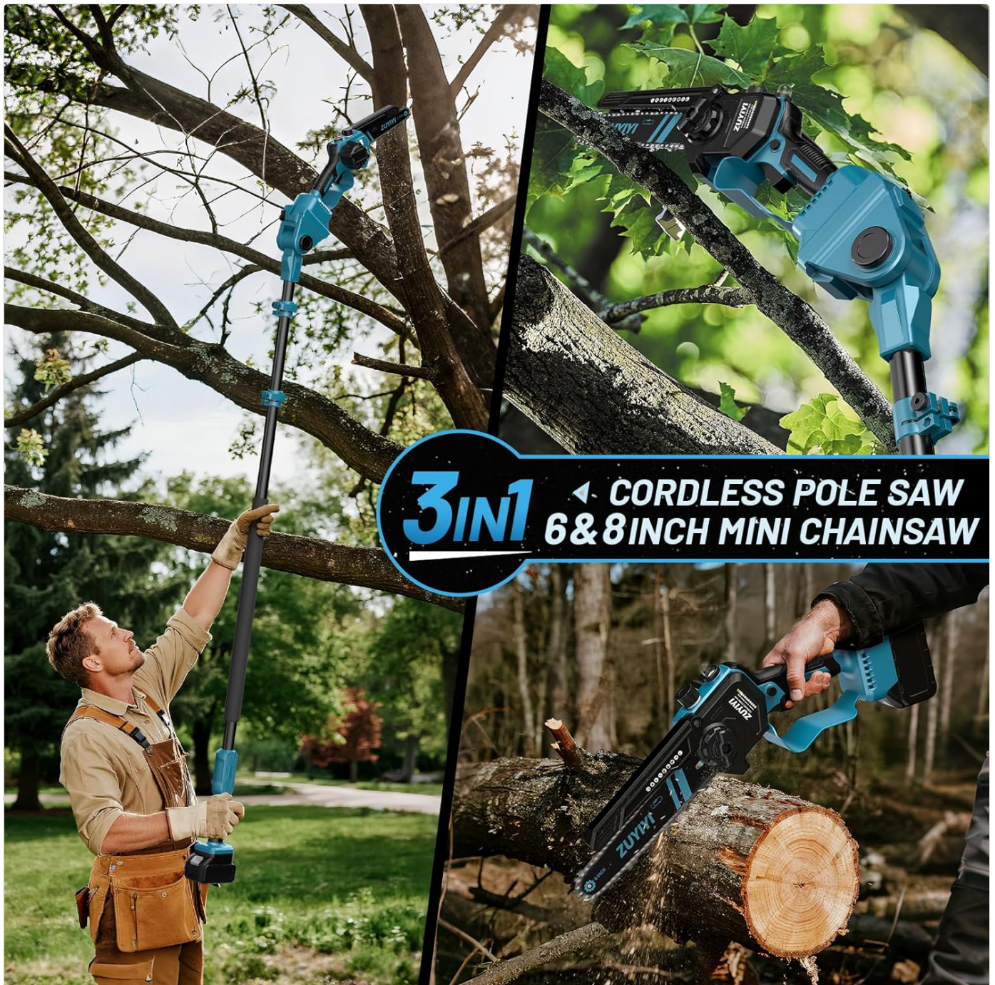
Image: Demonstrates the 3-in-1 functionality, showing the tool used as a handheld chainsaw for cutting logs and as a pole saw for trimming high branches.