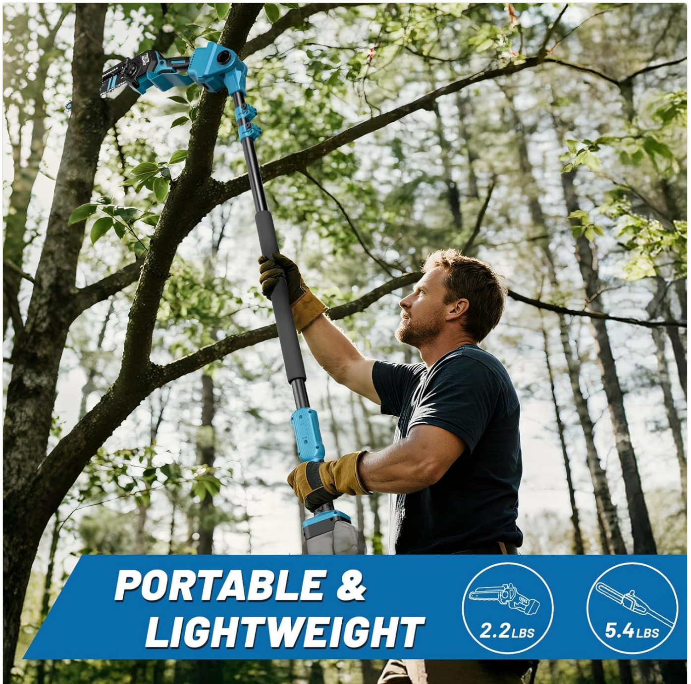
Image: Visual representation of the tool's lightweight design, indicating weights for both the handheld unit and the pole saw configuration.