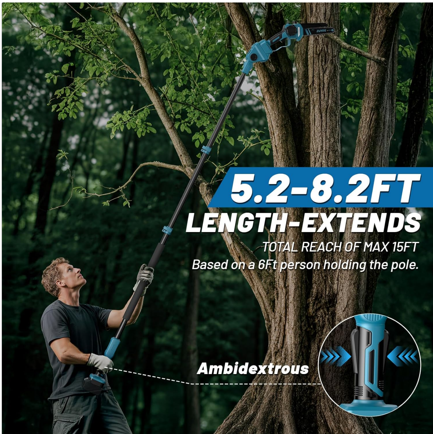
Image: A user operating the pole saw, showcasing its extended length and the ability to reach high branches for trimming.