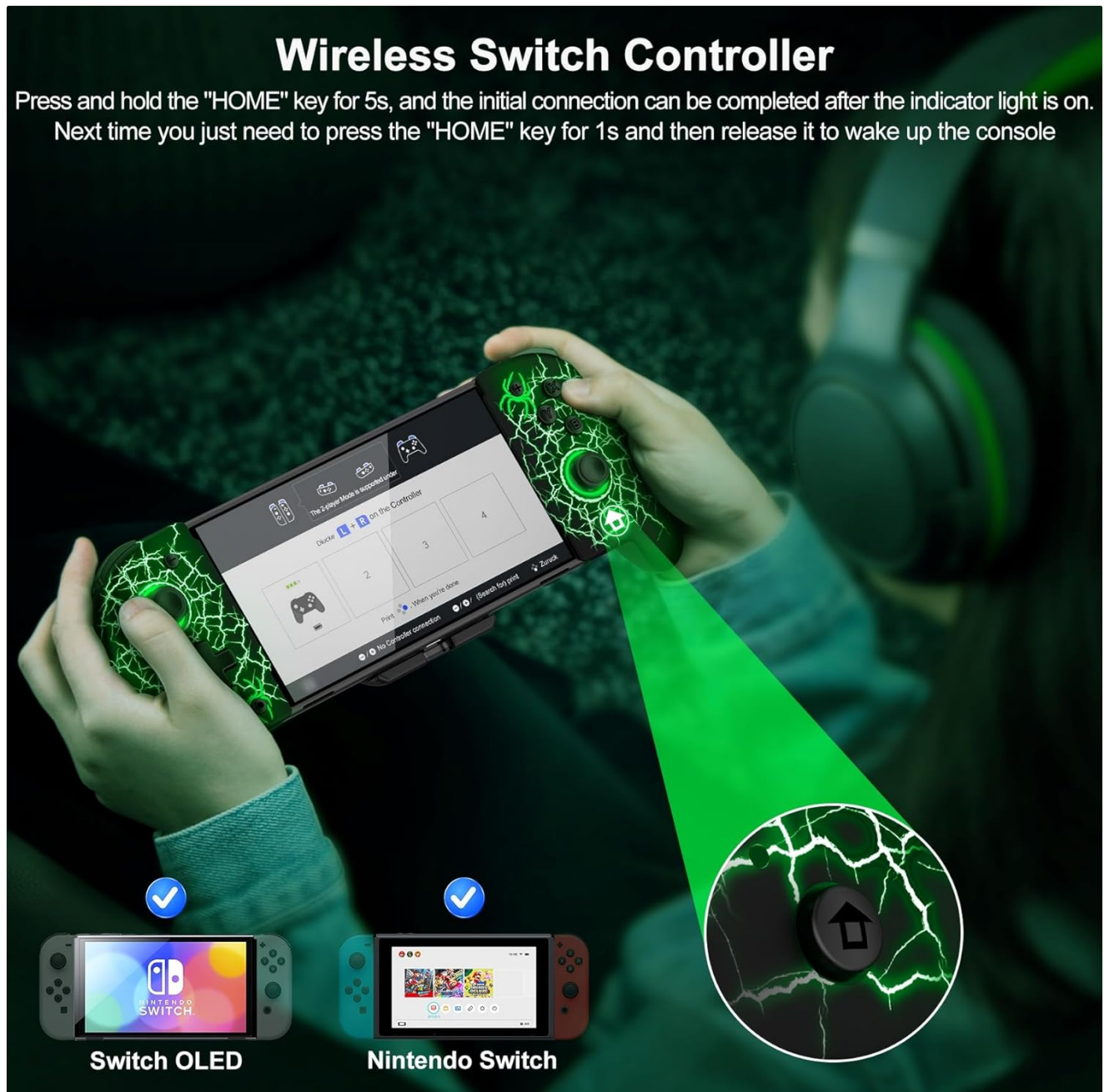
Image: Connecting the Mocagen controller to a Nintendo Switch console. The image shows the controller attached to a Switch