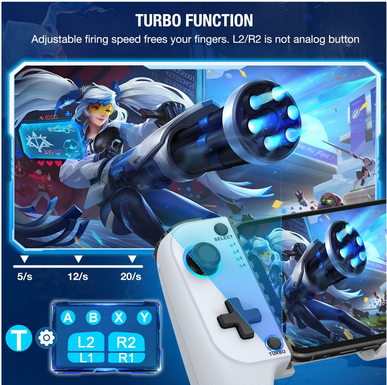
Image: Illustration of the Turbo function, showing adjustable firing speeds (5/s, 12/s, 20/s) and the buttons compatible with Turbo (A, B, X, Y, L1, L2, R1, R2).

The Turbo function allows you to set an adjustable firing speed for certain buttons, reducing repetitive button presses.