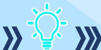
Image: Illustration of the watch's LED Light button and examples of the seven available backlight colors.