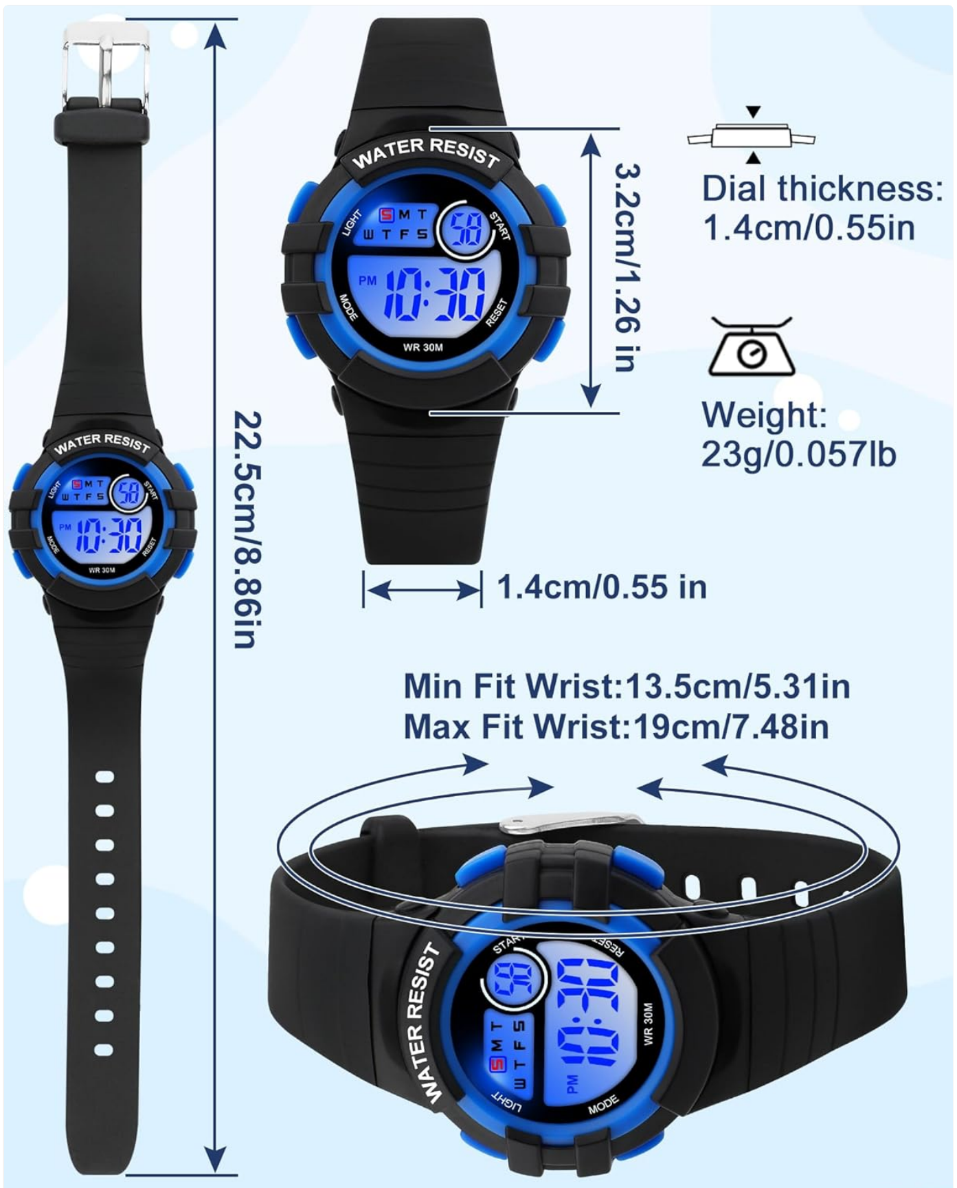
Image: Detailed diagram illustrating the watch's dimensions (dial size, case thickness, strap length, band width) and weight.