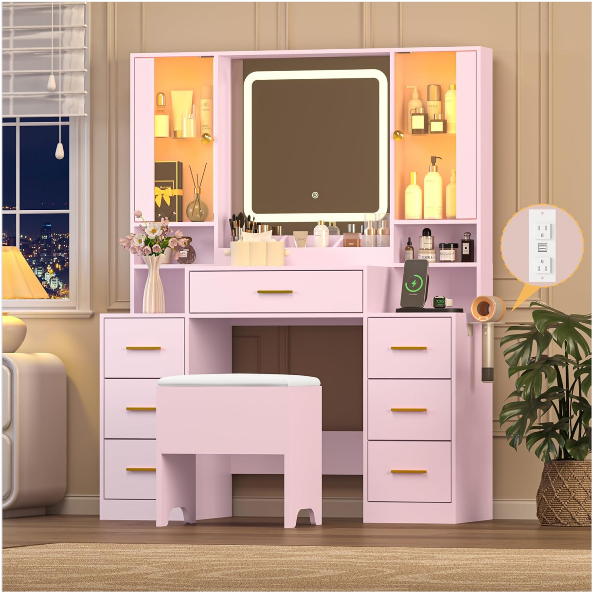
Image: The fully assembled Wodeer Pink Makeup Vanity Desk, showcasing its mirror with lights, drawers, and overall structure.

Video: An overview of the Wodeer Makeup Vanity Desk, demonstrating its features and assembly process.