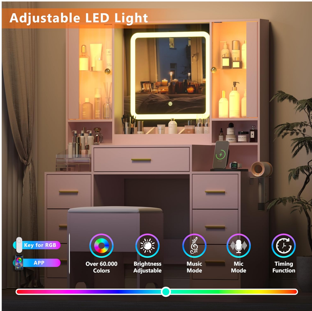
Image: The vanity desk featuring adjustable RGB LED lighting in the glass cabinets, highlighting control options via app or remote, and various modes like color change, brightness, music, mic, and timing functions.