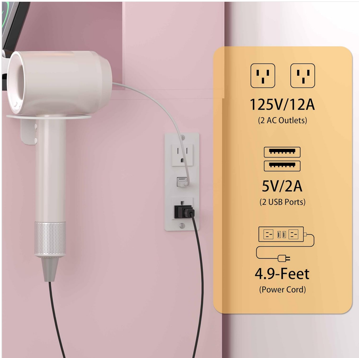
Image: A close-up of the vanity desk's integrated charging station, showing 2 AC outlets and 2 USB ports, along with a hair dryer holder and its power cord.