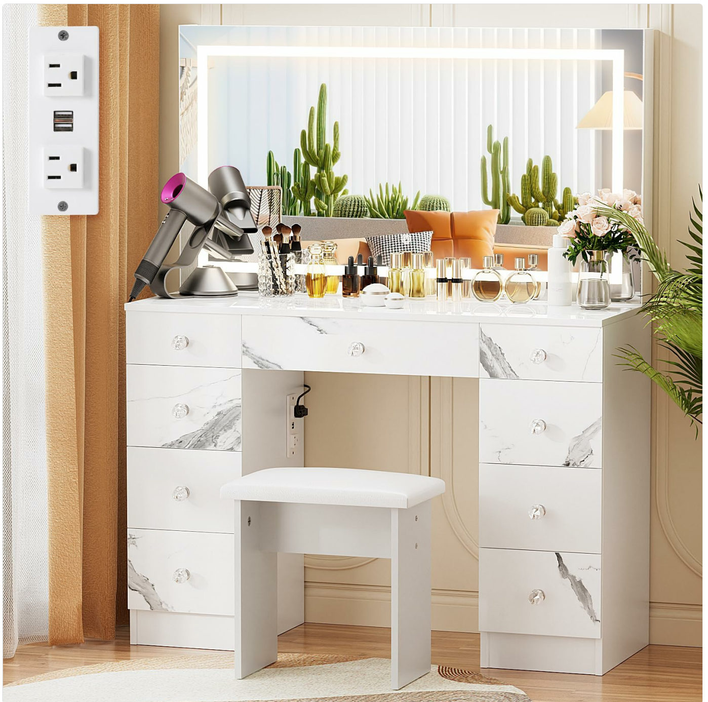
Figure 1: VOWNER Vanity Desk with Lighted Mirror and Stool.