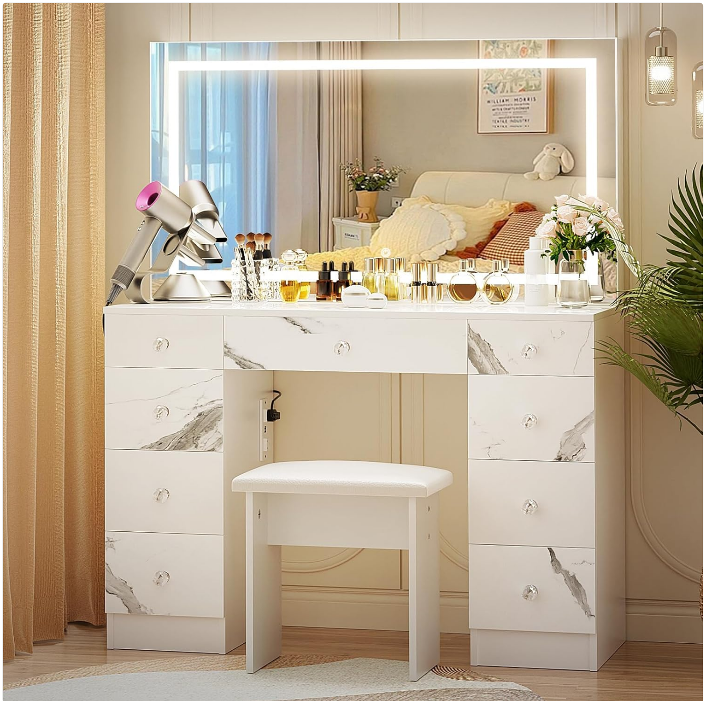
Figure 5: Detail of the built-in power strip for charging and powering devices.