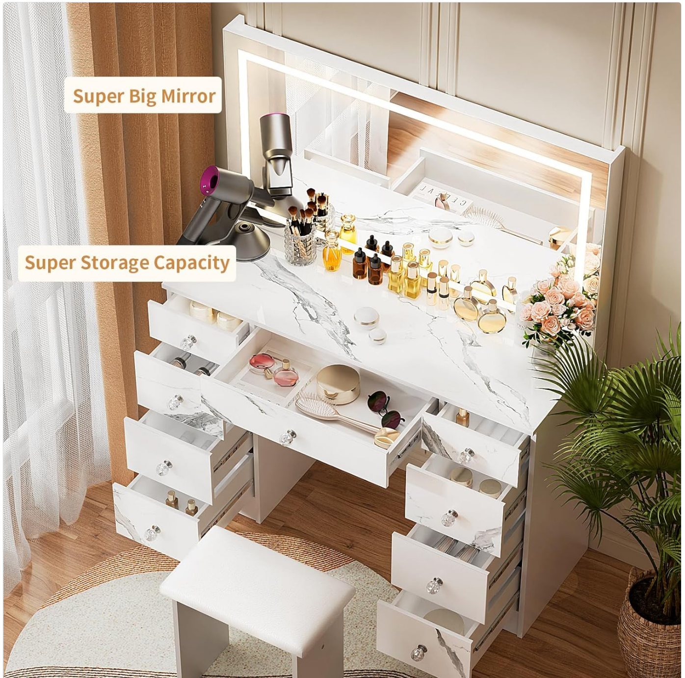
Figure 2: Top-down view highlighting the vanity's storage capacity and desktop space.

Your browser does not support the video tag.