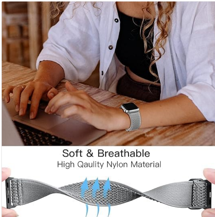
Image 6.1: Features indicating washability and material properties.