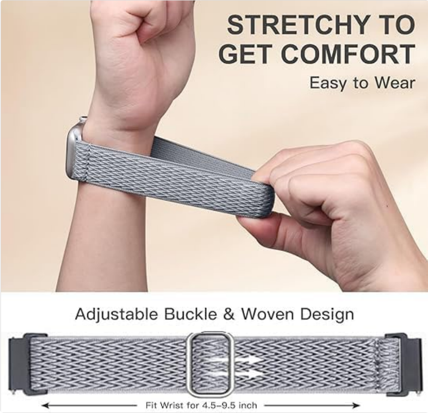
Image 5.1: Demonstrating the stretch and comfort of the watch band.